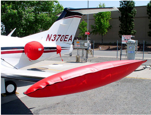
Eclipse Tip Tank & Engine Covers

Designed to prevent damage to the aircraft extremities in crowded hangars, these products are made of bright red Naugahyde and thickly padded with a sandwich of closed cell foam.