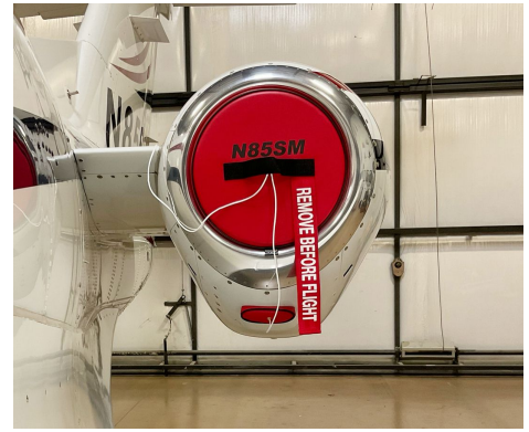
Eclipse EA500 Intake/Exhaust Plugs