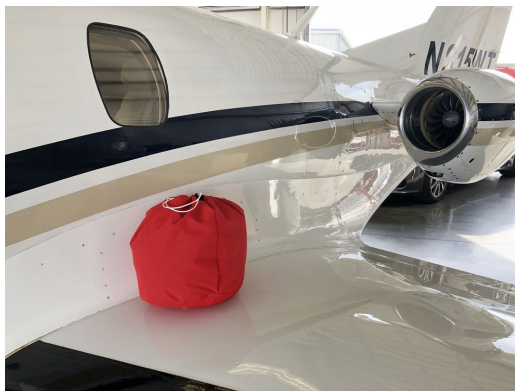
Eclipse EA500, TE500, 550 Travel Cover, Canopy/Nose Cover in Storage bag

This cover type is made from Silver Acrylic Sunbrella canvas and is 100% lined with a soft and smooth microfiber. Bruce's Custom Covers developed this material combination especially for aircraft protection. The outer material is medium weight and treated for water resistance, UV resistance and anti-static buildup. The inner lining is a very soft and smooth microfiber to prevent scratching. The material is very reflective, and tests show that the cabin interior temperature can be reduced to near-ambient temperature on the hottest of days. It is water, ice and snow repellent, yet breathable to allow moisture to escape from between the cover and the aircraft surface.