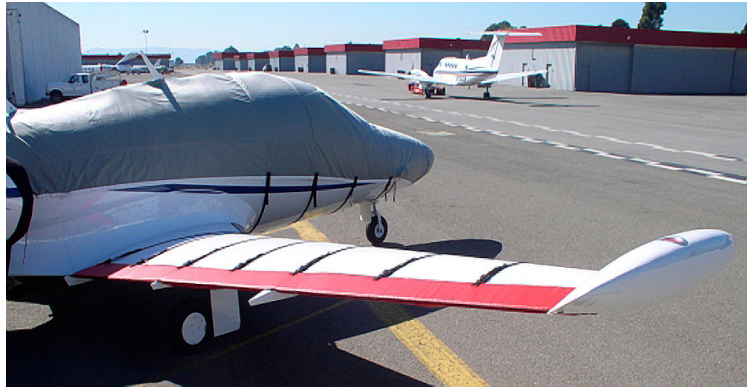
Fuselage Cover with Hail Protection & Wing Control Surfaces Hail Protection Pads