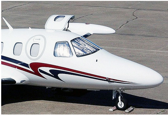
Eclipse Cockpit Heatshields