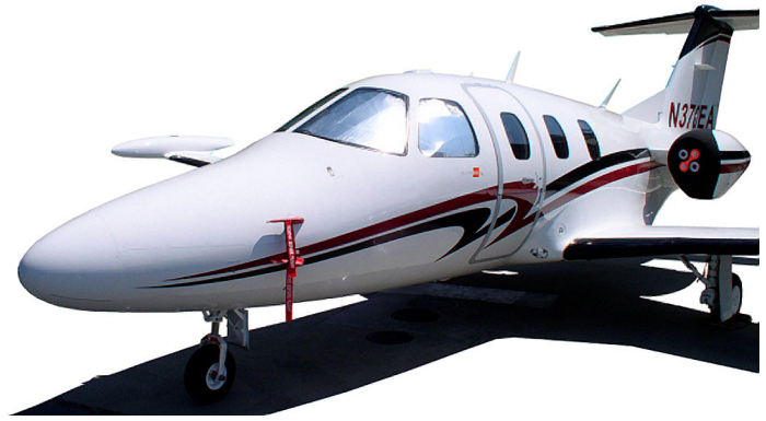
Cockpit HeatShields, Pitot Covers & "Bikini" style Engine Covers