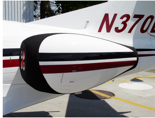
Bikini style Engine Covers