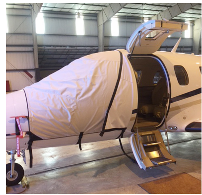
Fuselage Cover & Wing Covers with hail protection on all upper surfaces