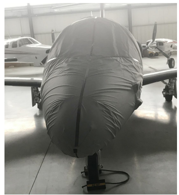
Eclipse EA550 Travel Canopy/Nose Cover