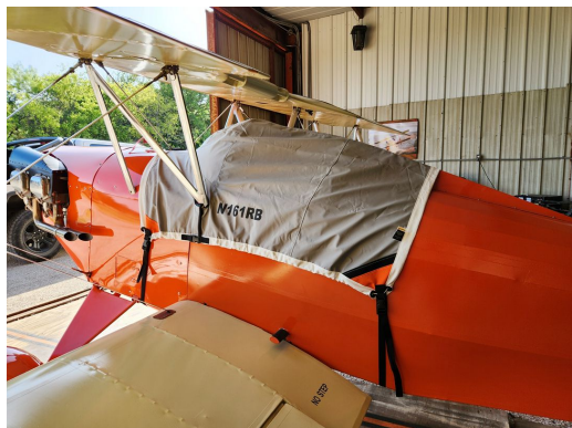
Burt Special Canopy Cover

This cover type is made from Silver Acrylic Sunbrella canvas and is 100% lined with a soft and smooth microfiber. Bruce's Custom Covers developed this material combination especially for aircraft protection. The outer material is medium weight and treated for water resistance, UV resistance and anti-static buildup. The inner lining is a very soft and smooth microfiber to prevent scratching. The material is very reflective, and tests show that the cabin interior temperature can be reduced to near-ambient temperature on the hottest of days. It is water, ice and snow repellent, yet breathable to allow moisture to escape from between the cover and the aircraft surface.