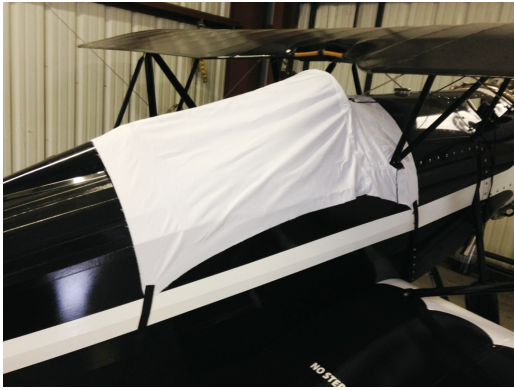
Rose Parrakeet Canopy Cover (test fit cover)

the hottest of days. It is water, ice and snow repellent, yet breathable to allow moisture to escape from between the cover and the aircraft surface.