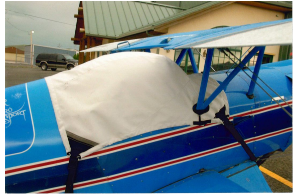
Acro Sport Canopy Cover