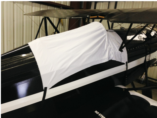
Rose Parrakeet Canopy Cover (test fit cover)