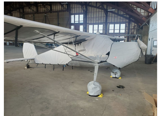
Cessna 140 Canopy, Wings, Prop, Tires & Empennage Covers