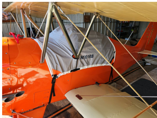
Burt Special Canopy Cover