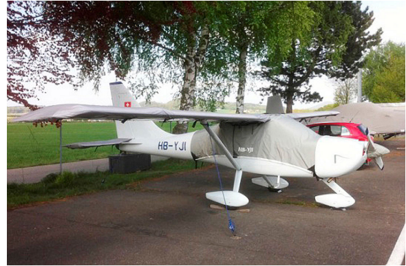
Glasair Aviation Glastar, Sportsman 2+2 Insulated Engine Cover OMF Symphony Canopy, Wings, Horiz. Stab, and Prop Covers