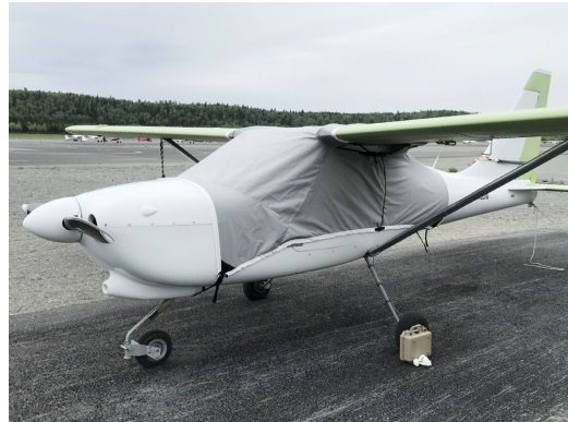
Glasair Aviation Glastar, Sportsman 2+2 Travel Cover, Light Weight Travel Canopy Cover