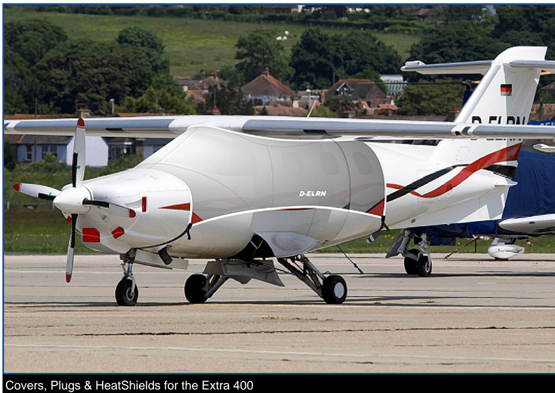
Covers, Plugs &amp; HeatShields for the Extra 400