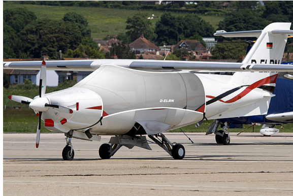
Covers, Plugs & HeatShields for the Extra 400