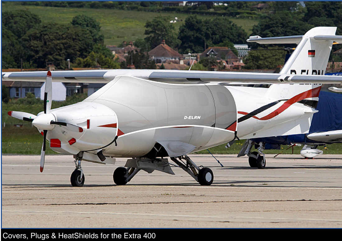
Covers, Plugs & HeatShields for the Extra 400