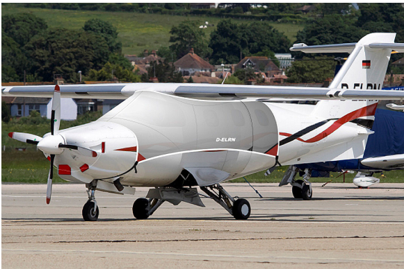
Covers, Plugs & HeatShields for the Extra 400

Engine Inlet Plugs are custom fit for your Extra 400 & 500 intakes, made with heavy-duty vinyl material, and stuffed with a single block of sculpted urethane foam. Each plug has a zipper that allows the foam to be removed and dried if necessary. Engine plugs have warning flags that are visible from the cockpit or 'remove before flight' streamers sewn onto the face of the plugs. Most plugs are imprinted with the aircraft registration number in black for an extra charge. Storage bag NOT included. Engine plugs may be inserted after flight when the engine is still warm. Engine Inlet Plugs are commonly referred to as Cowl Plugs, Intake Plugs, Cowl Blocks, Engine Blocks, and Engine Bungs.