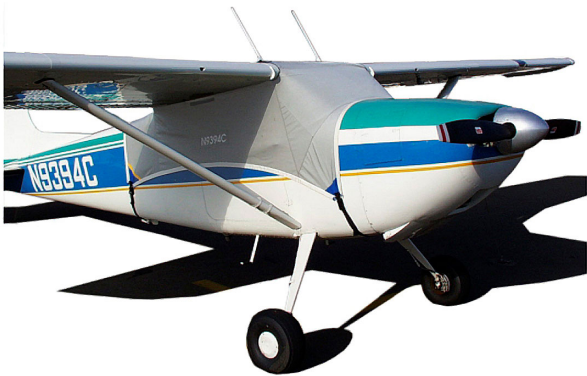
Cessna 180 Canopy Cover