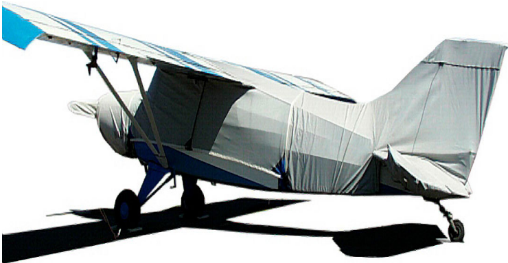
Maule Empennage, Engine & Prop Covers

WINTER USE MATERIAL - Made with Solution-Dyed Polyester fabric, this option is intended for seasonal use to aid in deicing, rain mitigation, or for occasional travel. The material is lighter and more compact, but more susceptible to UV damage and may have a shorter useful life if used continuously outside than the all-year use material.