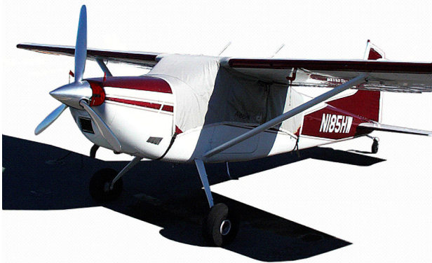
Cessna 185 Over-the-Top Canopy Cover