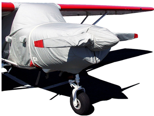
Maule Prop (2 Blade), Engine, & Canopy Cover

This cover type is made from Silver Acrylic Sunbrella canvas and is 100% lined with a soft and smooth microfiber. Bruce's Custom Covers developed this material combination especially for aircraft protection. The outer material is medium weight and treated for water resistance, UV resistance and anti-static buildup. The inner lining is a very soft and smooth microfiber to prevent scratching. The material is very reflective, and tests show that the cabin interior temperature can be reduced to near-ambient temperature on the hottest of days. It is water, ice and snow repellent, yet breathable to allow moisture to escape from between the cover and the aircraft surface.