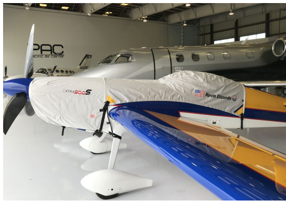
Extra 300S Canopy & Engine Covers