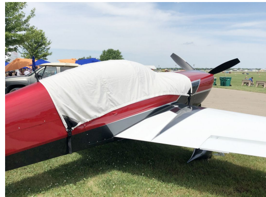
Extra 300 Canopy Cover