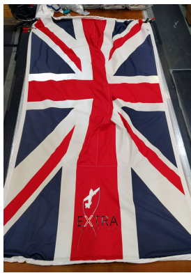
Custom Full-Cover Artwork