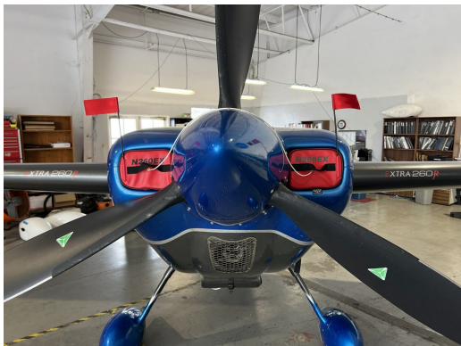
Extra 260 Engine Inlet Plugs

Engine Inlet Plugs are custom fit for your Extra 300, 330SC, 330SX & 200/230 Models intakes, made with heavy-duty vinyl material, and stuffed with a single block of sculpted urethane foam. Each plug has a zipper that allows the foam to be removed and dried if necessary. Engine plugs have warning flags that are visible from the cockpit or 'remove before flight' streamers sewn onto the face of the plugs. Most plugs are imprinted with the aircraft registration number in black for an extra charge. Storage bag NOT included. Engine plugs may be inserted after flight when the engine is still warm. Engine Inlet Plugs are commonly referred to as Cowl Plugs, Intake Plugs, Cowl Blocks, Engine Blocks, and Engine Bungs.