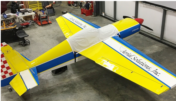
Extra 230 Canopy Cover