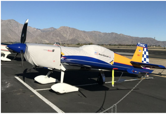
Extra 300S Canopy & Engine Covers