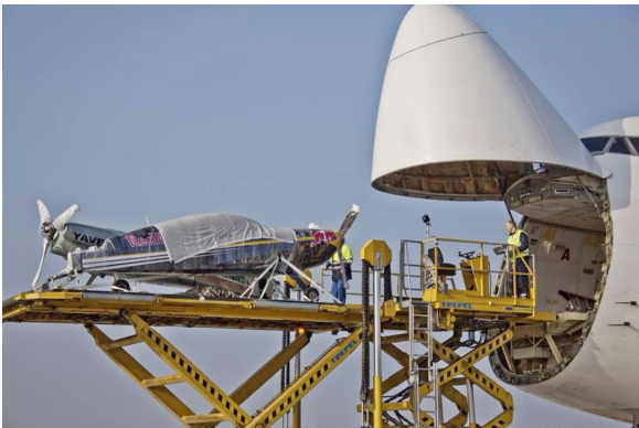
Extra 300 Canopy Cover

This cover type is made from Silver Acrylic Sunbrella canvas and is 100% lined with a soft and smooth microfiber. Bruce's Custom Covers developed this material combination especially for aircraft protection. The outer material is medium weight and treated for water resistance, UV resistance and anti-static buildup. The inner lining is a very soft and smooth microfiber to prevent scratching. The material is very reflective, and tests show that the cabin interior temperature can be reduced to near-ambient temperature on the hottest of days. It is water, ice and snow repellent, yet breathable to allow moisture to escape from between the cover and the aircraft surface.