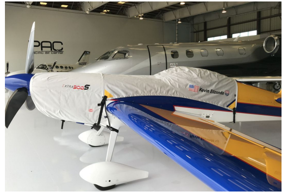
Extra 300S Canopy & Engine Covers