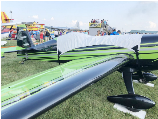
Extra 330 Canopy Cover

This cover type is made from Silver Acrylic Sunbrella canvas and is 100% lined with a soft and smooth microfiber. Bruce's Custom Covers developed this material combination especially for aircraft protection. The outer material is medium weight and treated for water resistance, UV resistance and anti-static buildup. The inner lining is a very soft and smooth microfiber to prevent scratching. The material is very reflective, and tests show that the cabin interior temperature can be reduced to near-ambient temperature on the hottest of days. It is water, ice and snow repellent, yet breathable to allow moisture to escape from between the cover and the aircraft surface.