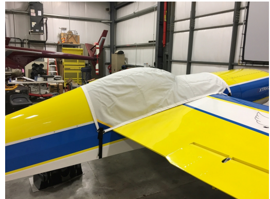
Extra 230 Canopy Cover