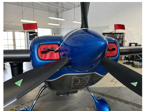
Extra 260 Engine Inlet Plugs