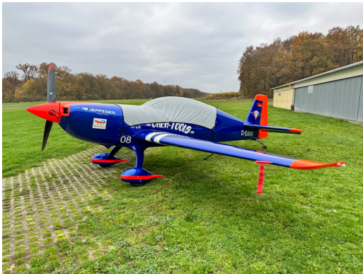
EXTRA 330LT Travel Cover, Light Weight Canopy Cover (2 seat model, Low Wing Models)

Travel Covers are made with Silver Solution-Dyed Polyester fabric and only lined over the windshield to save weight. The material is lightweight and more compact for easy stowage in the aircraft. The polyester material is water resistant, but only intended for occasional use outside. We also have an ultra lightweight material available for fitted hangar dust covers. For daily outdoor use, the non-travel Sunbrella Cover is the best choice.