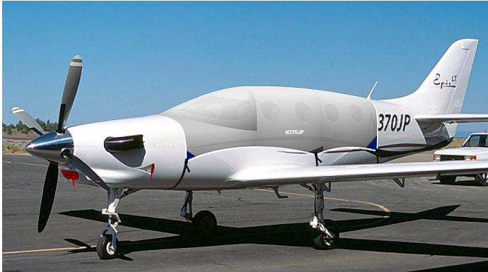
Epic LT Canopy Cover & Engine Plugs