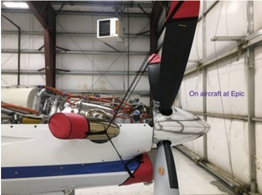
Epic Aircraft Prop Tie, Exhaust & Intake Covers

Engine Inlet Plugs are custom fit for your Epic E1000 intakes, made with heavy-duty vinyl material, and stuffed with a single block of sculpted urethane foam. Each plug has a zipper that allows the foam to be removed and dried if necessary. Engine plugs have warning flags that are visible from the cockpit or 'remove before flight' streamers sewn onto the face of the plugs. Most plugs are imprinted with the aircraft registration number in black for an extra charge. Storage bag NOT included. Engine plugs may be inserted after flight when the engine is still warm. Engine Inlet Plugs are commonly referred to as Cowl Plugs, Intake Plugs, Cowl Blocks, Engine Blocks, and Engine Bungs.