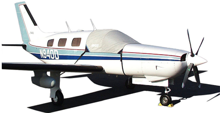
Piper Malibu/Mirage Windshield Cover