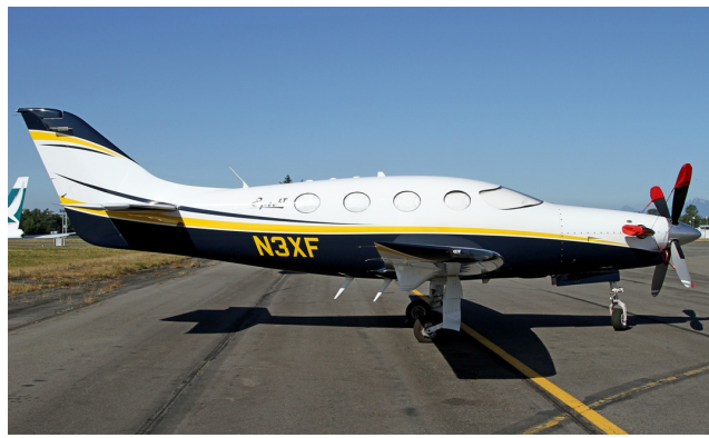
Epic LT Cockpit & Cabin HeatShields