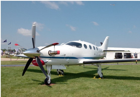
Epic E1000 Fly Away Engine Cover Kit

This cover type is made from Silver Acrylic Sunbrella canvas and is 100% lined with a soft and smooth microfiber. Bruce's Custom Covers developed this material combination especially for aircraft protection. The outer material is medium weight and treated for water resistance, UV resistance and anti-static buildup. The inner lining is a very soft and smooth microfiber to prevent scratching. The material is very reflective, and tests show that the cabin interior temperature can be reduced to near-ambient temperature on the hottest of days. It is water, ice and snow repellent, yet breathable to allow moisture to escape from between the cover and the aircraft surface.