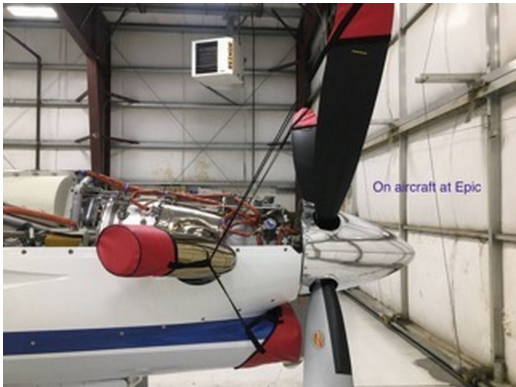
Epic Aircraft Prop Tie, Exhaust & Intake Covers