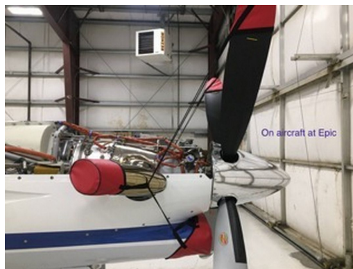
Epic Aircraft Prop Tie, Exhaust & Intake Covers