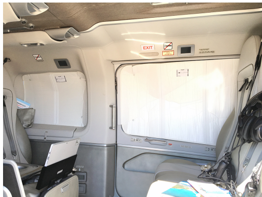
Eurocopter EC-145 Cabin Heatshields

Heatshields are interior sunshades for an aircraft's windows or canopy glass. The product is a unique composite of closed-cell foam with a silver mylar finish. The semi-rigid design is stiff enough to stand along the inside of the windshield using sun visors or window framing. It folds up flat and easily stores in the included storage sleeve. Some designs may require velcro and suction cups. A Heatshield is an excellent short-term remedy for cockpit overheating.