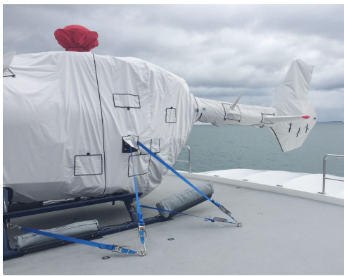
Eurocopter EC-145 D2 Main Body Cover, Tailboom/Fenestron Cover