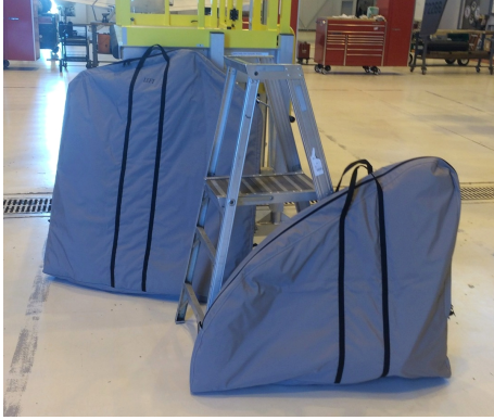
Eurocopter EC-145 Padded Bags for Removable Doors

**Padded Door Bags* are designed to provide portable protection of the doors when they are removed from the aircraft. They are padded to moderate thickness, zippered closed, and have sturdy carry handles for easy transport.