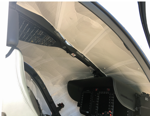
Eurocopter EC-145 Cockpit Heatshields

Heatshields are interior sunshades for an aircraft's windows or canopy glass. The product is a unique composite of closed-cell foam with a silver mylar finish. The semi-rigid design is stiff enough to stand along the inside of the windshield using sun visors or window framing. It folds up flat and easily stores in the included storage sleeve. Some designs may require velcro and suction cups. A Heatshield is an excellent short-term remedy for cockpit overheating.