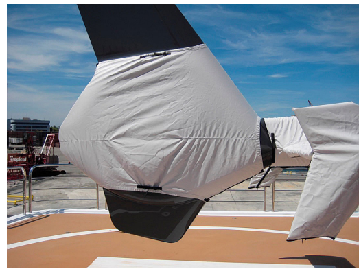
EC-135 Tailfan Cover and Tailboom Stabilizer Cover