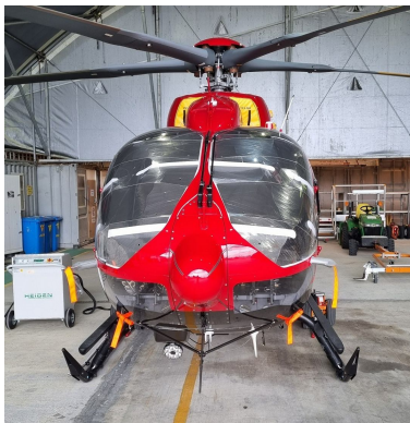
Airbus Helicopter H145D3 Windshield Heatshields, Engine Plugs

Heatshields are interior sunshades for an aircraft's windows or canopy glass. The product is a unique composite of closed-cell foam with a silver mylar finish. The semi-rigid design is stiff enough to stand along the inside of the windshield using sun visors or window framing. It folds up flat and easily stores in the included storage sleeve. Some designs may require velcro and suction cups. A Heatshield is an excellent short-term remedy for cockpit overheating.