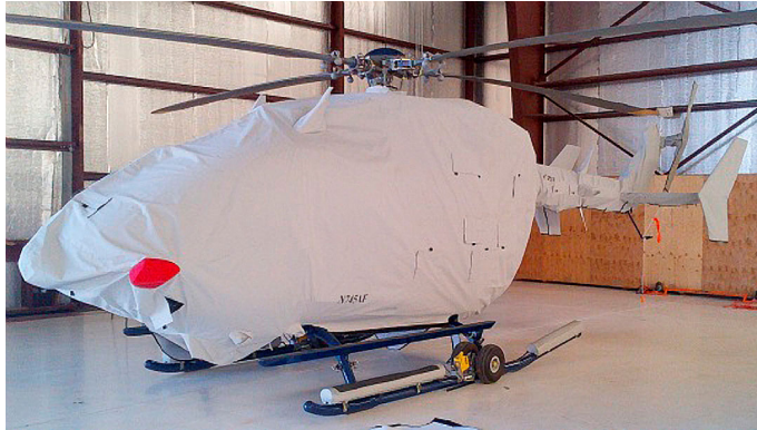
Main Body (also covers bottom), Tailboom, Vertical Pylon, Stabilizers and Tail Rotor Covers

This cover type is made from Silver Acrylic Sunbrella canvas and is 100% lined with a soft and smooth microfiber. Bruce's Custom Covers developed this material combination especially for aircraft protection. The outer material is medium weight and treated for water resistance, UV resistance and anti-static buildup. The inner lining is a very soft and smooth microfiber to prevent scratching. The material is very reflective, and tests show that the cabin interior temperature can be reduced to near-ambient temperature on the hottest of days. It is water, ice and snow repellent, yet breathable to allow moisture to escape from between the cover and the aircraft surface.