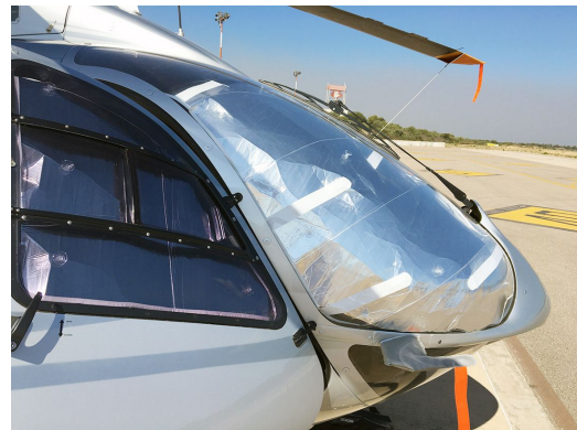
Eurocopter EC-145 Cockpit Heatshields