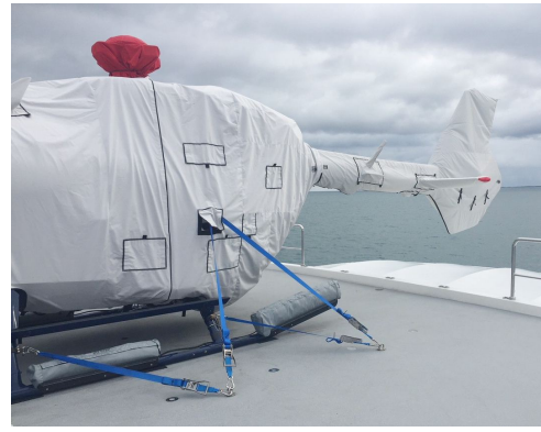
Eurocopter EC-145 D2 Main Body Cover, Tailboom/Fenestron Cover