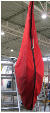
Airbus EC145 Tailfan Housing Fenestron Cover