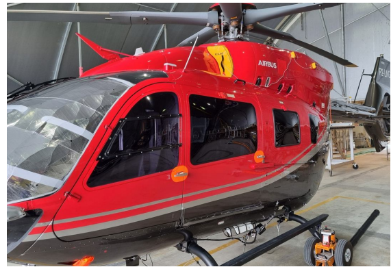
Airbus Helicopter H145D3 Intake Plugs