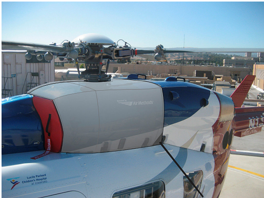
Upper Deck Plugs/Cover

The Engine Inlet Plugs are custom fit for your Eurocopter EC-145, UH-145, BK-117 D-2 intakes, made with heavy-duty vinyl material, and stuffed with a single block of sculpted urethane foam. Each plug has a zipper that allows the foam to be removed and dried if necessary. Engine plugs have 'Remove Before Flight' streamers sewn onto the face of the plugs. Most plugs are imprinted with the aircraft registration number in black for an extra charge. Storage bag NOT included. Engine plugs may be inserted after flight when the engine is still warm. Engine Inlet Plugs are commonly referred to as Cowl Plugs, Intake Plugs, Cowl Blocks, Engine Blocks, and Engine Bungs.