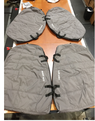
MD 500D Padded Door Bags