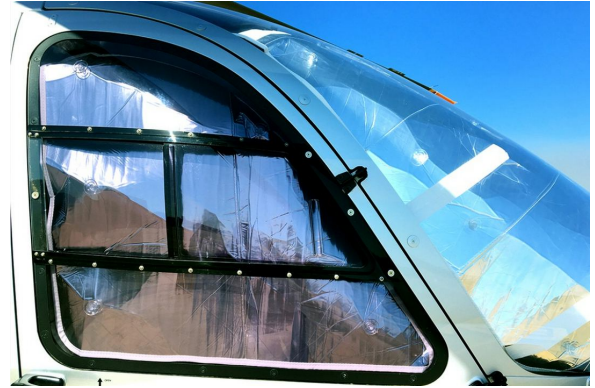
Airbus EC-135 Cockpit HeatShields