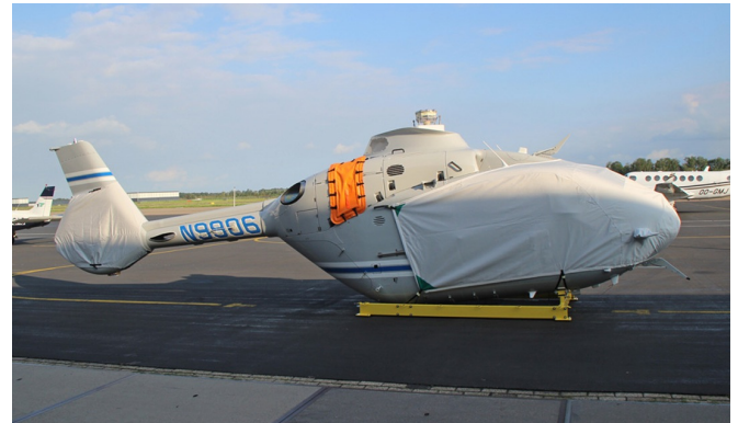
Eurocopter EC-135 Bubble & Tailfan Covers