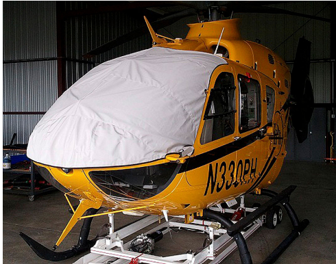
EC-135 Windshield/Skylights Cover, pinches in door jambs

This cover type is made from Silver Acrylic Sunbrella canvas and is 100% lined with a soft and smooth microfiber. Bruce's Custom Covers developed this material combination especially for aircraft protection. The outer material is medium weight and treated for water resistance, UV resistance and anti-static buildup. The inner lining is a very soft and smooth microfiber to prevent scratching. The material is very reflective, and tests show that the cabin interior temperature can be reduced to near-ambient temperature on the hottest of days. It is water, ice and snow repellent, yet breathable to allow moisture to escape from between the cover and the aircraft surface.