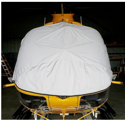
EC-135 Windshield/Skylights Cover, pinches in door jambs