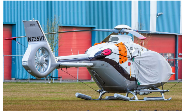
Airbus EC135T3 Blade Tie-Downs