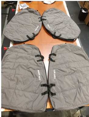
MD 500D Padded Door Bags