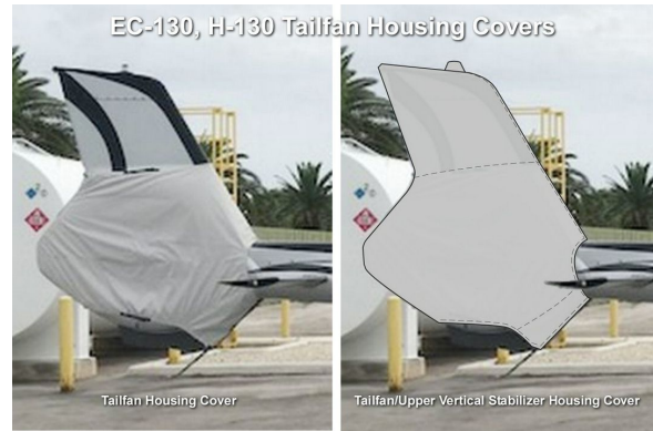
Airbus Helicopter H-130 Tailfan Housing Covers