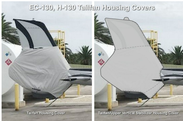
Airbus Helicopter H-130 Tailfan Housing Covers

The Tailboom Cover details vary by model, but generally the helicopter tail boom cover encloses the tail boom from the "bottleneck" to the aft end. They usually also cover the horizontal stabilizers, and are custom made to allow for antennae, lights, and other protrusions. They attach with straps underneath the tail boom. Covers for the vertical and horizontal stabilizers are also available separately. Specific information for each model is available on request.