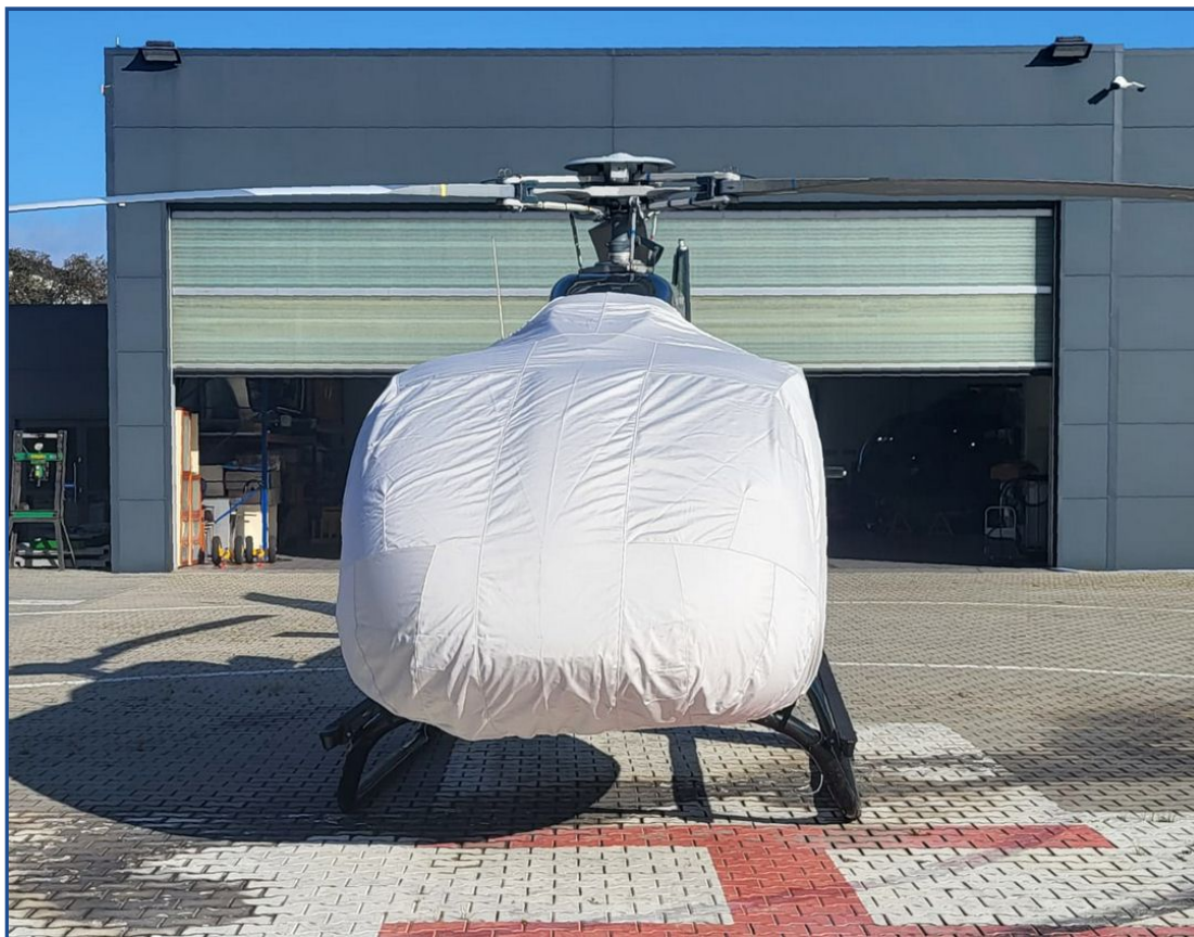
Airbus Helicopter H-130 Bubble Cover, Extends To Cover Fwd Engine Inlet