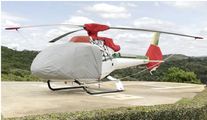
EC130 Bubble, Intake, Exhaust, Rotor Hub & Tailfan Covers

This cover type is made from Silver Acrylic Sunbrella canvas and is 100% lined with a soft and smooth microfiber. Bruce's Custom Covers developed this material combination especially for aircraft protection. The outer material is medium weight and treated for water resistance, UV resistance and anti-static buildup. The inner lining is a very soft and smooth microfiber to prevent scratching. The material is very reflective, and tests show that the cabin interior temperature can be reduced to near-ambient temperature on the hottest of days. It is water, ice and snow repellent, yet breathable to allow moisture to escape from between the cover and the aircraft surface.