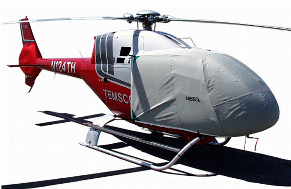
Eurocopter EC-120 Bubble Cover & Tailfan Cover