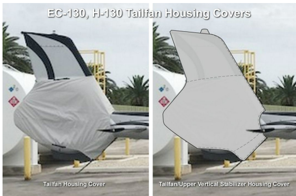
Airbus Helicopter H-130 Tailfan Housing Covers

The Tailboom Cover details vary by model, but generally the helicopter tail boom cover encloses the tail boom from the "bottleneck" to the aft end. They usually also cover the horizontal stabilizers, and are custom made to allow for antennae, lights, and other protrusions. They attach with straps underneath the tail boom. Covers for the vertical and horizontal stabilizers are also available separately. Specific information for each model is available on request.