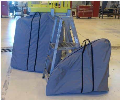
Eurocopter EC-145 Padded Bags for Removable Doors

**Padded Door Bags* are designed to provide portable protection of the doors when they are removed from the aircraft. They are padded to moderate thickness, zippered closed, and have sturdy carry handles for easy transport.