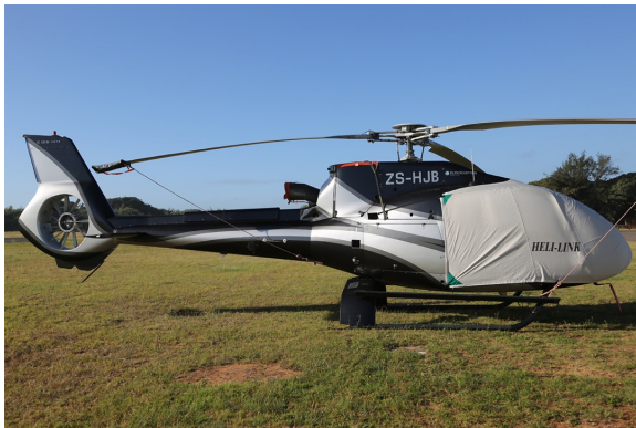
EC-130 Bubble Cover

This cover type is made from Silver Acrylic Sunbrella canvas and is 100% lined with a soft and smooth microfiber. Bruce's Custom Covers developed this material combination especially for aircraft protection. The outer material is medium weight and treated for water resistance, UV resistance and anti-static buildup. The inner lining is a very soft and smooth microfiber to prevent scratching. The material is very reflective, and tests show that the cabin interior temperature can be reduced to near-ambient temperature on the hottest of days. It is water, ice and snow repellent, yet breathable to allow moisture to escape from between the cover and the aircraft surface.