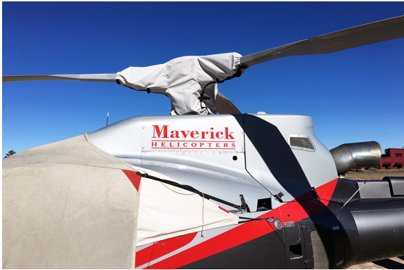
Eurocopter EC-130 Main Rotor Hub Cover

tight at the blade root with straps and quick-release plastic buckles. The Cold Weather Blade Covers are fitted with full-length zippers and optional deice “boots” designed to accept a preheater hose; a small opening at the tip of the cover allows for some air circulation and drainage in freezing weather. Some part numbers have features for an extra charge.