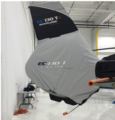
EC-130 Tailfan Cover

The Tailboom Cover details vary by model, but generally the helicopter tail boom cover encloses the tail boom from the "bottleneck" to the aft end. They usually also cover the horizontal stabilizers, and are custom made to allow for antennae, lights, and other protrusions. They attach with straps underneath the tail boom. Covers for the vertical and horizontal stabilizers are also available separately. Specific information for each model is available on request.