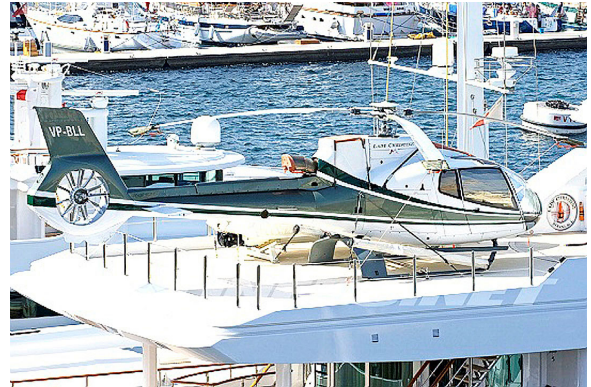
EC-130 Front, Side and Skylight Window HeatShields