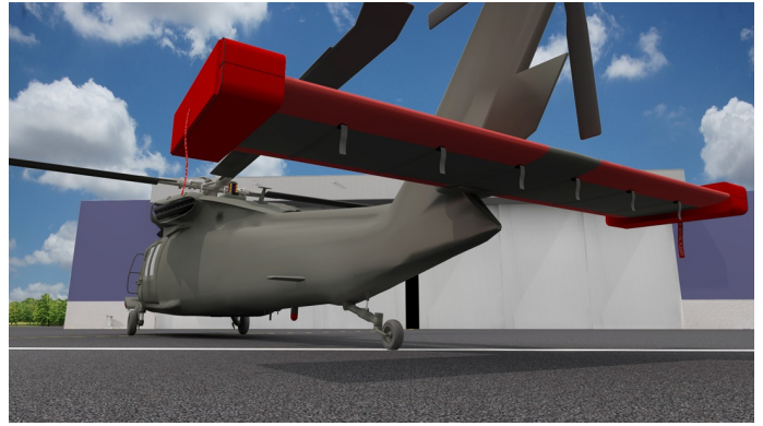
Padded Horizontal Stab Covers, Wingtip Pads (illustration)