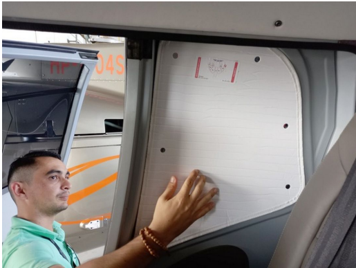
Airbus Helicopter EC130 B4 Side Window Heatshields

Heatshields are interior sunshades for an aircraft's windows or canopy glass. The product is a unique composite of closed-cell foam with a silver mylar finish. The semi-rigid design is stiff enough to stand along the inside of the windshield using sun visors or window framing. It folds up flat and easily stores in the included storage sleeve. Some designs may require velcro and suction cups. A Heatshield is an excellent short-term remedy for cockpit overheating.