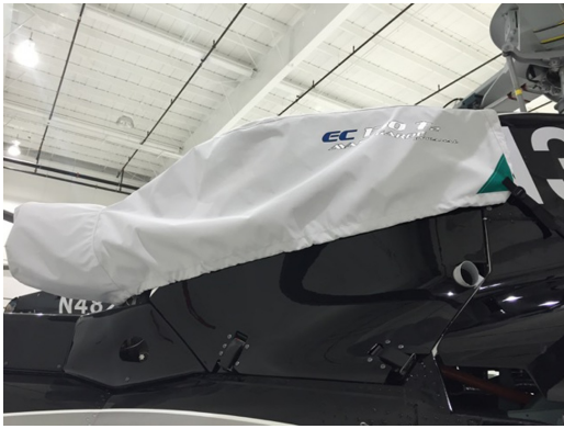
EC-130 Engine Area/Exhaust Cover