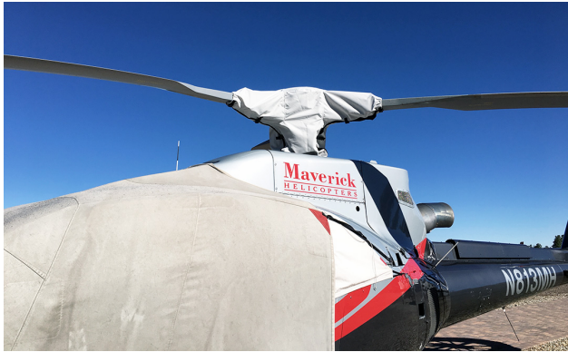
Eurocopter EC-130 Main Rotor Hub Cover

tight at the blade root with straps and quick-release plastic buckles. The Cold Weather Blade Covers are fitted with full-length zippers and optional deice “boots” designed to accept a preheater hose; a small opening at the tip of the cover allows for some air circulation and drainage in freezing weather. Some part numbers have features for an extra charge.