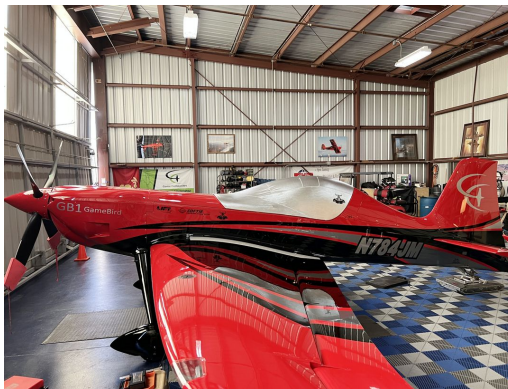
Gamebird GB-1 Solar Cap (single place), CUSTOM COVERS & IMPRINTING AVAILABLE!