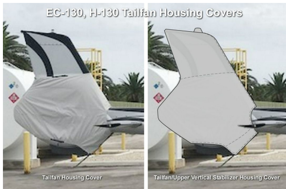
Airbus Helicopter H-130 Tailfan Housing Covers

The Tailboom Cover details vary by model, but generally the helicopter tail boom cover encloses the tail boom from the "bottleneck" to the aft end. They usually also cover the horizontal stabilizers, and are custom made to allow for antennae, lights, and other protrusions. They attach with straps underneath the tail boom. Covers for the vertical and horizontal stabilizers are also available separately. Specific information for each model is available on request.