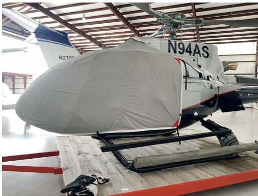
Airbus H-130 Bubble Cover, Travel Weight

This cover type is made from Silver Acrylic Sunbrella canvas and is 100% lined with a soft and smooth microfiber. Bruce's Custom Covers developed this material combination especially for aircraft protection. The outer material is medium weight and treated for water resistance, UV resistance and anti-static buildup. The inner lining is a very soft and smooth microfiber to prevent scratching. The material is very reflective, and tests show that the cabin interior temperature can be reduced to near-ambient temperature on the hottest of days. It is water, ice and snow repellent, yet breathable to allow moisture to escape from between the cover and the aircraft surface.