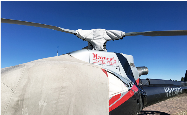
Eurocopter EC-130 Main Rotor Hub Cover

circulation and drainage in freezing weather. Some part numbers have features for an extra charge.