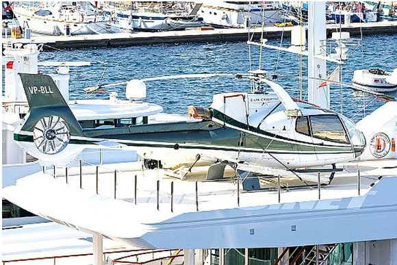
EC-130 Front, Side and Skylight Window HeatShields