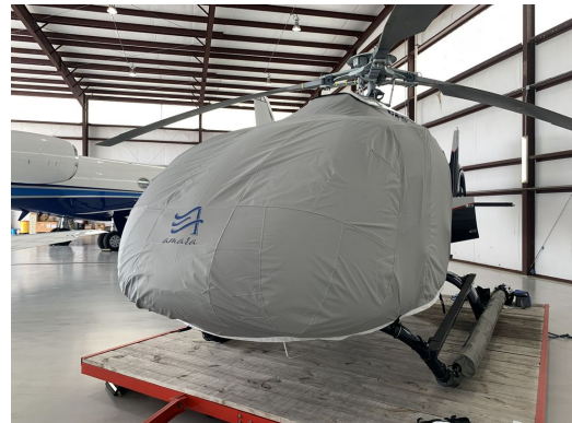
Airbus H-130 Bubble Cover, Travel Weight