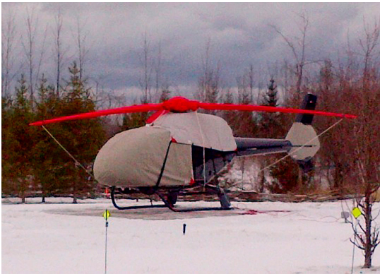
EC-130 Bubble, Engine, Rotor Hub, Blade & Tailfan Covers