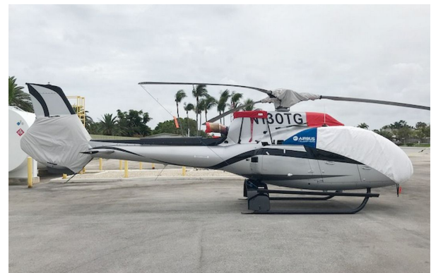
AIRBUS H130 T2, Intake, Exhaust & Tailfan Covers