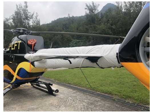
Eurocopter EC-120B Tailboom Cover