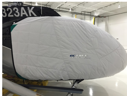
EC-130 Insulated Bubble Cover