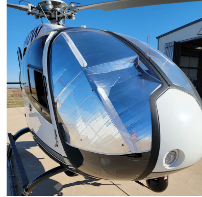
Eurocopter EC-120 Windshield HeatShields