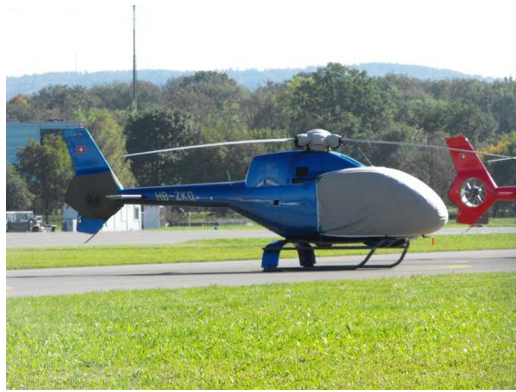
EC-130 Bubble, Tailfan, and Rotor Hub Cover

The Tailboom Cover details vary by model, but generally the helicopter tail boom cover encloses the tail boom from the "bottleneck" to the aft end. They usually also cover the horizontal stabilizers, and are custom made to allow for antennae, lights, and other protrusions. They attach with straps underneath the tail boom. Covers for the vertical and horizontal stabilizers are also available separately. Specific information for each model is available on request.