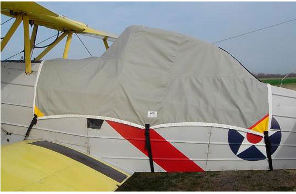
Grumman Ag Cat Canopy Cover