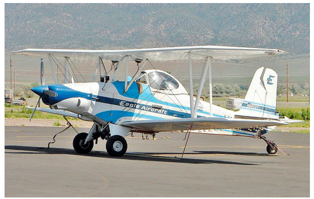
Covers for the Eagle DW-1