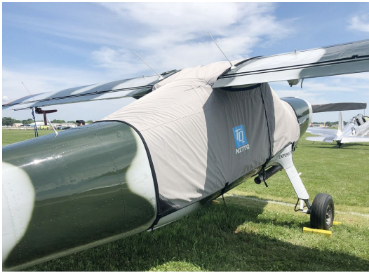
Dornier DO-27 Canopy Cover