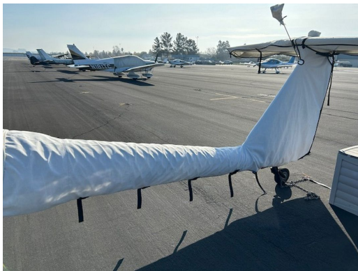
Dimona HK-36 Empennage Cover Set

WINTER USE MATERIAL - Made with Solution-Dyed Polyester fabric, this option is intended for seasonal use to aid in deicing, rain mitigation, or for occasional travel. The material is lighter and more compact, but more susceptible to UV damage and may have a shorter useful life if used continuously outside than the all-year use material.