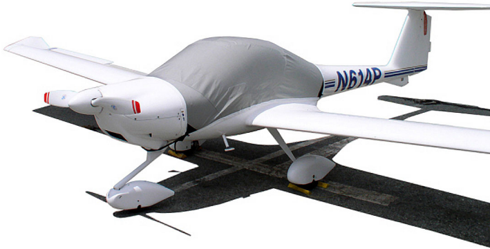
Diamond DA-20 Canopy Cover

The Diamond HK-36, Super Dimona & Extreme Canopy/Engine Cover is a one-piece cover (100% lined with microfiber) that is a combination of the Canopy Cover and Engine Cover. This cover will enclose the engine cowl and will extend aft to cover all of the windows. This cover type is made from Silver Acrylic Sunbrella canvas and is 100% lined with a soft and smooth microfiber. Bruce's Custom Covers developed this material combination especially for aircraft protection. The outer material is medium weight and treated for water resistance, UV resistance and anti-static buildup. The inner lining is a very soft and smooth microfiber to prevent scratching. The material is very reflective, and tests show that the cabin interior temperature can be reduced to near-ambient temperature on the hottest of days. It is water, ice and snow repellent, yet breathable to allow moisture to escape from between the cover and the aircraft surface.