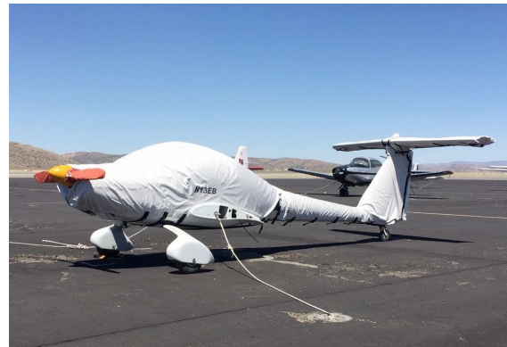
Dimona HK-36 Extended Canopy/Engine Cover, Empennage Cover Set