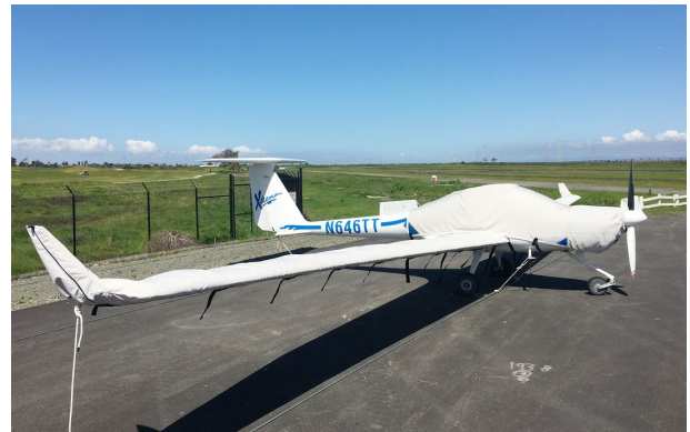
Dimona/Diamond HK36 Extreme Canopy/Engine, Wing Covers