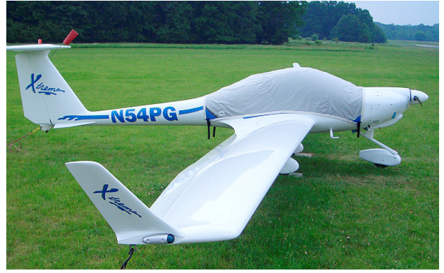
Dimona Xtreme Canopy Cover