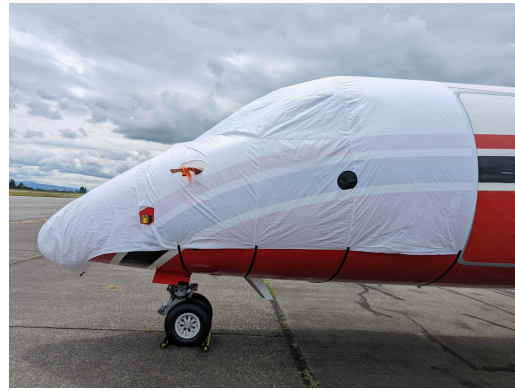
DeHavilland Dash 8, Q400 Cockpit/Nose Cover, test fit cover