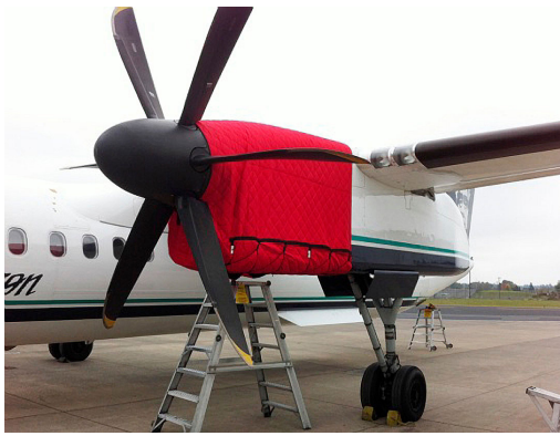
Dash 8-Q400 Insulated Engine Cover