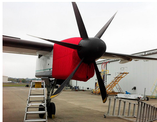
Dash 8-Q400 Insulated Engine Cover