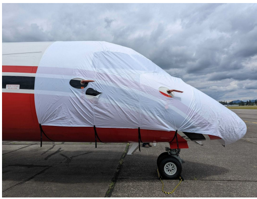
DeHavilland Dash 8, Q400 Cockpit/Nose Cover, test fit cover