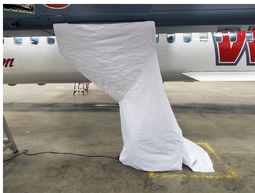
Q400, Main gear landing/tire covers - Cold Weather Ops

The DeHavilland Dash 8 Series 100, 200, 300 Tailcone Cover fits onto the tailcone area to cover the holes that birds can fly into and nest. The cover easily straps onto the leading edge of the horizontal stabilizer with padded hooks or overlaps with the elevators slightly and attaches under the horizontal stabilizers with adjustable straps. Tailcone Covers are normally made with Solution-Dyed Polyester or Acrylic Sunbrella .