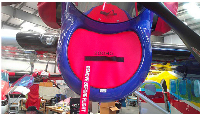
De Havilland Twin Otter Engine Inlet Plug and Exhaust Covers