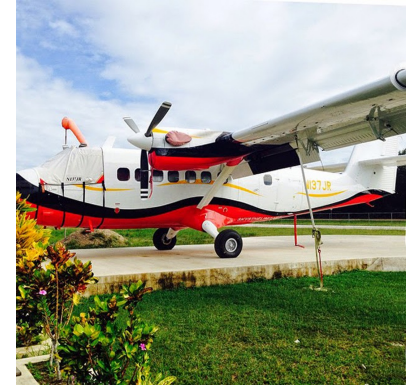
DeHavilland Twin Otter DHC6 (UV-18A) Cockpit Cover (CUSTOM COLOR)