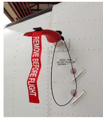
De Havilland DH-6 Twin Otter Pitot Cover, Static Air Plugs