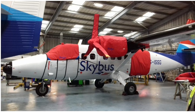
DeHavilland Twin Otter DHC6 (UV-18A) Cockpit Cover (CUSTOM COLOR)