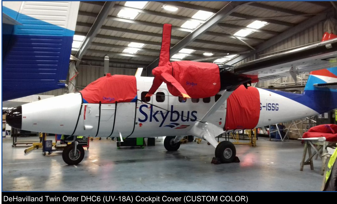
DeHavilland Twin Otter DHC6 (UV-18A) Cockpit Cover (CUSTOM COLOR)