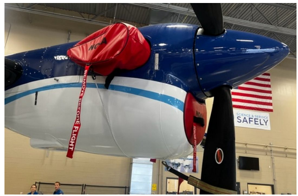
DeHavilland Twin Otter DHC6 Intake Plug, Exhaust Covers