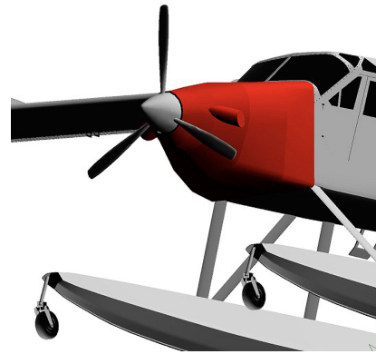
Turbo Beaver Insulated Engine Cover, 3D model