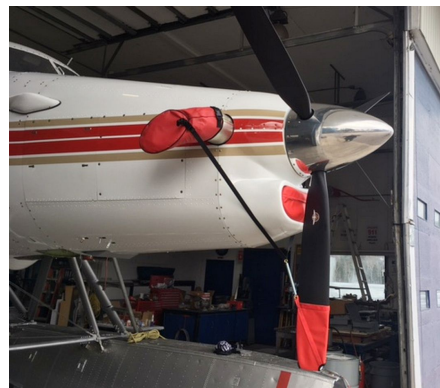
DeHavilland Turbin Otter Intake plugs, Prop Tie/Exhaust Covers