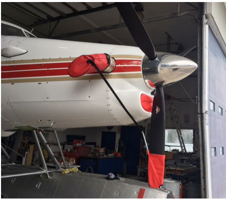
DeHavilland Turbin Otter Intake plugs, Prop Tie/Exhaust Covers