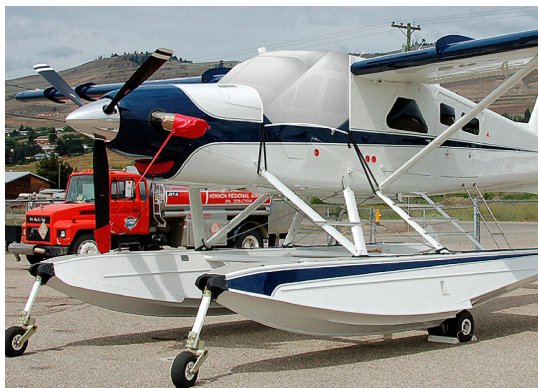
Turbo Beaver Cockpit Cover, Prop Tie/Exhaust Covers, Engine Plug