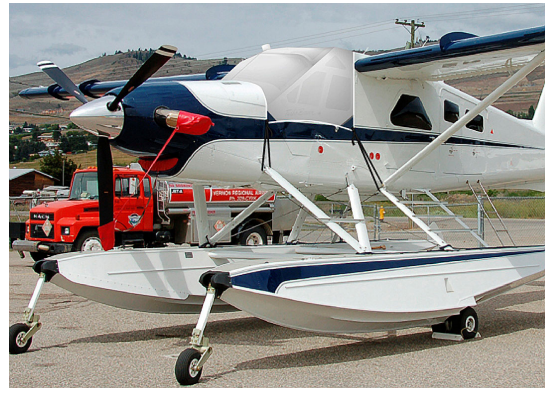
Turbo Beaver Cockpit Cover, Prop Tie/Exhaust Covers, Engine Plug