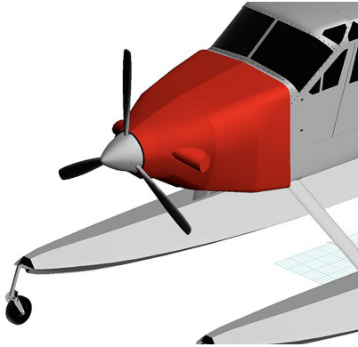
Turbo Beaver Insulated Engine Cover, 3D model

The material is very reflective, and tests show that the cabin interior temperature can be reduced to near-ambient temperature on the hottest of days. It is water, ice and snow repellent, yet breathable to allow moisture to escape from between the cover and the aircraft surface.