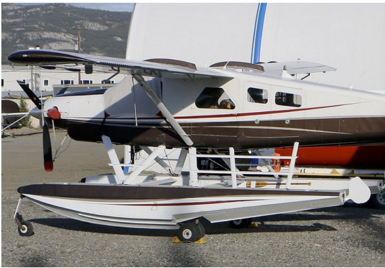
DeHavilland Turbo Beaver Cockpit Covers

This cover type is made from Silver Acrylic Sunbrella canvas and is 100% lined with a soft and smooth microfiber. Bruce's Custom Covers developed this material combination especially for aircraft protection. The outer material is medium weight and treated for water resistance, UV resistance and anti-static buildup. The inner lining is a very soft and smooth microfiber to prevent scratching. The material is very reflective, and tests show that the cabin interior temperature can be reduced to near-ambient temperature on the hottest of days. It is water, ice and snow repellent, yet breathable to allow moisture to escape from between the cover and the aircraft surface.