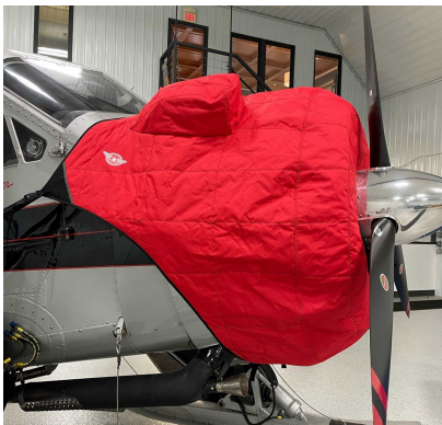
DeHavilland Beaver Insulated Engine Cover