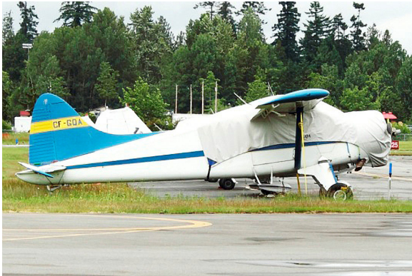
Beaver Canopy/Engine Cover

Travel Covers are made with Silver Solution-Dyed Polyester fabric and only lined over the windshield to save weight. The material is lightweight and more compact for easy stowage in the aircraft. The polyester material is water resistant, but only intended for occasional use outside. We also have an ultra lightweight material available for fitted hangar dust covers. For daily outdoor use, the non-travel Sunbrella Cover is the best choice.