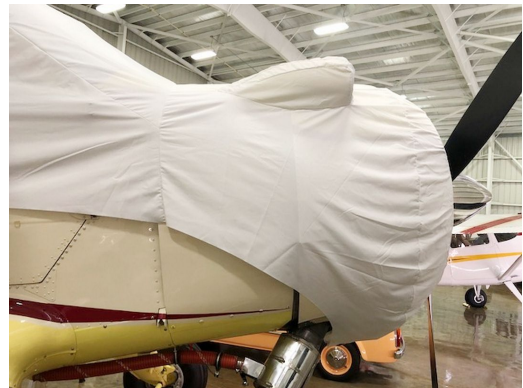
De Havilland Beaver Canopy/Engine Cover, test fit cover