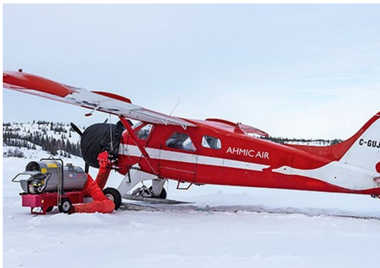
DeHavilland DH-2 Beaver Insulated Engine Cover

This cover type is made from Silver Acrylic Sunbrella canvas and is 100% lined with a soft and smooth microfiber. Bruce's Custom Covers developed this material combination especially for aircraft protection. The outer material is medium weight and treated for water resistance, UV resistance and anti-static buildup. The inner lining is a very soft and smooth microfiber to prevent scratching. The material is very reflective, and tests show that the cabin interior temperature can be reduced to near-ambient temperature on the hottest of days. It is water, ice and snow repellent, yet breathable to allow moisture to escape from between the cover and the aircraft surface.