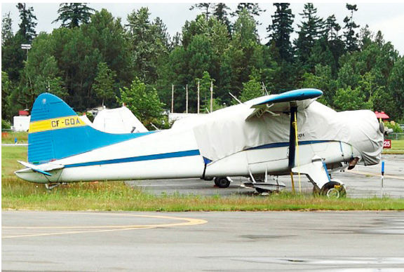
Beaver Canopy/Engine Cover

This cover type is made from Silver Acrylic Sunbrella canvas and is 100% lined with a soft and smooth microfiber. Bruce's Custom Covers developed this material combination especially for aircraft protection. The outer material is medium weight and treated for water resistance, UV resistance and anti-static buildup. The inner lining is a very soft and smooth microfiber to prevent scratching. The material is very reflective, and tests show that the cabin interior temperature can be reduced to near-ambient temperature on the hottest of days. It is water, ice and snow repellent, yet breathable to allow moisture to escape from between the cover and the aircraft surface.