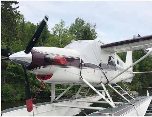
DeHavilland Turbo Beaver Cockpit Cover and Inlet Plug

Engine Inlet Plugs are custom fit for your DeHavilland Beaver DHC-2, U-6A, U-6B intakes, made with heavy-duty vinyl material, and stuffed with a single block of sculpted urethane foam. Each plug has a zipper that allows the foam to be removed and dried if necessary. Engine plugs have warning flags that are visible from the cockpit or 'remove before flight' streamers sewn onto the face of the plugs. Most plugs are imprinted with the aircraft registration number in black for an extra charge. Storage bag NOT included. Engine plugs may be inserted after flight when the engine is still warm. Engine Inlet Plugs are commonly referred to as Cowl Plugs, Intake Plugs, Cowl Blocks, Engine Blocks, and Engine Bungs.