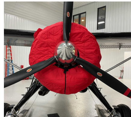
DeHavilland Beaver Insulated Engine Cover