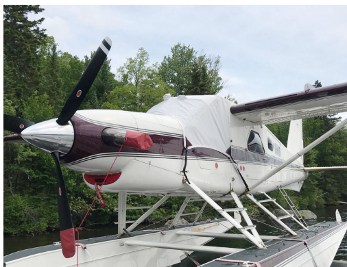
DeHavilland Turbo Beaver Cockpit Cover and Inlet Plug

Engine Inlet Plugs are custom fit for your DeHavilland Beaver DHC-2, U-6A, U-6B intakes, made with heavy-duty vinyl material, and stuffed with a single block of sculpted urethane foam. Each plug has a zipper that allows the foam to be removed and dried if necessary. Engine plugs have warning flags that are visible from the cockpit or 'remove before flight' streamers sewn onto the face of the plugs. Most plugs are imprinted with the aircraft registration number in black for an extra charge. Storage bag NOT included. Engine plugs may be inserted after flight when the engine is still warm. Engine Inlet Plugs are commonly referred to as Cowl Plugs, Intake Plugs, Cowl Blocks, Engine Blocks, and Engine Bungs.