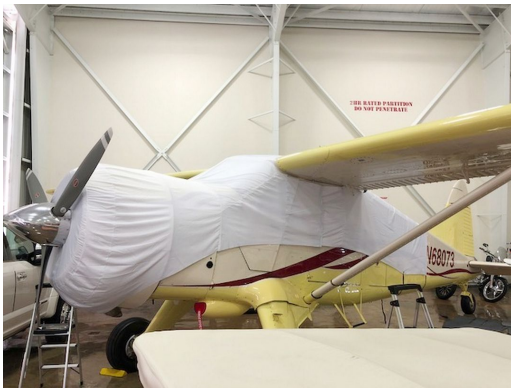
De Havilland Beaver Canopy/Engine Cover, test fit cover

This cover type is made from Silver Acrylic Sunbrella canvas and is 100% lined with a soft and smooth microfiber. Bruce's Custom Covers developed this material combination especially for aircraft protection. The outer material is medium weight and treated for water resistance, UV resistance and anti-static buildup. The inner lining is a very soft and smooth microfiber to prevent scratching. The material is very reflective, and tests show that the cabin interior temperature can be reduced to near-ambient temperature on the hottest of days. It is water, ice and snow repellent, yet breathable to allow moisture to escape from between the cover and the aircraft surface.