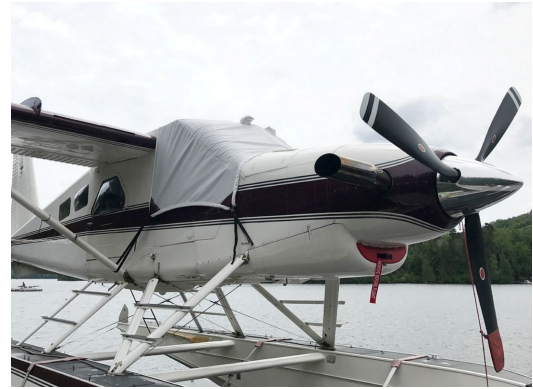
DeHavilland Turbo Beaver Cockpit Cover and Inlet Plug