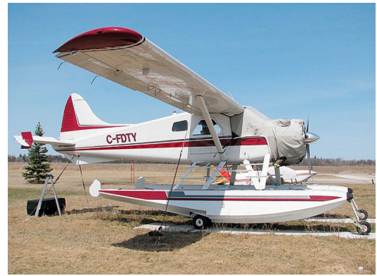
Beaver Windshield/Engine Cover