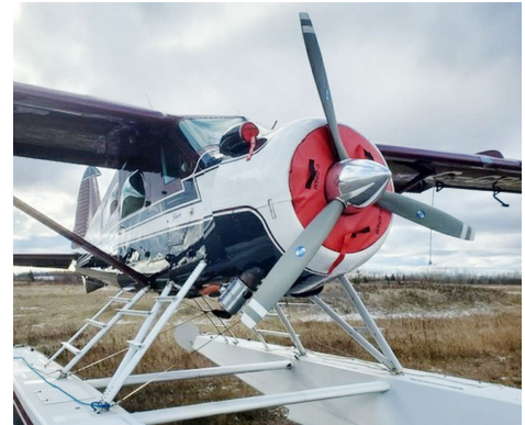
DeHavilland DH2 Beaver Engine Plugs