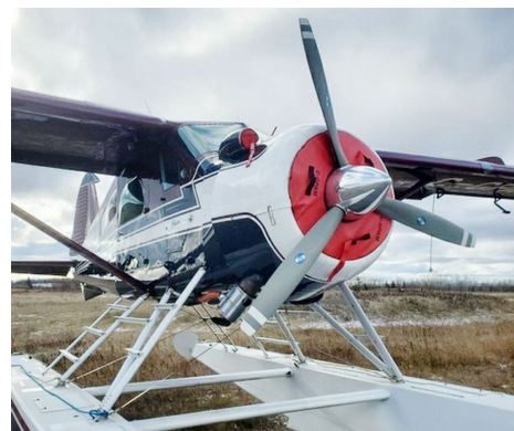
DeHavilland DH2 Beaver Engine Plugs