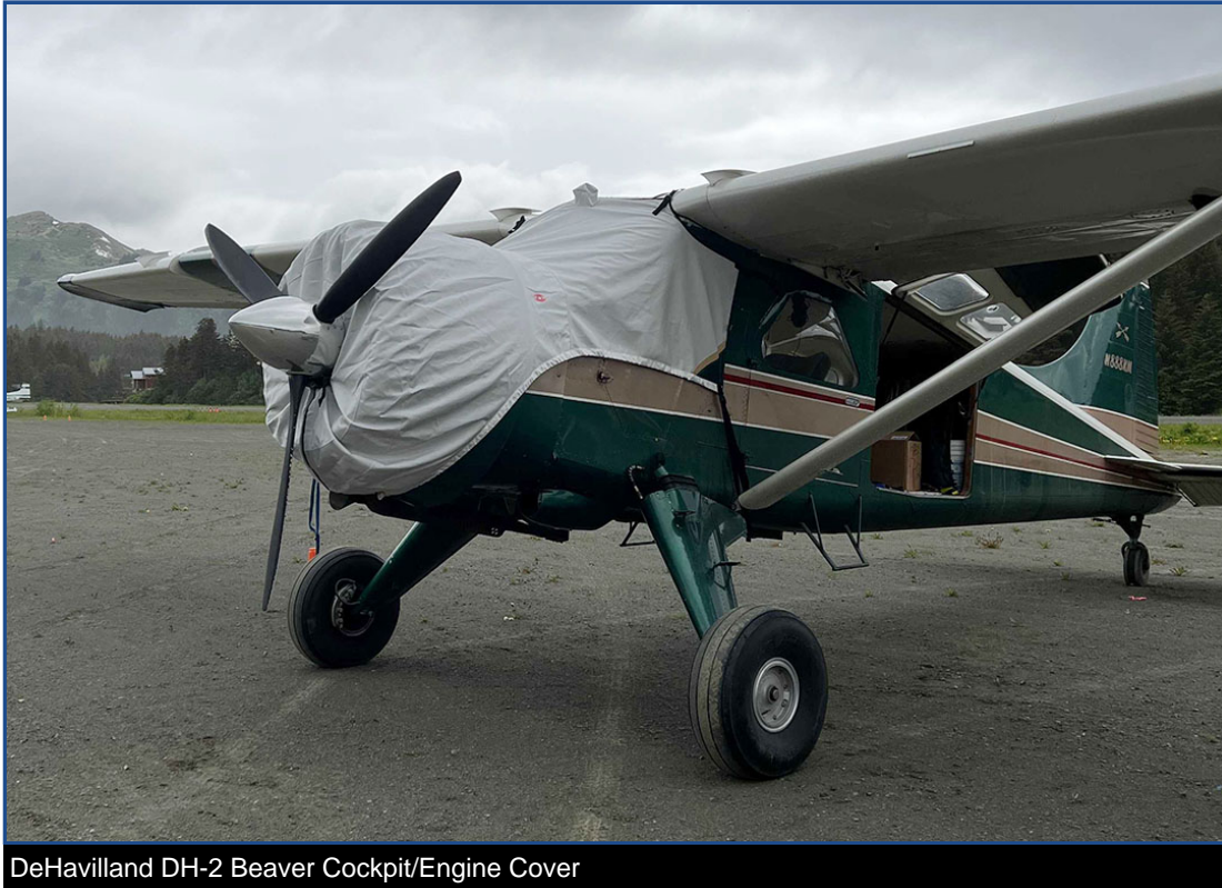
DeHavilland DH-2 Beaver Cockpit/Engine Cover