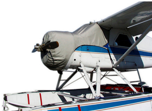
Beaver Windshield/Engine Cover