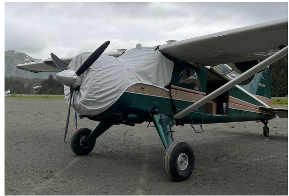
DeHavilland DH-2 Beaver Cockpit/Engine Cover