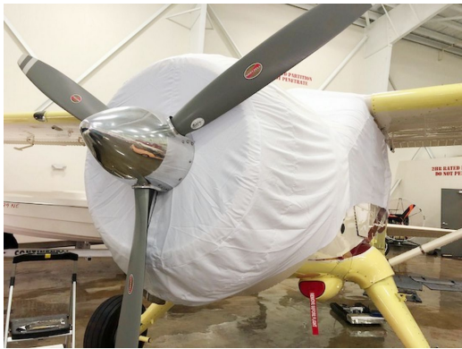
De Havilland Beaver Canopy/Engine Cover, test fit cover

This cover type is made from Silver Acrylic Sunbrella canvas and is 100% lined with a soft and smooth microfiber. Bruce's Custom Covers developed this material combination especially for aircraft protection. The outer material is medium weight and treated for water resistance, UV resistance and anti-static buildup. The inner lining is a very soft and smooth microfiber to prevent scratching. The material is very reflective, and tests show that the cabin interior temperature can be reduced to near-ambient temperature on the hottest of days. It is water, ice and snow repellent, yet breathable to allow moisture to escape from between the cover and the aircraft surface.