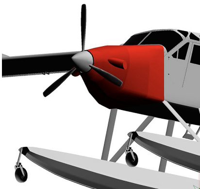
Turbo Beaver Insulated Engine Cover, 3D model

This cover type is made from Silver Acrylic Sunbrella canvas and is 100% lined with a soft and smooth microfiber. Bruce's Custom Covers developed this material combination especially for aircraft protection. The outer material is medium weight and treated for water resistance, UV resistance and anti-static buildup. The inner lining is a very soft and smooth microfiber to prevent scratching. The material is very reflective, and tests show that the cabin interior temperature can be reduced to near-ambient temperature on the hottest of days. It is water, ice and snow repellent, yet breathable to allow moisture to escape from between the cover and the aircraft surface.