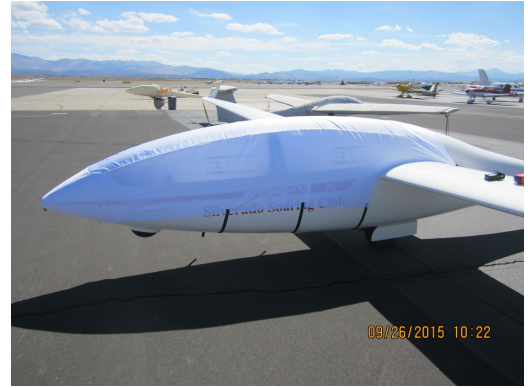
DG-505 Canopy/Nose Cover (test fit cover)