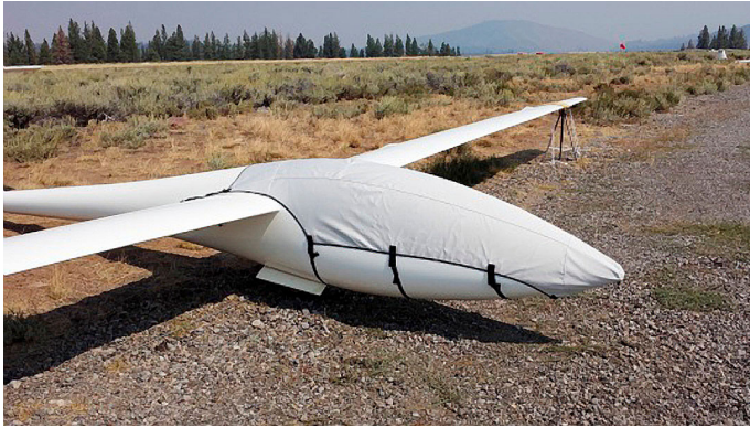
ASW-20C Canopy/Nose Cover