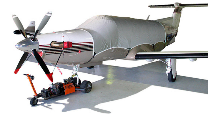
PC-12 Canopy Cover, Engine Plugs, Prop Tie/Exhaust Covers