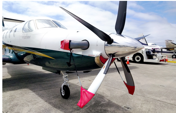
PC-12 Canopy Cover, Engine Plugs, Prop Tie/Exhaust Covers Main Intake Plug and Prop-Tie/Exhaust Covers. (Sold Separately)