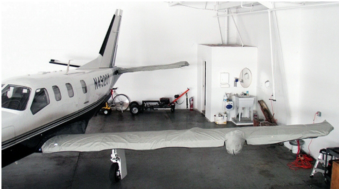
Pilatus PC-12 Wing Covers

WINTER USE MATERIAL - Made with Solution-Dyed Polyester fabric, this option is intended for seasonal use to aid in deicing, rain mitigation, or for occasional travel. The material is lighter and more compact, but more susceptible to UV damage and may have a shorter useful life if used continuously outside than the all-year use material.