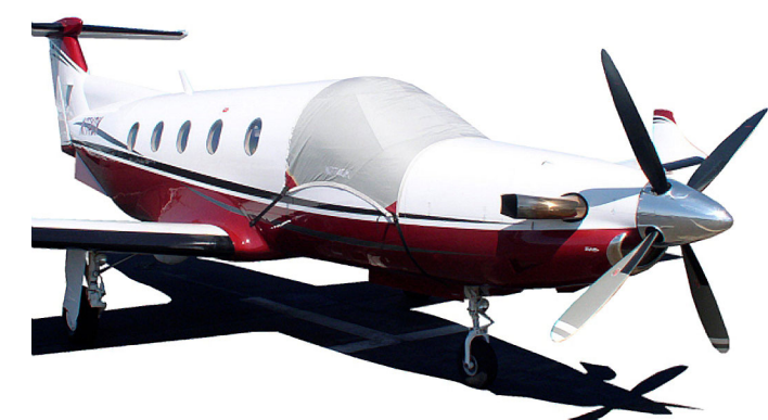
PC-12 Windshield Cover

This cover type is made from Silver Acrylic Sunbrella canvas and is 100% lined with a soft and smooth microfiber. Bruce's Custom Covers developed this material combination especially for aircraft protection. The outer material is medium weight and treated for water resistance, UV resistance and anti-static buildup. The inner lining is a very soft and smooth microfiber to prevent scratching. The material is very reflective, and tests show that the cabin interior temperature can be reduced to near-ambient temperature on the hottest of days. It is water, ice and snow repellent, yet breathable to allow moisture to escape from between the cover and the aircraft surface.