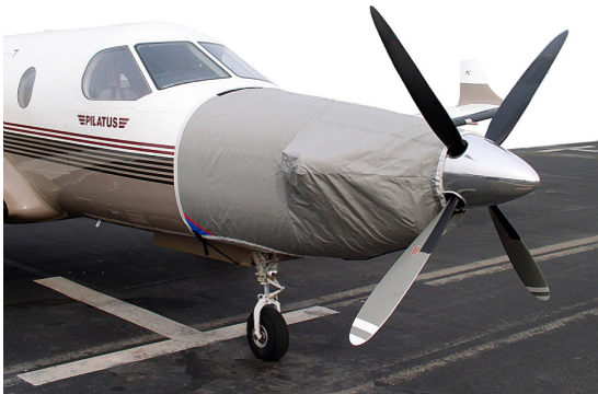
Pilatus PC-12 Engine Cover