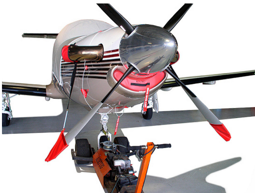
Pilatus PC-12 LARGE ENGINE INLET PLUG, SMALL PLUGS SET, Prop Tie/Exhaust Covers

This cover type is made from Silver Acrylic Sunbrella canvas and is 100% lined with a soft and smooth microfiber. Bruce's Custom Covers developed this material combination especially for aircraft protection. The outer material is medium weight and treated for water resistance, UV resistance and anti-static buildup. The inner lining is a very soft and smooth microfiber to prevent scratching. The material is very reflective, and tests show that the cabin interior temperature can be reduced to near-ambient temperature on the hottest of days. It is water, ice and snow repellent, yet breathable to allow moisture to escape from between the cover and the aircraft surface.