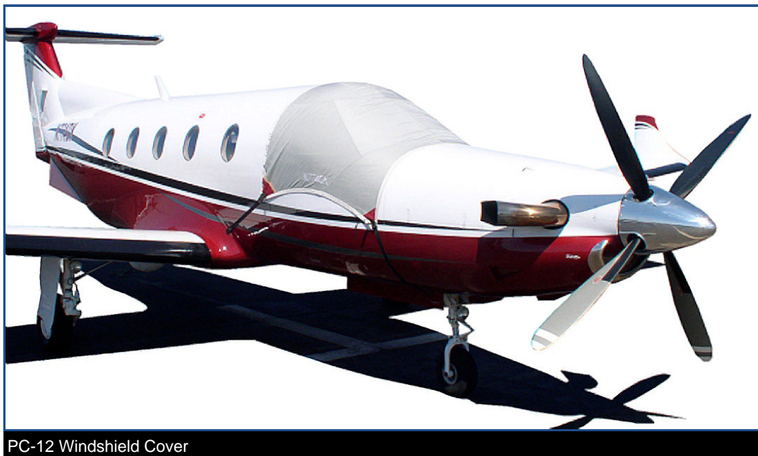
PC-12 Windshield Cover