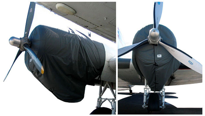
DC3 Engine Covers are custom made for various engine mod's.