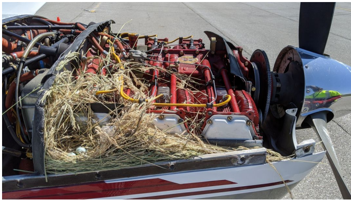
ENGINE PLUGS PREVENT BIRD NEST FOD. Piper Saratoga Engine Cowling Bird's Nest

Engine Inlet Plugs are custom fit for your Douglas DC-3 intakes, made with heavy-duty vinyl material, and stuffed with a single block of sculpted urethane foam. Each plug has a zipper that allows the foam to be removed and dried if necessary. Engine plugs have warning flags that are visible from the cockpit or 'remove before flight' streamers sewn onto the face of the plugs. Most plugs are imprinted with the aircraft registration number in black for an extra charge. Storage bag NOT included. Engine plugs may be inserted after flight when the engine is still warm. Engine Inlet Plugs are commonly referred to as Cowl Plugs, Intake Plugs, Cowl Blocks, Engine Blocks, and Engine Bungs.