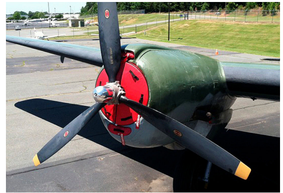
C-46 Radial Engine Intake Plug