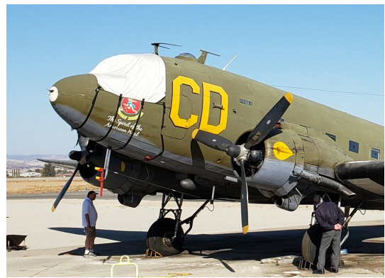
Douglas DC-3 Cockpit Cover