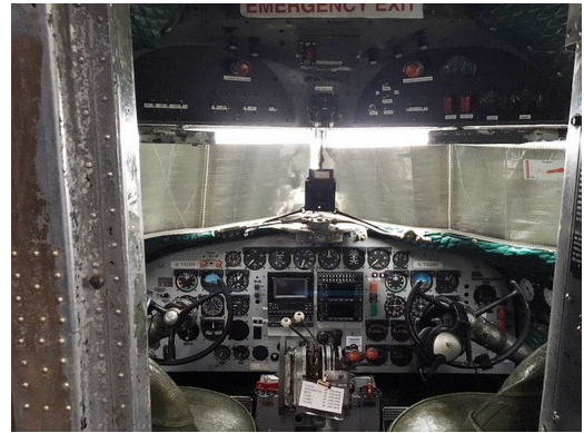
Douglas DC-3 Cockpit Heatshields