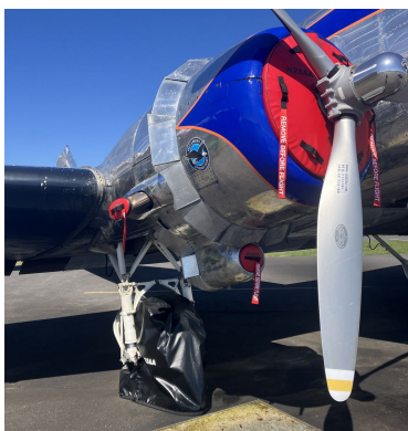
DC-3 Engine Plugs, Tire Covers