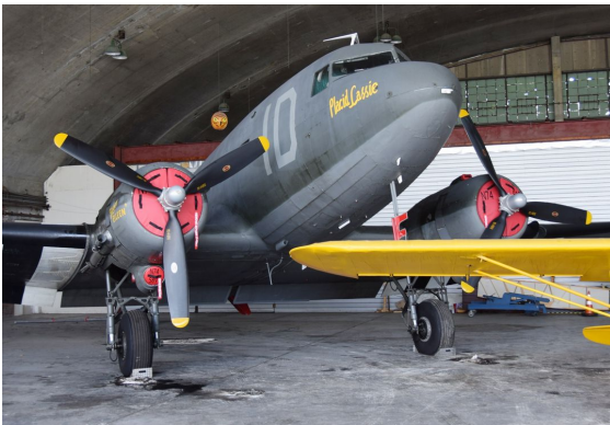
Douglas DC-3 Engine & Oil Cooler Plugs

Engine Inlet Plugs are custom fit for your Douglas DC-3 intakes, made with heavy-duty vinyl material, and stuffed with a single block of sculpted urethane foam. Each plug has a zipper that allows the foam to be removed and dried if necessary. Engine plugs have warning flags that are visible from the cockpit or 'remove before flight' streamers sewn onto the face of the plugs. Most plugs are imprinted with the aircraft registration number in black for an extra charge. Storage bag NOT included. Engine plugs may be inserted after flight when the engine is still warm. Engine Inlet Plugs are commonly referred to as Cowl Plugs, Intake Plugs, Cowl Blocks, Engine Blocks, and Engine Bungs.