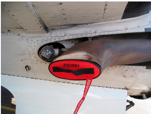
Beech 18 Exhaust Plugs