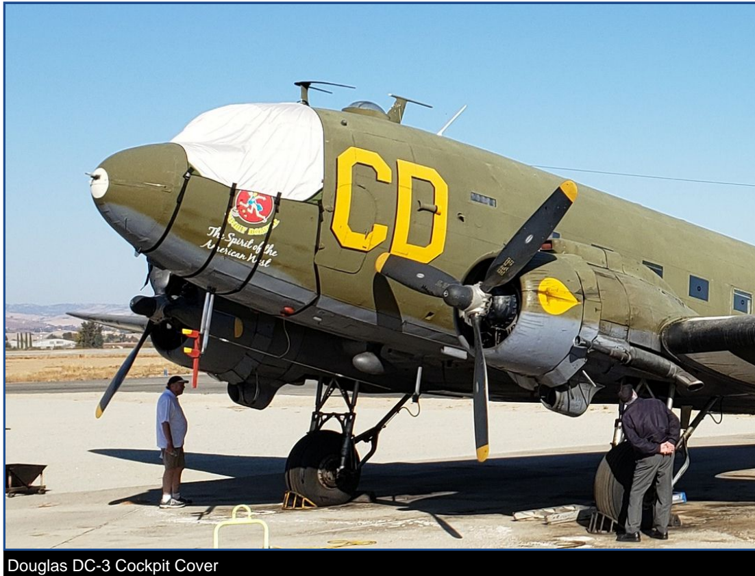
Douglas DC-3 Cockpit Cover