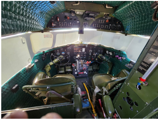
DC-3C Cockpit Heatshields

Cockpit Heatshields are interior sunshades for the aircraft's cockpit. The product is a unique composite of closed-cell foam with a silver mylar finish. The semi-rigid design is stiff enough to stand inside the window framing. The set folds up flat and is easily stored in the included storage sleeve. Some designs may require velcro and suction cups. A Heatshield is an excellent short-term remedy for cockpit overheating, but an external fabric cover is more effective for long-term protection.