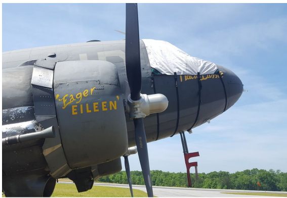
Douglas DC-3 Cockpit Cover