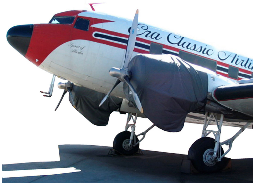
Engine Covers are available in either standard or insulated designs.