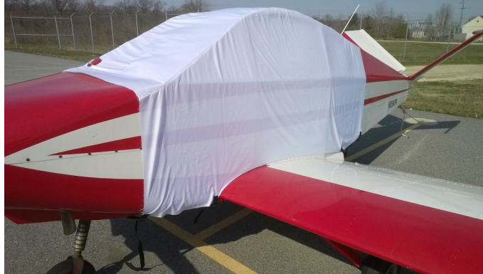
Davis DA-2A Extended Canopy Cover, test fit cover

This cover type is made from Silver Acrylic Sunbrella canvas and is 100% lined with a soft and smooth microfiber. Bruce's Custom Covers developed this material combination especially for aircraft protection. The outer material is medium weight and treated for water resistance, UV resistance and anti-static buildup. The inner lining is a very soft and smooth microfiber to prevent scratching. The material is very reflective, and tests show that the cabin interior temperature can be reduced to near-ambient temperature on the hottest of days. It is water, ice and snow repellent, yet breathable to allow moisture to escape from between the cover and the aircraft surface.