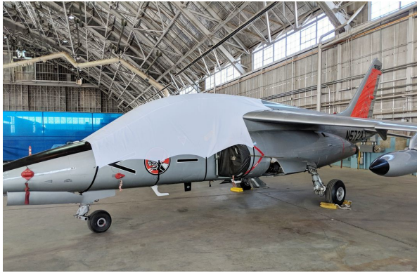
Dornier Alpha Jet Canopy Cover, test fit cover

This cover type is made from Silver Acrylic Sunbrella canvas and is 100% lined with a soft and smooth microfiber. Bruce's Custom Covers developed this material combination especially for aircraft protection. The outer material is medium weight and treated for water resistance, UV resistance and anti-static buildup. The inner lining is a very soft and smooth microfiber to prevent scratching. The material is very reflective, and tests show that the cabin interior temperature can be reduced to near-ambient temperature on the hottest of days. It is water, ice and snow repellent, yet breathable to allow moisture to escape from between the cover and the aircraft surface.