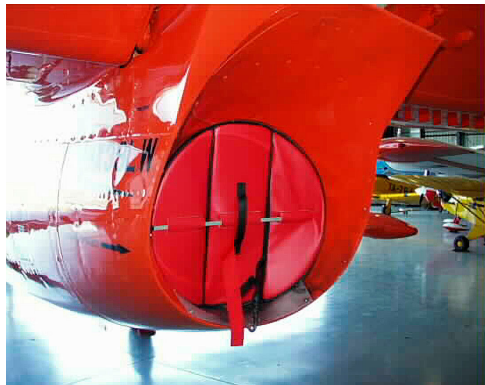
Exhaust Plug, folding type

Engine plugs have 'remove before flight' streamers sewn onto the face of the plugs. Most plugs are imprinted with the aircraft registration number in black for an extra charge. Storage bag NOT included. Engine plugs may be inserted after flight when the engine is still warm. Engine Inlet Plugs are commonly referred to as Cowl Plugs, Intake Plugs, Cowl Blocks, Engine Blocks, and Engine Bungs.