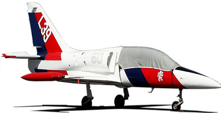
Canopy Cover for Aero L-39 Albatros

Travel Covers are made with Silver Solution-Dyed Polyester fabric and only lined over the windshield to save weight. The material is lightweight and more compact for easy stowage in the aircraft. The polyester material is water resistant, but only intended for occasional use outside. We also have an ultra lightweight material available for fitted hangar dust covers. For daily outdoor use, the non-travel Sunbrella Cover is the best choice.