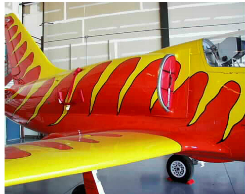
Inlet Plug, folding type