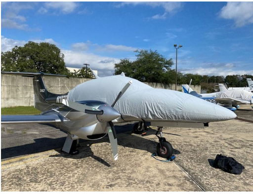
DA-62 Travel Canopy/Nose