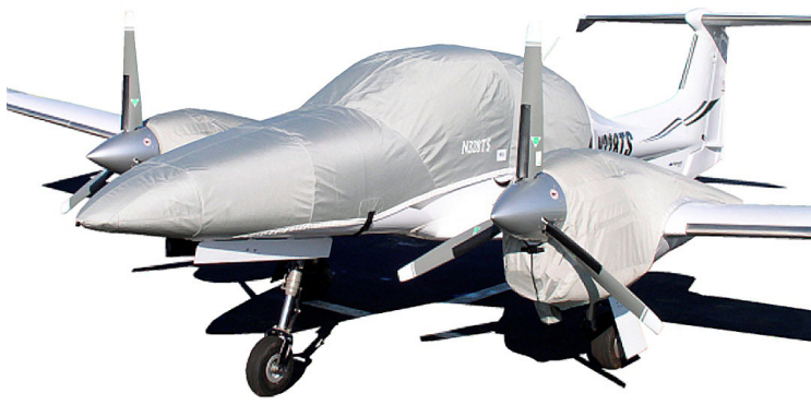
Diamond Twinstar Canopy/Nose Cover & Engine Covers