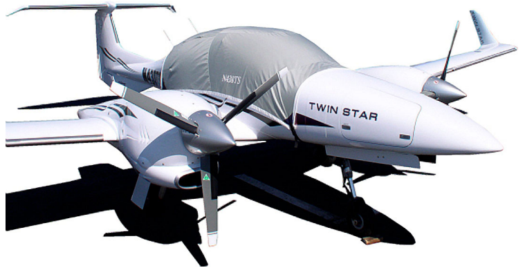
Twinstar Standard Canopy Cover