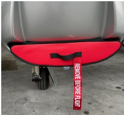
Diamond DA-62 Engine Inlet Plugs

Engine Inlet Plugs are custom fit for your Diamond DA-62 intakes, made with heavy-duty vinyl material, and stuffed with a single block of sculpted urethane foam. Each plug has a zipper that allows the foam to be removed and dried if necessary. Engine plugs have warning flags that are visible from the cockpit or 'remove before flight' streamers sewn onto the face of the plugs. Most plugs are imprinted with the aircraft registration number in black for an extra charge. Storage bag NOT included. Engine plugs may be inserted after flight when the engine is still warm. Engine Inlet Plugs are commonly referred to as Cowl Plugs, Intake Plugs, Cowl Blocks, Engine Blocks, and Engine Bungs.