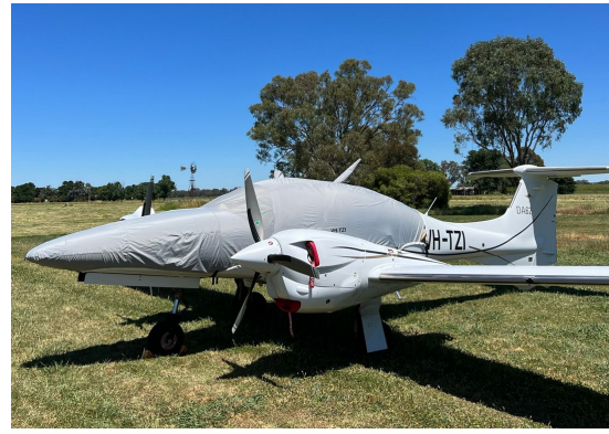
Diamond DA-62 Travel Weight Canopy/Nose Cover