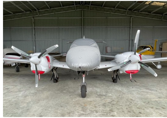
DA-62 Travel Weight Canopy/Nose Cover, Engine Plugs