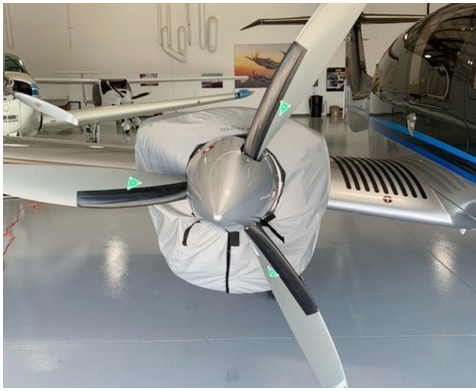
Diamond DA-62 Travel Weight Engine Covers