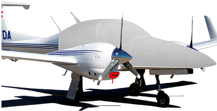
Twinstar Extended Canopy/Nose Cover & Engine Plugs (Illustration)

Engine Inlet Plugs are custom fit for your Diamond DA-62 intakes, made with heavy-duty vinyl material, and stuffed with a single block of sculpted urethane foam. Each plug has a zipper that allows the foam to be removed and dried if necessary. Engine plugs have warning flags that are visible from the cockpit or 'remove before flight' streamers sewn onto the face of the plugs. Most plugs are imprinted with the aircraft registration number in black for an extra charge. Storage bag NOT included. Engine plugs may be inserted after flight when the engine is still warm. Engine Inlet Plugs are commonly referred to as Cowl Plugs, Intake Plugs, Cowl Blocks, Engine Blocks, and Engine Bungs.