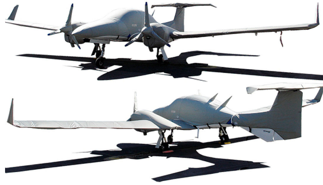
DA-42 Full Cover Set: Extended Canopy/Nose, Wing/Engine, Prop, Empennage