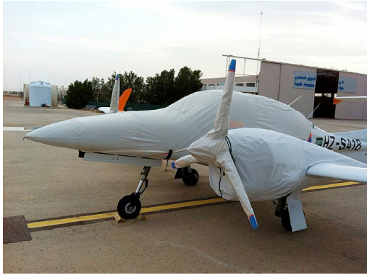
Diamond DA-42NG Canopy/Nose, Engine & Prop Covers