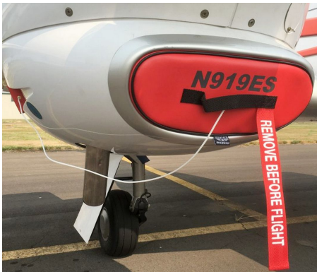
Diamond Da-42 Engine Inlet Plugs Set of 4

Engine Inlet Plugs are custom fit for your Diamond DA-62 intakes, made with heavy-duty vinyl material, and stuffed with a single block of sculpted urethane foam. Each plug has a zipper that allows the foam to be removed and dried if necessary. Engine plugs have warning flags that are visible from the cockpit or 'remove before flight' streamers sewn onto the face of the plugs. Most plugs are imprinted with the aircraft registration number in black for an extra charge. Storage bag NOT included. Engine plugs may be inserted after flight when the engine is still warm. Engine Inlet Plugs are commonly referred to as Cowl Plugs, Intake Plugs, Cowl Blocks, Engine Blocks, and Engine Bungs.