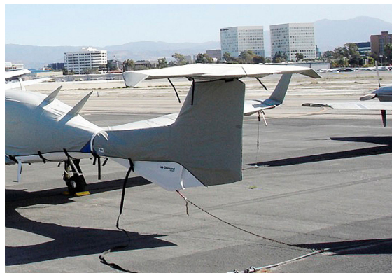
DA-42 Empennage & Horiz. Stab. Covers