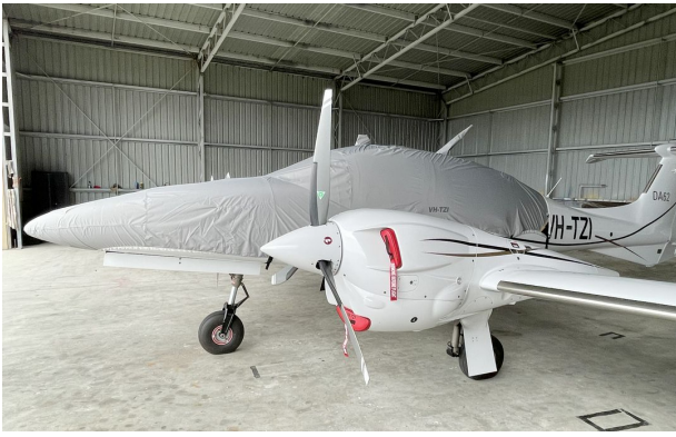
Diamond DA-62 Canopy/Nose Cover, Engine Plugs