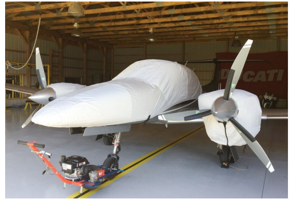
Diamond DA-42-VI Canopy/Nose & Engine Covers