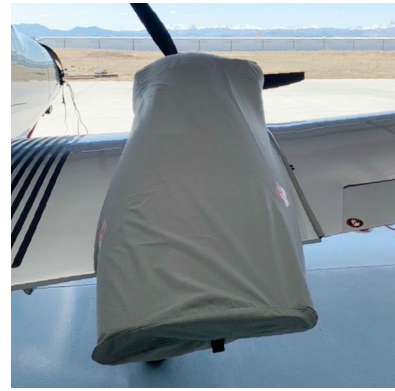
Diamond DA-62 Travel Weight Engine Covers