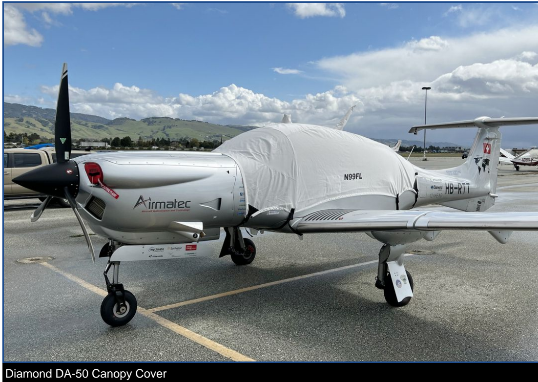
Diamond DA-50 Canopy Cover