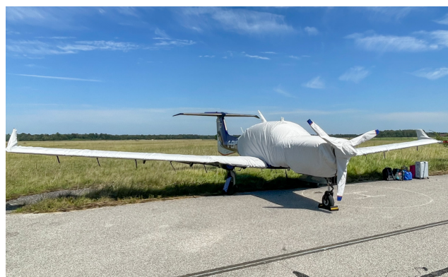
Diamond DA-50 Extended Canopy/Engine, Prop & Wing Covers (test fit)