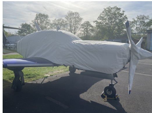
Diamond DA-50 Extended Canopy/Engine, Prop & Wing Covers (test fit) Diamond DA-50 Extended Canopy/Engine, Prop & Wing Covers (test fit)