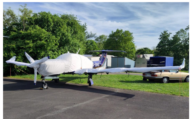
Diamond DA-50 Extended Canopy/Engine, Prop & Wing Covers (test fit)