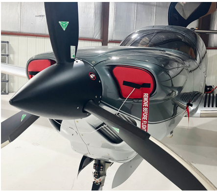
Diamond DA-50 Superstar Engine Inlet Plugs

Engine Inlet Plugs are custom fit for your Diamond DA-50 Superstar intakes, made with heavy-duty vinyl material, and stuffed with a single block of sculpted urethane foam. Each plug has a zipper that allows the foam to be removed and dried if necessary. Engine plugs have warning flags that are visible from the cockpit or 'remove before flight' streamers sewn onto the face of the plugs. Most plugs are imprinted with the aircraft registration number in black for an extra charge. Storage bag NOT included. Engine plugs may be inserted after flight when the engine is still warm. Engine Inlet Plugs are commonly referred to as Cowl Plugs, Intake Plugs, Cowl Blocks, Engine Blocks, and Engine Bungs.