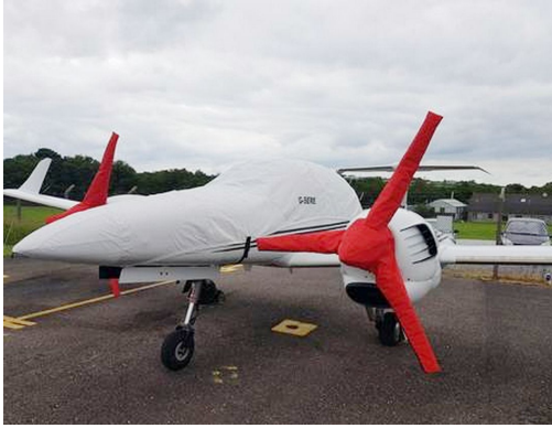
Diamond DA-42 Canopy/Nose and Insulated Prop Covers

The material is very reflective, and tests show that the cabin interior temperature can be reduced to near-ambient temperature on the hottest of days. It is water, ice and snow repellent, yet breathable to allow moisture to escape from between the cover and the aircraft surface.