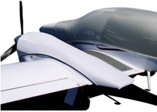
Twinstar Travel-Cover Engine Cover, 4 lbs. with bag