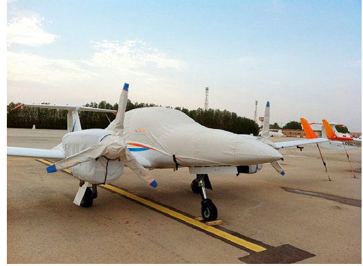
Diamond DA-42NG Canopy/Nose, Engine & Prop Covers