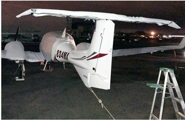
Diamond DA-42 Twin Star Wing & Engine Covers