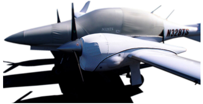
Twinstar Travel-Cover Engine Cover, 4 lbs. with bag