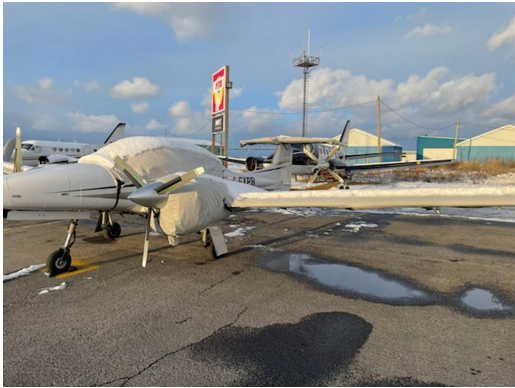
Diamond DA-42 Canopy, Wing, Engine & Horizontal Stabilizer Covers

WINTER USE MATERIAL - Made with Solution-Dyed Polyester fabric, this option is intended for seasonal use to aid in deicing, rain mitigation, or for occasional travel. The material is lighter and more compact, but more susceptible to UV damage and may have a shorter useful life if used continuously outside than the all-year use material.