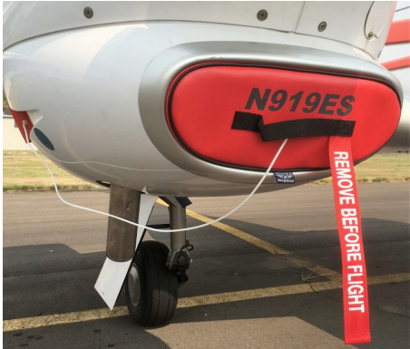
Diamond Da-42 Engine Inlet Plugs Set of 4

Engine Inlet Plugs are custom fit for your Diamond DA-42 Twin Star intakes, made with heavy-duty vinyl material, and stuffed with a single block of sculpted urethane foam. Each plug has a zipper that allows the foam to be removed and dried if necessary. Engine plugs have warning flags that are visible from the cockpit or 'remove before flight' streamers sewn onto the face of the plugs. Most plugs are imprinted with the aircraft registration number in black for an extra charge. Storage bag NOT included. Engine plugs may be inserted after flight when the engine is still warm. Engine Inlet Plugs are commonly referred to as Cowl Plugs, Intake Plugs, Cowl Blocks, Engine Blocks, and Engine Bungs.