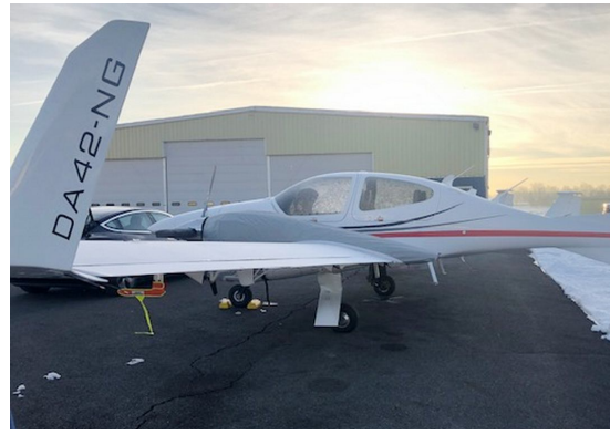
Diamond DA-42 Twin Star Travel Cover, Light Weight Travel Engine Covers, Specify Engine Type