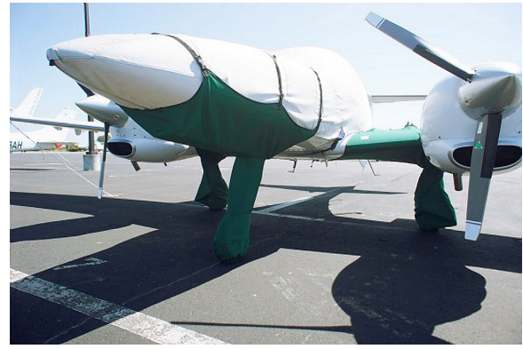
Diamond DA-42 Twinstar Landing Gear & Gearwell Covers