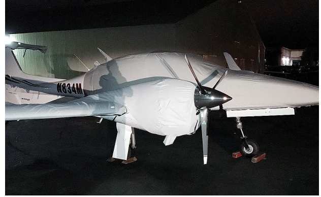
Diamond DA-42 Twin Star Wing & Engine Covers