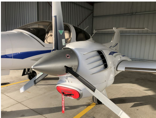
Diamond DA-42 Engine Inlet Plugs

Engine Inlet Plugs are custom fit for your Diamond DA-42 Twin Star intakes, made with heavy-duty vinyl material, and stuffed with a single block of sculpted urethane foam. Each plug has a zipper that allows the foam to be removed and dried if necessary. Engine plugs have warning flags that are visible from the cockpit or 'remove before flight' streamers sewn onto the face of the plugs. Most plugs are imprinted with the aircraft registration number in black for an extra charge. Storage bag NOT included. Engine plugs may be inserted after flight when the engine is still warm. Engine Inlet Plugs are commonly referred to as Cowl Plugs, Intake Plugs, Cowl Blocks, Engine Blocks, and Engine Bungs.