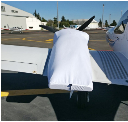
DA42 MPP Guardian (DA42-NG) Engine Cover, test fit cover