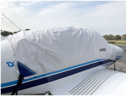
Diamond DA-42 Twin Star Canopy Cover