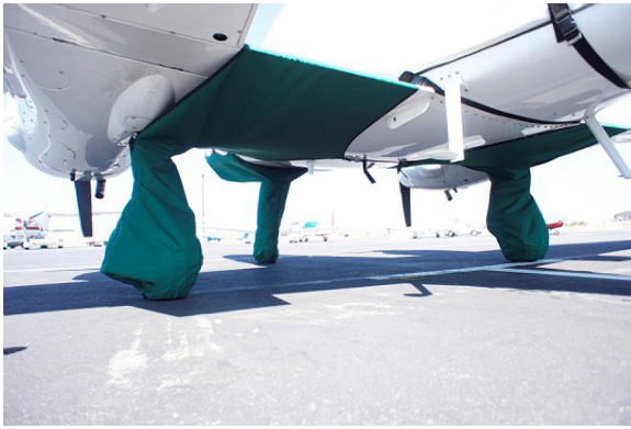
Twinstar Landing Gear & Gearwell Covers