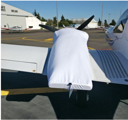
DA42 MPP Guardian (DA42-NG) Engine Cover, test fit cover

The material is very reflective, and tests show that the cabin interior temperature can be reduced to near-ambient temperature on the hottest of days. It is water, ice and snow repellent, yet breathable to allow moisture to escape from between the cover and the aircraft surface.