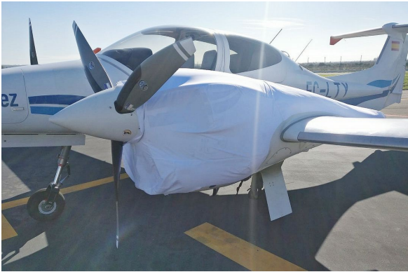
DA42 MPP Guardian (DA42-NG) Engine Cover, test fit cover