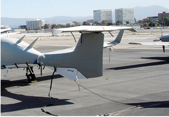
DA-42 Empennage & Horiz. Stab. Covers

WINTER USE MATERIAL - Made with Solution-Dyed Polyester fabric, this option is intended for seasonal use to aid in deicing, rain mitigation, or for occasional travel. The material is lighter and more compact, but more susceptible to UV damage and may have a shorter useful life if used continuously outside than the all-year use material.