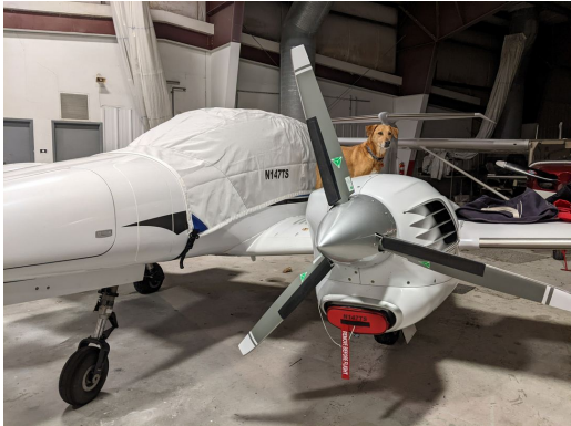
Diamond DA-42 NG Canopy Cover, Engine Plugs