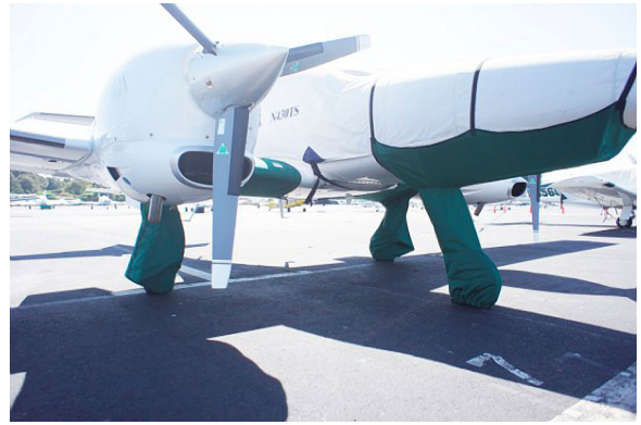
Twinstar Landing Gear & Gearwell Covers