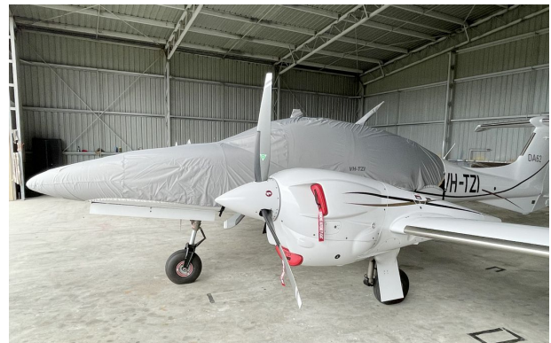
Diamond DA-62 Canopy/Nose Cover, Engine Plugs