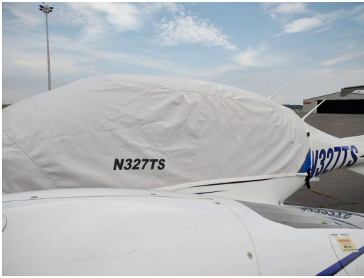
Diamone DA-42 Twin Star Canopy Cover