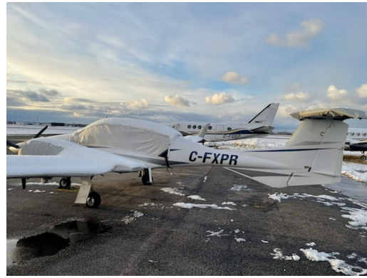
Diamond DA-42 Canopy, Wing, Engine & Horizontal Stabilizer Covers