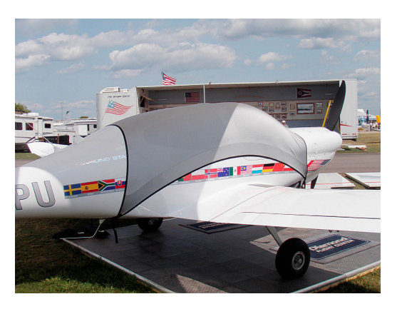
Diamond DA-40 Light Weight Travel Cover (Spandex Flyaway Type)