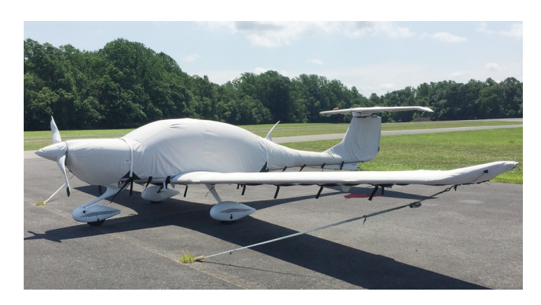
Diamond DA-40 Extended Canopy, Wing, Engine, Prop, Empennage & Horiz. Stab Covers