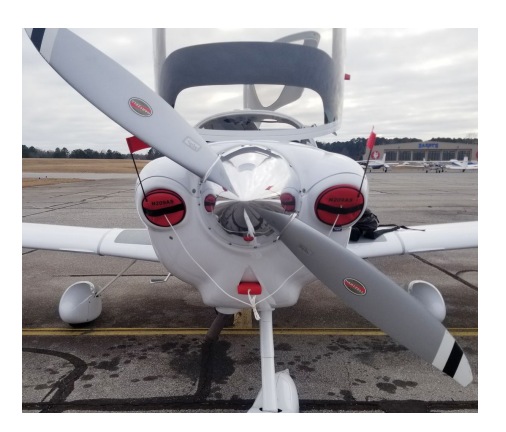
Diamond DA-40 Engine Inlet Plugs