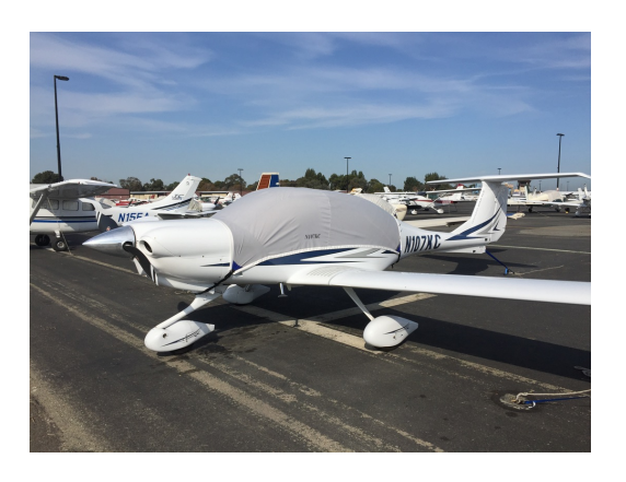
Diamond DA-40 Travel Cover, Light Weight Travel Canopy Cover