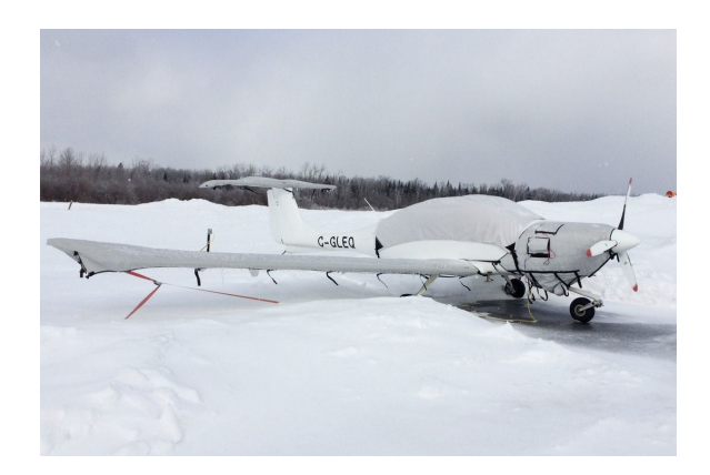
Diamond DA40 Canopy, Insulated Engine, Wing and Stab. Covers

This cover type is made from Silver Acrylic Sunbrella canvas and is 100% lined with a soft and smooth microfiber. Bruce's Custom Covers developed this material combination especially for aircraft protection. The outer material is medium weight and treated for water resistance, UV resistance and anti-static buildup. The inner lining is a very soft and smooth microfiber to prevent scratching. The material is very reflective, and tests show that the cabin interior temperature can be reduced to near-ambient temperature on the hottest of days. It is water, ice and snow repellent, yet breathable to allow moisture to escape from between the cover and the aircraft surface.