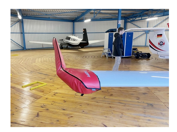
Diamond DA-40 Wingtip Pads

Designed to prevent damage to the aircraft extremities in crowded hangars, these products are made of bright red Naugahyde and thickly padded with a sandwich of closed cell foam.