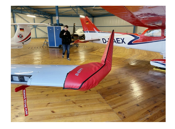
Diamond DA-40 Wingtip Pads