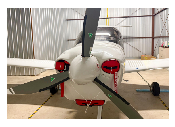
Diamond DA-40 NG Engine Inlet Plugs