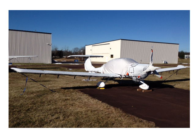
Diamond DA-40 Full Cover Set, with Insulated Engine Cover