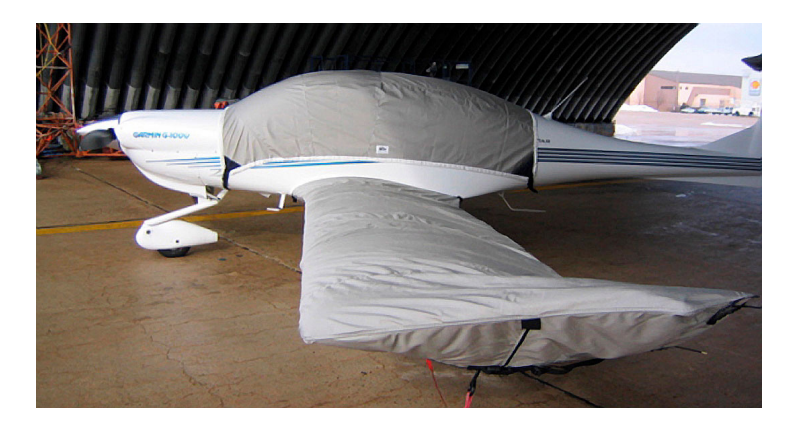
Diamond DA-40 Canopy & Wing Covers

WINTER USE MATERIAL - Made with Solution-Dyed Polyester fabric, this option is intended for seasonal use to aid in deicing, rain mitigation, or for occasional travel. The material is lighter and more compact, but more susceptible to UV damage and may have a shorter useful life if used continuously outside than the all-year use material.