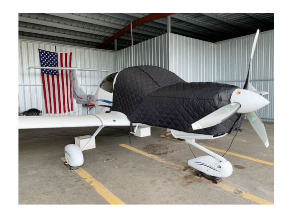
Diamond DA-40 Insulated Cockpit & Engine Cover