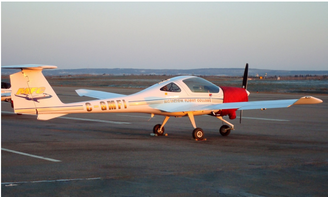
Diamond DA-20 Insulated Engine Cover

This cover type is made from Silver Acrylic Sunbrella canvas and is 100% lined with a soft and smooth microfiber. Bruce's Custom Covers developed this material combination especially for aircraft protection. The outer material is medium weight and treated for water resistance, UV resistance and anti-static buildup. The inner lining is a very soft and smooth microfiber to prevent scratching. The material is very reflective, and tests show that the cabin interior temperature can be reduced to near-ambient temperature on the hottest of days. It is water, ice and snow repellent, yet breathable to allow moisture to escape from between the cover and the aircraft surface.