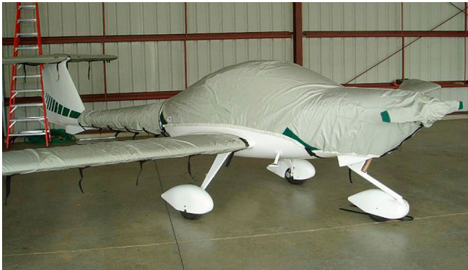
Diamond DA20-C1 Insulated Engine Cover, C1 models DA-20 Canopy/Engine, Prop/Spinner, Wing, Tailboom, Horiz. Stab. Covers