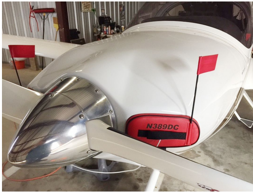
Diamond DA-20-C1 Engine Inlet Plugs

Engine Inlet Plugs are custom fit for your Diamond DA-20, Katana, Eclipse intakes, made with heavy-duty vinyl material, and stuffed with a single block of sculpted urethane foam. Each plug has a zipper that allows the foam to be removed and dried if necessary. Engine plugs have warning flags that are visible from the cockpit or 'remove before flight' streamers sewn onto the face of the plugs. Most plugs are imprinted with the aircraft registration number in black for an extra charge. Storage bag NOT included. Engine plugs may be inserted after flight when the engine is still warm. Engine Inlet Plugs are commonly referred to as Cowl Plugs, Intake Plugs, Cowl Blocks, Engine Blocks, and Engine Bungs.