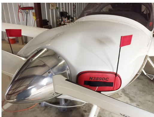
Diamond DA-20-C1 Engine Inlet Plugs

Engine Inlet Plugs are custom fit for your Diamond DA-20, Katana, Eclipse intakes, made with heavy-duty vinyl material, and stuffed with a single block of sculpted urethane foam. Each plug has a zipper that allows the foam to be removed and dried if necessary. Engine plugs have warning flags that are visible from the cockpit or 'remove before flight' streamers sewn onto the face of the plugs. Most plugs are imprinted with the aircraft registration number in black for an extra charge. Storage bag NOT included. Engine plugs may be inserted after flight when the engine is still warm. Engine Inlet Plugs are commonly referred to as Cowl Plugs, Intake Plugs, Cowl Blocks, Engine Blocks, and Engine Bungs.