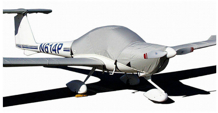
Diamond DA-20 Canopy/Engine Cover (Travel Weight), Prop Cover