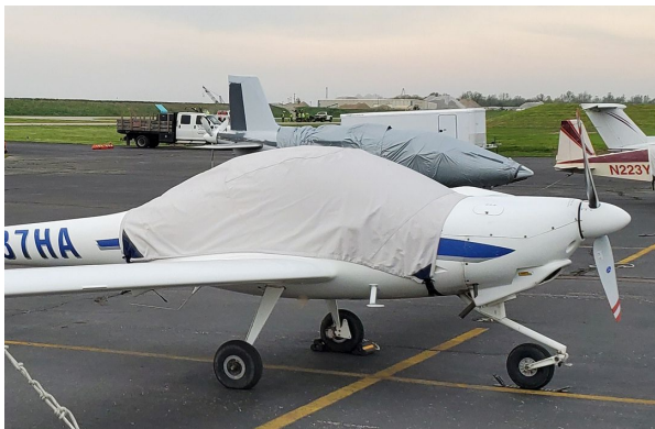
Diamond DA-20 Katana

This cover type is made from Silver Acrylic Sunbrella canvas and is 100% lined with a soft and smooth microfiber. Bruce's Custom Covers developed this material combination especially for aircraft protection. The outer material is medium weight and treated for water resistance, UV resistance and anti-static buildup. The inner lining is a very soft and smooth microfiber to prevent scratching. The material is very reflective, and tests show that the cabin interior temperature can be reduced to near-ambient temperature on the hottest of days. It is water, ice and snow repellent, yet breathable to allow moisture to escape from between the cover and the aircraft surface.