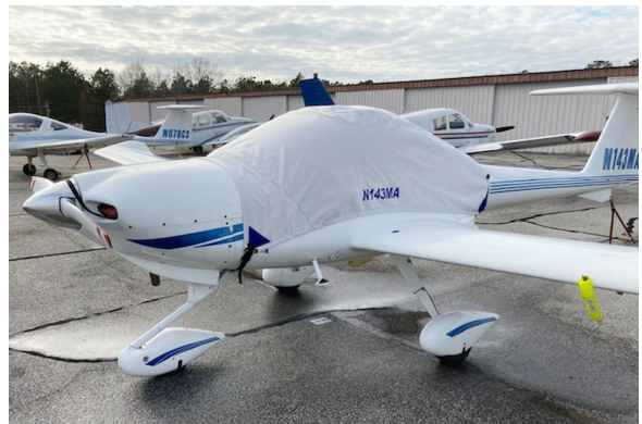
Diamond DA20-C1 Canopy Cover