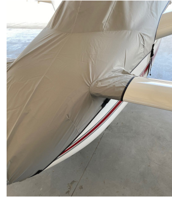
COZY Mk IV Lightweight Travel Canopy/Nose/Engine Cover