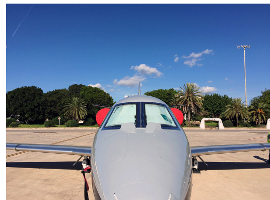
Cessna Citation XL, XLS (560XL) Cockpit Heatshields