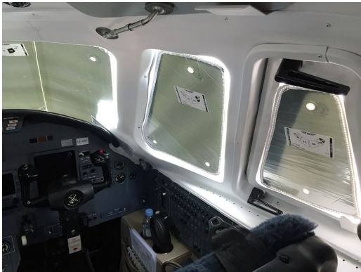
Cessna Citation XL, XLS (560XL) Cockpit Heatshields