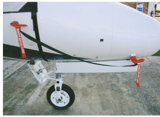
Citation XL Pitot Covers