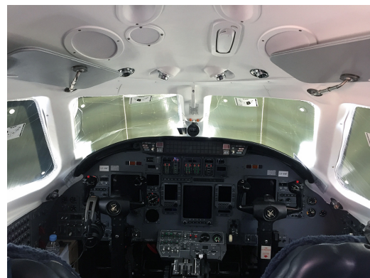
Cessna Citation XL, XLS (560XL) Cockpit Heatshields