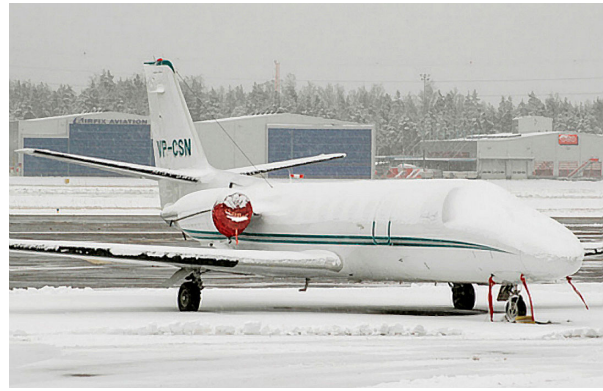
Cessna 560 Engine Inlet/Exhaust Covers, Pitot Cover Set