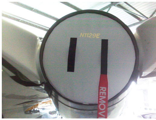
Citation XLS Exhaust Plugs