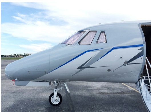
Cessna Citation 650 Cockpit HeataShields

Cockpit Heatshields are interior sunshades for the aircraft's cockpit. The product is a unique composite of closed-cell foam with a silver mylar finish. The semi-rigid design is stiff enough to stand inside the window framing. The set folds up flat and is easily stored in the included storage sleeve. Some designs may require velcro and suction cups. Our Heatshields for jets are offered white side out because some aircraft manufacturers have issued advisories against reflective window inserts due to potential heat damage. A Heatshield is an excellent short-term remedy for cockpit overheating, but an external fabric cover is more effective for long-term protection.