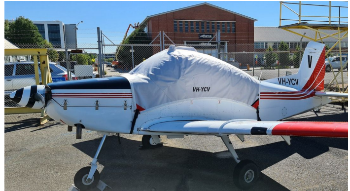
Pacific Aerospace CT-4, Victa Airtourer Canopy Cover