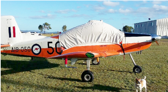
Pacific Aerospace CT-4 Canopy Cover

This cover type is made from Silver Acrylic Sunbrella canvas and is 100% lined with a soft and smooth microfiber. Bruce's Custom Covers developed this material combination especially for aircraft protection. The outer material is medium weight and treated for water resistance, UV resistance and anti-static buildup. The inner lining is a very soft and smooth microfiber to prevent scratching. The material is very reflective, and tests show that the cabin interior temperature can be reduced to near-ambient temperature on the hottest of days. It is water, ice and snow repellent, yet breathable to allow moisture to escape from between the cover and the aircraft surface.