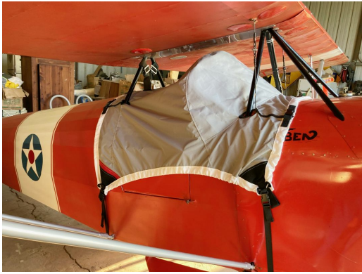
Corben Junior Ace Travel Weight Canopy Cover

the hottest of days. It is water, ice and snow repellent, yet breathable to allow moisture to escape from between the cover and the aircraft surface.