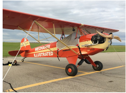
Corben Baby Ace Cockpit Cover