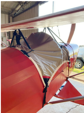
Corben Junior Ace Travel Weight Canopy Cover