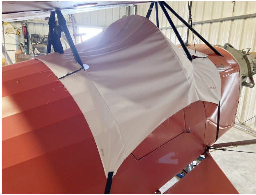
Corben Junior Ace Cockpit Cover, test fit cover