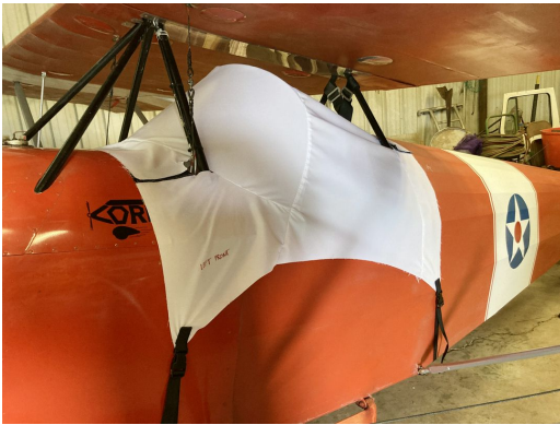
Corben Junior Ace Cockpit Cover, test fit cover

This cover type is made from Silver Acrylic Sunbrella canvas and is 100% lined with a soft and smooth microfiber. Bruce's Custom Covers developed this material combination especially for aircraft protection. The outer material is medium weight and treated for water resistance, UV resistance and anti-static buildup. The inner lining is a very soft and smooth microfiber to prevent scratching. The material is very reflective, and tests show that the cabin interior temperature can be reduced to near-ambient temperature on the hottest of days. It is water, ice and snow repellent, yet breathable to allow moisture to escape from between the cover and the aircraft surface.