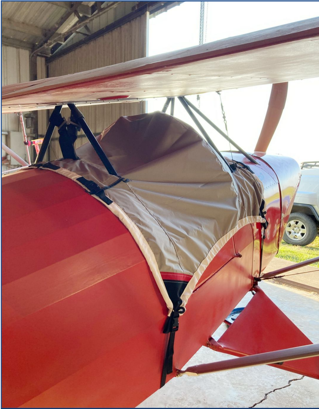
Corben Junior Ace Travel Weight Canopy Cover