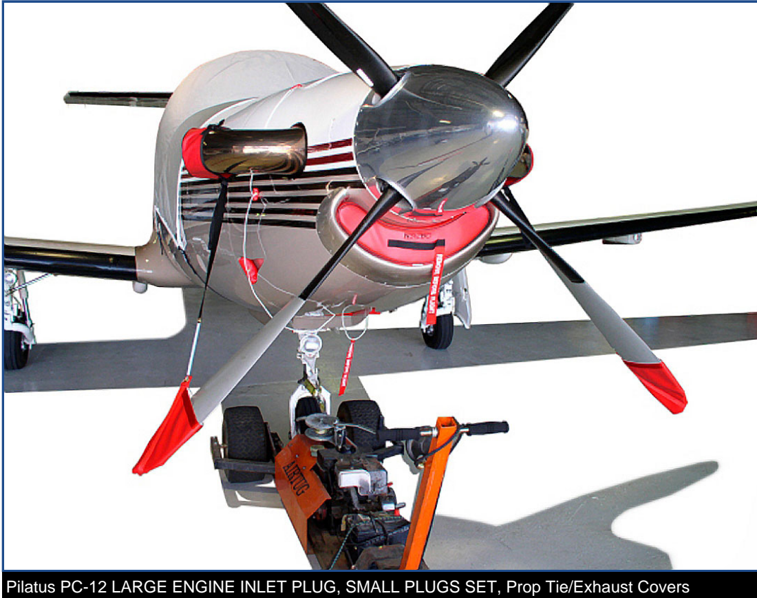
Pilatus PC-12 LARGE ENGINE INLET PLUG, SMALL PLUGS SET, Prop Tie/Exhaust Covers