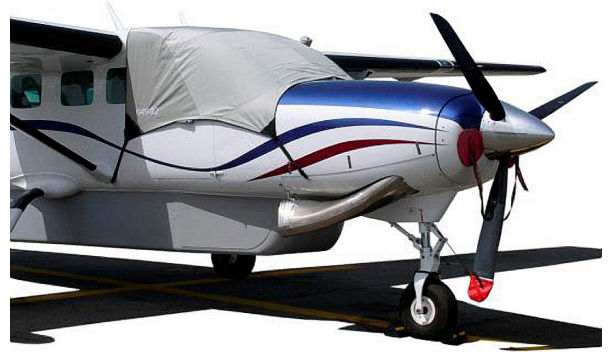
Cessna Caravan Cockpit Cover, Plugs, Prop Ties & Pitot Cover