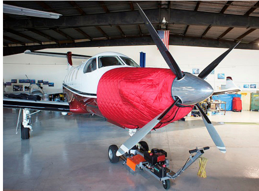
Pilatus PC-12 Insulated Engine Cover

This cover type is made from Silver Acrylic Sunbrella canvas and is 100% lined with a soft and smooth microfiber. Bruce's Custom Covers developed this material combination especially for aircraft protection. The outer material is medium weight and treated for water resistance, UV resistance and anti-static buildup. The inner lining is a very soft and smooth microfiber to prevent scratching. The material is very reflective, and tests show that the cabin interior temperature can be reduced to near-ambient temperature on the hottest of days. It is water, ice and snow repellent, yet breathable to allow moisture to escape from between the cover and the aircraft surface.