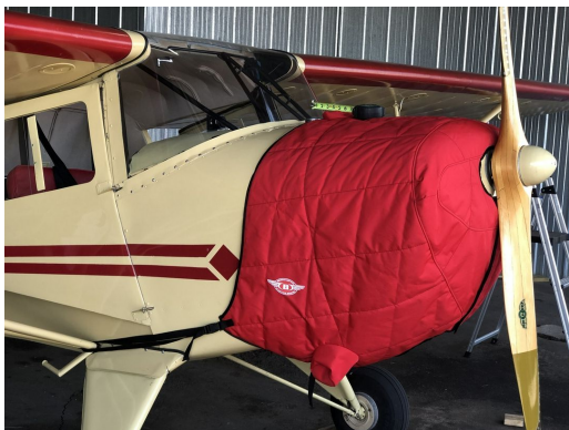
Taylorcraft Insulated Engine Cover

This cover type is made from Silver Acrylic Sunbrella canvas and is 100% lined with a soft and smooth microfiber. Bruce's Custom Covers developed this material combination especially for aircraft protection. The outer material is medium weight and treated for water resistance, UV resistance and anti-static buildup. The inner lining is a very soft and smooth microfiber to prevent scratching. The material is very reflective, and tests show that the cabin interior temperature can be reduced to near-ambient temperature on the hottest of days. It is water, ice and snow repellent, yet breathable to allow moisture to escape from between the cover and the aircraft surface.