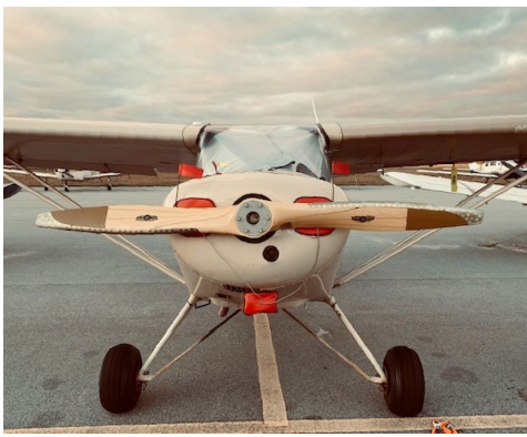
Taylorcraft Engine Inlet Plugs