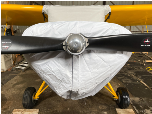
Fleet 80 Canuck Engine Cover, test fit cover