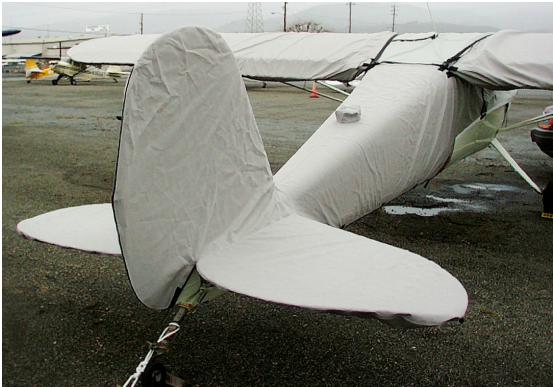
Cessna 120 Empennage Cover

WINTER USE MATERIAL - Made with Solution-Dyed Polyester fabric, this option is intended for seasonal use to aid in deicing, rain mitigation, or for occasional travel. The material is lighter and more compact, but more susceptible to UV damage and may have a shorter useful life if used continuously outside than the all-year use material.