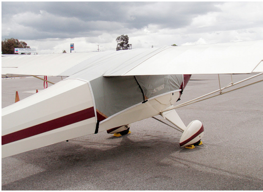
Taylorcraft Over-Top Canopy Cover