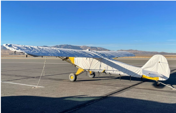
Taylorcraft BC-12D Extended Canopy, Wing & Empennage Covers