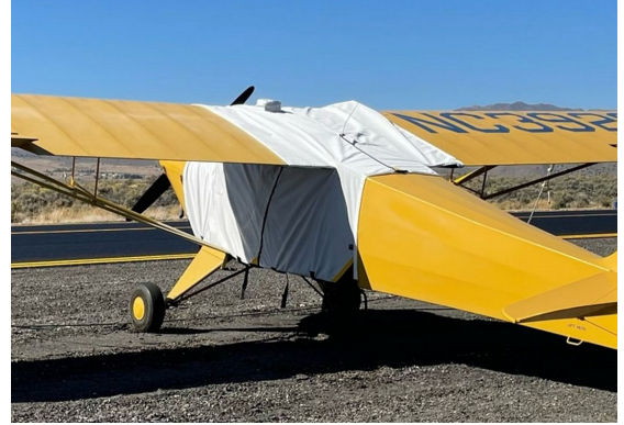
Taylorcraft BC-12D Extended Canopy Cover