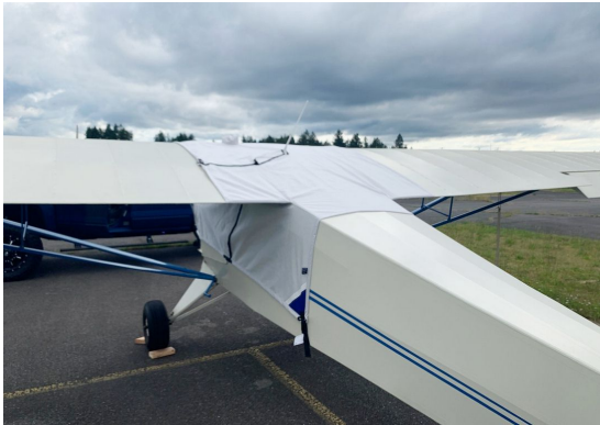
Taylorcraft Models F19 Over-The-Top Canopy Cover

This cover type is made from Silver Acrylic Sunbrella canvas and is 100% lined with a soft and smooth microfiber. Bruce's Custom Covers developed this material combination especially for aircraft protection. The outer material is medium weight and treated for water resistance, UV resistance and anti-static buildup. The inner lining is a very soft and smooth microfiber to prevent scratching. The material is very reflective, and tests show that the cabin interior temperature can be reduced to near-ambient temperature on the hottest of days. It is water, ice and snow repellent, yet breathable to allow moisture to escape from between the cover and the aircraft surface.