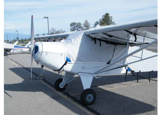
Taylorcraft Over-Top Canopy Cover & Wing Covers