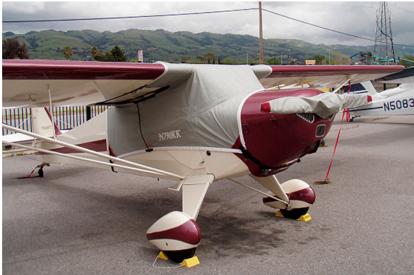
Taylorcraft Over-Top Canopy Cover