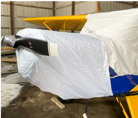
Fleet 80 Canuck Engine Cover, test fit cover

This cover type is made from Silver Acrylic Sunbrella canvas and is 100% lined with a soft and smooth microfiber. Bruce's Custom Covers developed this material combination especially for aircraft protection. The outer material is medium weight and treated for water resistance, UV resistance and anti-static buildup. The inner lining is a very soft and smooth microfiber to prevent scratching. The material is very reflective, and tests show that the cabin interior temperature can be reduced to near-ambient temperature on the hottest of days. It is water, ice and snow repellent, yet breathable to allow moisture to escape from between the cover and the aircraft surface.