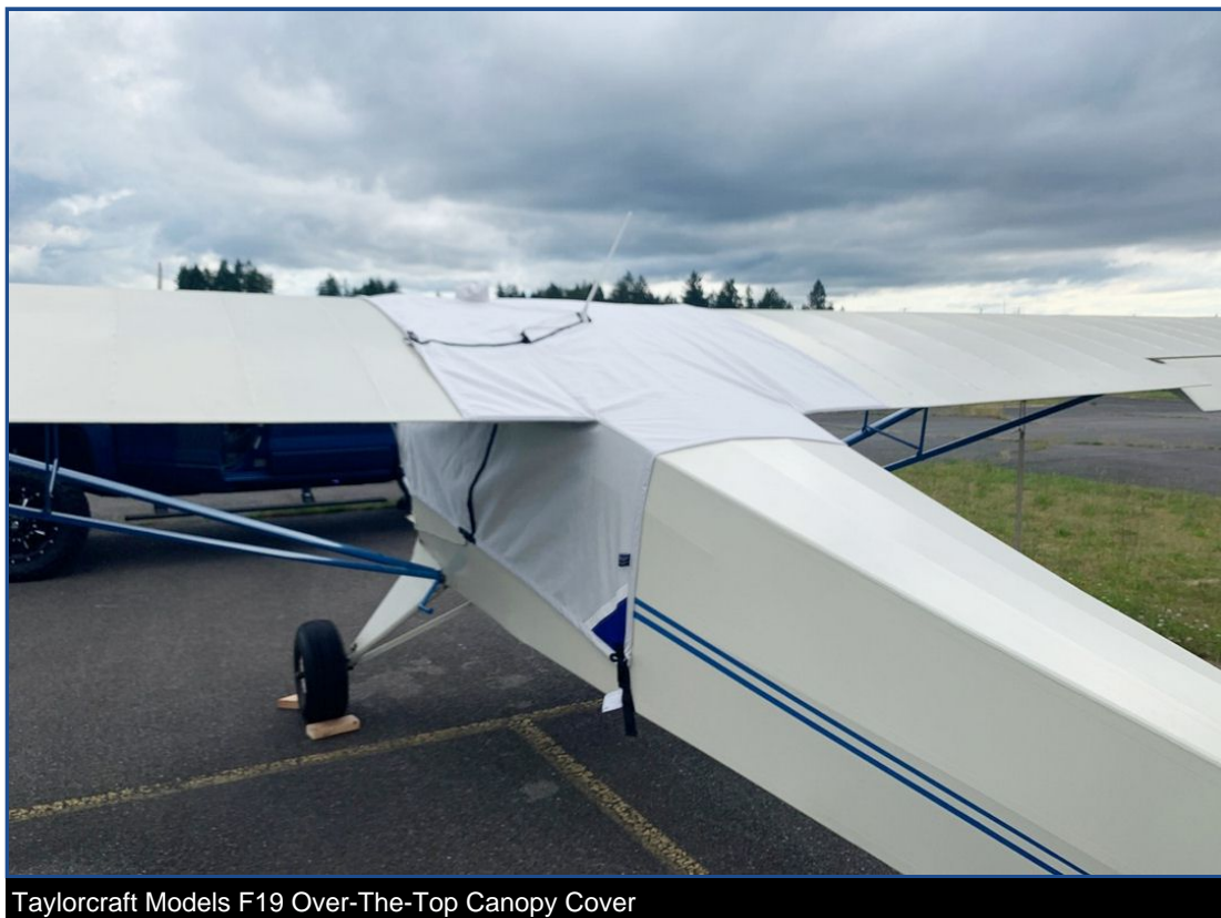
Taylorcraft Models F19 Over-The-Top Canopy Cover