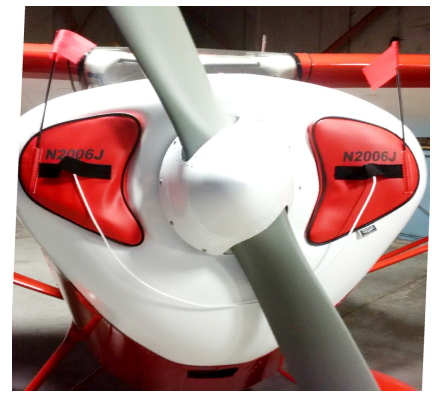
Taylorcraft Engine Inlet Plugs