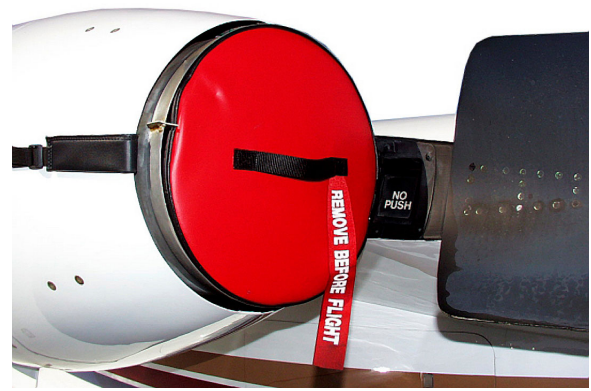
Engine Exhaust Plug