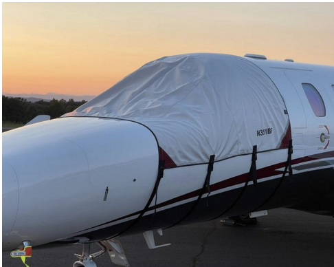
Cessna Citation Jet 525 Cockpit Cover

This cover type is made from Silver Acrylic Sunbrella canvas and is 100% lined with a soft and smooth microfiber. Bruce's Custom Covers developed this material combination especially for aircraft protection. The outer material is medium weight and treated for water resistance, UV resistance and anti-static buildup. The inner lining is a very soft and smooth microfiber to prevent scratching. The material is very reflective, and tests show that the cabin interior temperature can be reduced to near-ambient temperature on the hottest of days. It is water, ice and snow repellent, yet breathable to allow moisture to escape from between the cover and the aircraft surface.