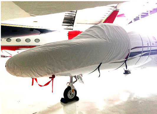
Citation CJ4 Cockpit/Nose Cover and Heat Resistant Pitot Covers set

This cover type is made from Silver Acrylic Sunbrella canvas and is 100% lined with a soft and smooth microfiber. Bruce's Custom Covers developed this material combination especially for aircraft protection. The outer material is medium weight and treated for water resistance, UV resistance and anti-static buildup. The inner lining is a very soft and smooth microfiber to prevent scratching. The material is very reflective, and tests show that the cabin interior temperature can be reduced to near-ambient temperature on the hottest of days. It is water, ice and snow repellent, yet breathable to allow moisture to escape from between the cover and the aircraft surface.