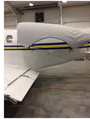
Citationjet 525C, CJ4, Complete Nacelle Cover, light weight Spandex Cessna Citation 560XL Upper Nacelle/Brightwork Covers