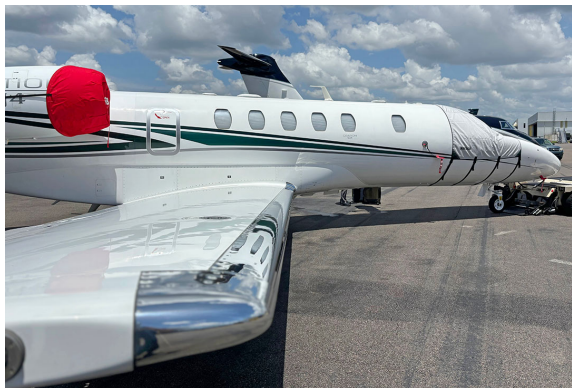
Cessna Citationjet 525C, CJ-4 Cockpit Cover

This cover type is made from Silver Acrylic Sunbrella canvas and is 100% lined with a soft and smooth microfiber. Bruce's Custom Covers developed this material combination especially for aircraft protection. The outer material is medium weight and treated for water resistance, UV resistance and anti-static buildup. The inner lining is a very soft and smooth microfiber to prevent scratching. The material is very reflective, and tests show that the cabin interior temperature can be reduced to near-ambient temperature on the hottest of days. It is water, ice and snow repellent, yet breathable to allow moisture to escape from between the cover and the aircraft surface.