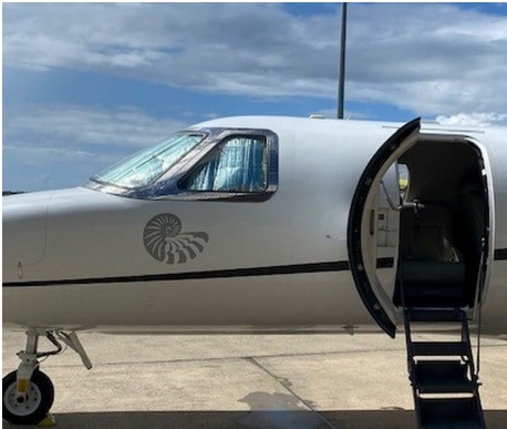
Cessna Citationjet CJ2 Cockpit HeatShields