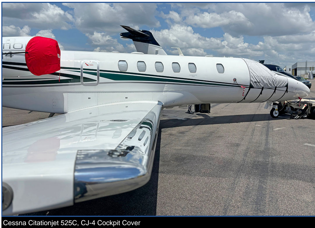
Cessna Citationjet 525C, CJ-4 Cockpit Cover