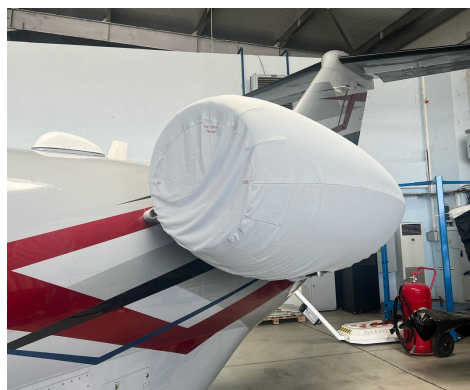
Citationjet 525C, CJ4, Complete Nacelle Cover, light weight Spandex