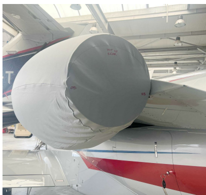
Citationjet 525C, CJ4, Complete Nacelle Cover, light weight Spandex