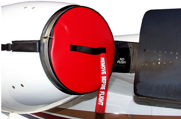
Engine Exhaust Plug