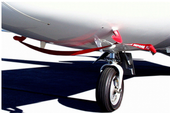
Cessna Citation I Pitot Covers

the engine is still warm. Engine Inlet Plugs are commonly referred to as Cowl Plugs, Intake Plugs, Cowl Blocks, Engine Blocks, and Engine Bung.