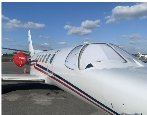
Cessna Citation S550