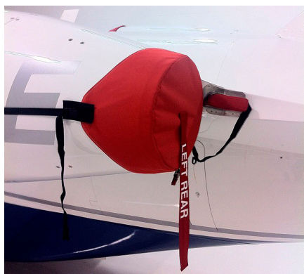
Citation CJ3 Exhaust Cover

The Cessna Citationjet 525B, CJ-3 Intake/Exhaust Plugs are custom fit for the intake and exhaust openings, made with heavy-duty vinyl material, and stuffed with a single block of sculpted urethane foam. Each plug has a zipper that allows the foam to be removed and dried if necessary. Engine plugs have 'remove before flight' streamers sewn onto the face of the plugs. Most plugs are imprinted with the aircraft registration number in black. Engine plugs may be inserted after flight when the engine is still warm. Engine Inlet Plugs are commonly referred to as Cowl Plugs, Intake Plugs, Cowl Blocks, Engine Blocks, and Engine Bungs.