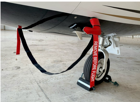
Cessna Citationjet CJ1 Pitot Cover Set