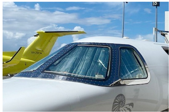
Cessna Citationjet CJ2 Cockpit HeatShields