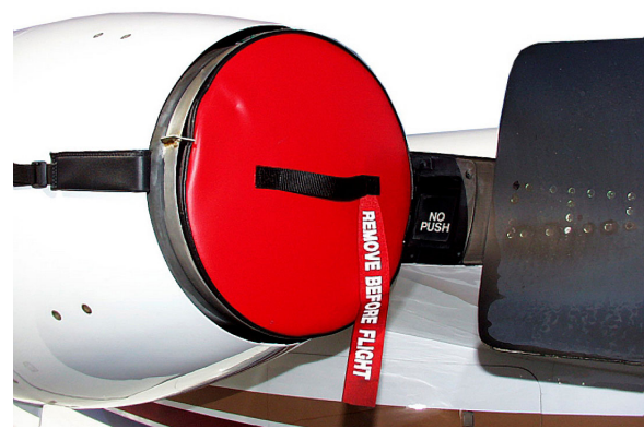
Engine Exhaust Plug