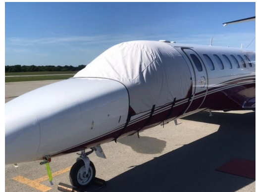
Cessna Citation Jet 525B Cockpit cover