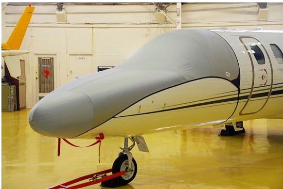
Citationjet CJ3 Cockpit/Nose Travel Cover