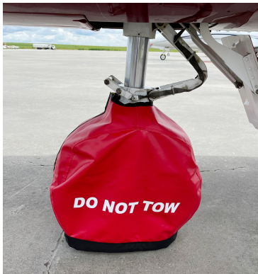
Citationjet CJ-3 Nose Gear Tire Cover

ALL-YEAR USE MATERIAL - Made with Silver Acrylic Sunbrella canvas, the all-year use material is the best option for sun protection and cover longevity. This heavier more durable material is intended for all weather conditions, such as rain and snow or lots of sun.