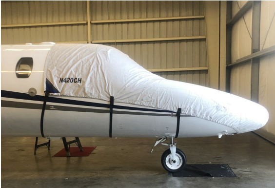
Cessna Citationjet CJ3 Cockpit/Nose Cover

This cover type is made from Silver Acrylic Sunbrella canvas and is 100% lined with a soft and smooth microfiber. Bruce's Custom Covers developed this material combination especially for aircraft protection. The outer material is medium weight and treated for water resistance, UV resistance and anti-static buildup. The inner lining is a very soft and smooth microfiber to prevent scratching. The material is very reflective, and tests show that the cabin interior temperature can be reduced to near-ambient temperature on the hottest of days. It is water, ice and snow repellent, yet breathable to allow moisture to escape from between the cover and the aircraft surface.