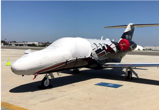
Citationjet CJ1 Cockpit/Nose Cover