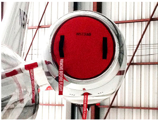
Citation CJ4 Intake Plugs pair

The Engine Inlet Plugs are custom fit for your Cessna Citationjet 525B, CJ-3 intakes, made with heavy-duty vinyl material, and stuffed with a single block of sculpted urethane foam. Each plug has a zipper that allows the foam to be removed and dried if necessary. Engine plugs have 'remove before flight' streamers sewn onto the face of the plugs. Most plugs are imprinted with the aircraft registration number in black for an extra charge. Storage bag NOT included. Engine plugs may be inserted after flight when the engine is still warm. Engine Inlet Plugs are commonly referred to as Cowl Plugs, Intake Plugs, Cowl Blocks, Engine Blocks, and Engine Bungs.