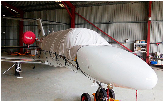
Citation CJ-1 Canopy Cover and Engine Covers