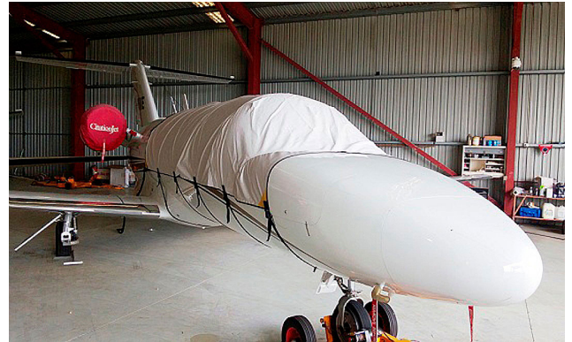
Citation CJ-1 Canopy Cover and Engine Covers