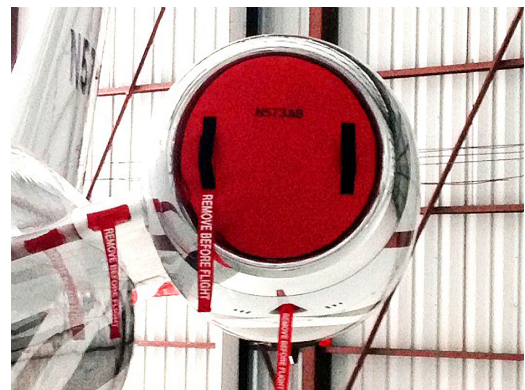
Citation CJ4 Intake Plugs pair