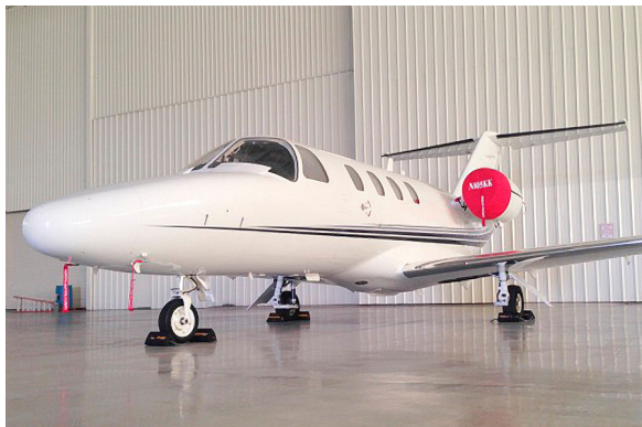
Cessna CJ1 Intake Cover

The Cessna Citationjet 525A, CJ-2, & CJ2+ Intake/Exhaust Plugs are custom fit for the intake and exhaust openings, made with heavy-duty vinyl material, and stuffed with a single block of sculpted urethane foam. Each plug has a zipper that allows the foam to be removed and dried if necessary. Engine plugs have 'remove before flight' streamers sewn onto the face of the plugs. Most plugs are imprinted with the aircraft registration number in black. Engine plugs may be inserted after flight when the engine is still warm. Engine Inlet Plugs are commonly referred to as Cowl Plugs, Intake Plugs, Cowl Blocks, Engine Blocks, and Engine Bungs.