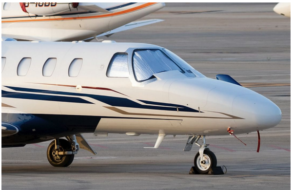
Cessna Citationjet 525, CJ-I, CJ1+, & M2 Cockpit Heatshields