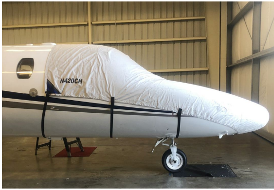
Cessna Citationjet CJ3 Cockpit/Nose Cover