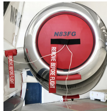
Cessna Citation Mustang 510 Engine Plugs