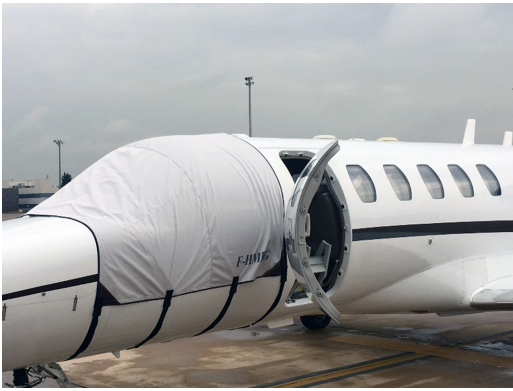
Cessna Citationjet Cockpit Cover, Convenient entry door access