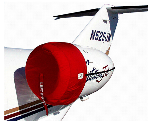
Engine Inlet Cover