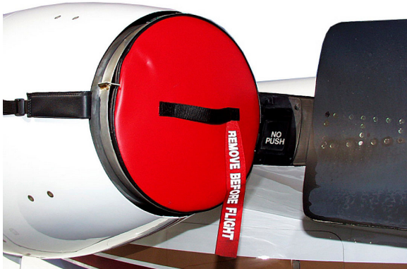
Engine Exhaust Plug

The Engine Inlet Plugs are custom fit for your Cessna Citationjet 525A, CJ-2, & CJ2+ intakes, made with heavy-duty vinyl material, and stuffed with a single block of sculpted urethane foam. Each plug has a zipper that allows the foam to be removed and dried if necessary. Engine plugs have 'remove before flight' streamers sewn onto the face of the plugs. Most plugs are imprinted with the aircraft registration number in black for an extra charge. Storage bag NOT included. Engine plugs may be inserted after flight when the engine is still warm. Engine Inlet Plugs are commonly referred to as Cowl Plugs, Intake Plugs, Cowl Blocks, Engine Blocks, and Engine Bungs.