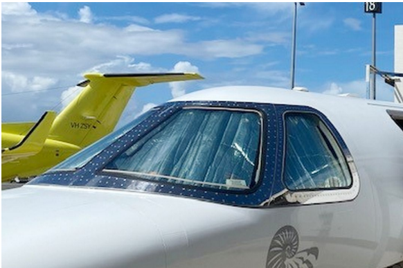
Cessna Citationjet CJ2 Cockpit HeatShields

Custom-made Heatshield Sunshades are available for almost any window in the jet. Side windows, Skylights, and Emergency Exits are all custom-made. The product is a unique composite of closed-cell foam with a silver mylar finish. The set is easily stored in the included storage sleeve. Some designs may require velcro and suction cups. Our Heatshields are offered white side out since aircraft manufacturers have issued advisories against reflective window inserts due to potential heat damage.