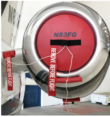
Cessna Citation Mustang 510 Engine Plugs