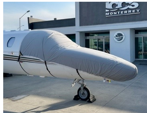
Citation CJ4 Cockpit/Nose Cover and Heat Resistant Pitot Covers set Cessna Citationjet 525B Travel Weight Cockpit/Nose Cover