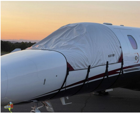
Cessna Citation Jet 525 Cockpit Cover