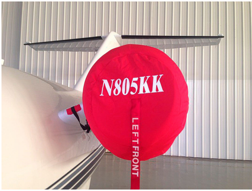
Cessna CJ1 Intake Cover and Inlet Plug