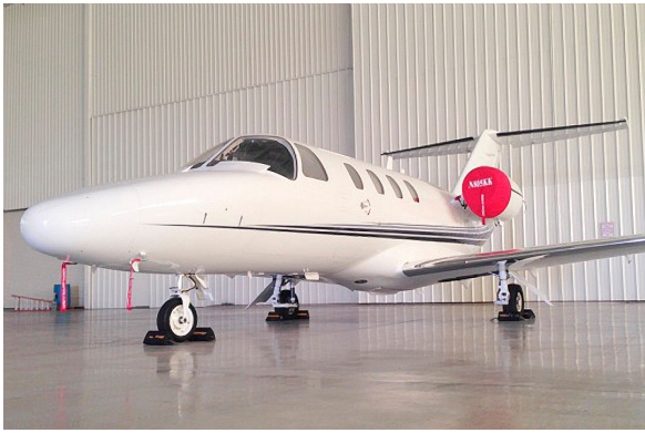
Cessna CJ1 Intake Cover