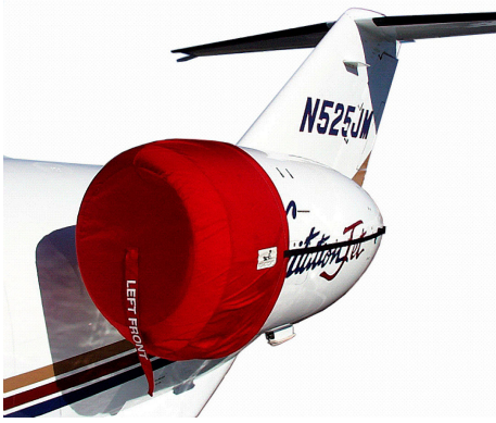
Engine Inlet Cover