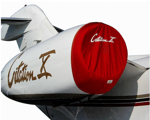
Citation X Intake Covers

The Cessna Citation X (750) Intake Covers are designed to install easily yet be completely storable. A spring steel hoop is sewn into the hem of each cover, allowing them to be installed without climbing onto the wing or using a stepladder. To store the covers the spring steel hoop folds like a band-saw blade into three nesting rings. Each cover folds into a compact circular bundle which is stored in the included duffle bag, yet they unfold quickly for use. The Tri-Fold Ring cover is made of medium weight nylon which is available in a variety of colors to match the paint trim. Each cover set comes complete with installation and folding instructions. The aircraft's registration number can be silkscreened onto the cover for an extra charge.