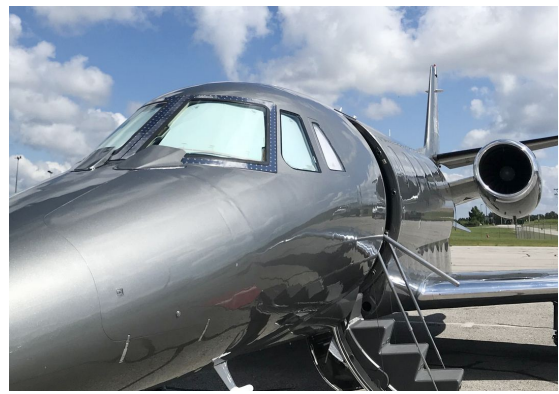
Cessna Citation 560XL Cockpit HeatShields