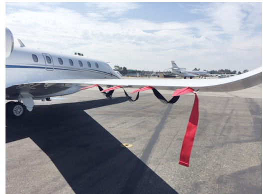
Citation X Static Wick Protectors