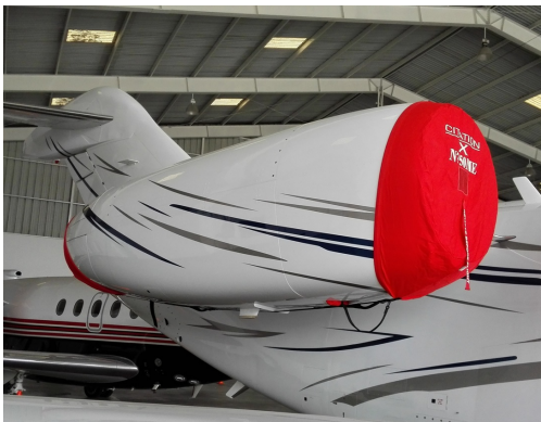
Citation X Intake/Exhaust Cover Set