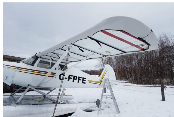
Christavia MK1 Wing Covers