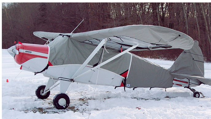
Piper Clipper Canopy Cover, Empennage & Wing Covers, Engine Plugs

WINTER USE MATERIAL - Made with Solution-Dyed Polyester fabric, this option is intended for seasonal use to aid in deicing, rain mitigation, or for occasional travel. The material is lighter and more compact, but more susceptible to UV damage and may have a shorter useful life if used continuously outside than the all-year use material.