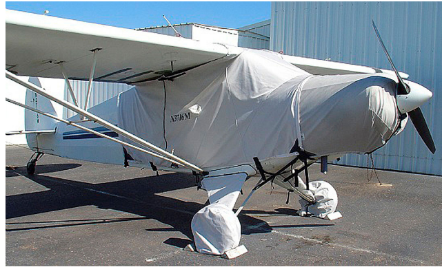
Piper PA-12 Extended Canopy, Engine & Landing Gear Covers