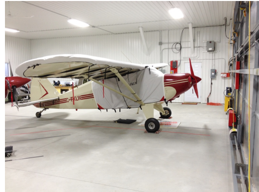
Piper PA-20 Extended Canopy Cover, Wing Covers