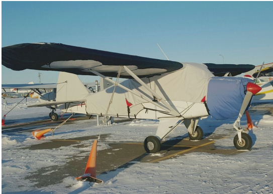
PA-20 Cover Set

This cover type is made from Silver Acrylic Sunbrella canvas and is 100% lined with a soft and smooth microfiber. Bruce's Custom Covers developed this material combination especially for aircraft protection. The outer material is medium weight and treated for water resistance, UV resistance and anti-static buildup. The inner lining is a very soft and smooth microfiber to prevent scratching. The material is very reflective, and tests show that the cabin interior temperature can be reduced to near-ambient temperature on the hottest of days. It is water, ice and snow repellent, yet breathable to allow moisture to escape from between the cover and the aircraft surface.