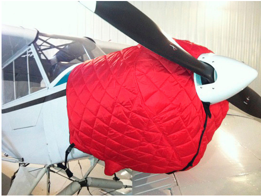
Piper Super Cub Insulated Engine Cover

Insulated Covers Material - A special composite material of solution-dyed polyester, 3M Thinsulate insulation, and soft nylon interior fabric. Our insulated covers are designed to complement an engine preheater and help retain heat in the engine compartment after shutdown. If you operate your aircraft in cold-weather, these covers will help prevent engine wear and tear.