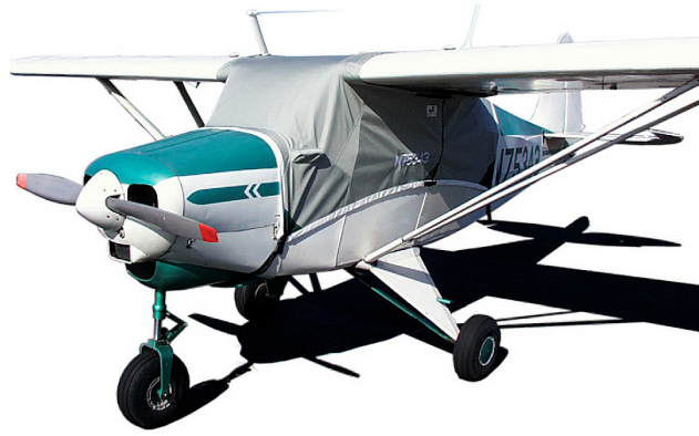
Tri-Pacer Over-the-Top Canopy Cover

occasional use outside. We also have an ultra lightweight material available for fitted hangar dust covers. For daily outdoor use, the non-travel Sunbrella Cover is the best choice.