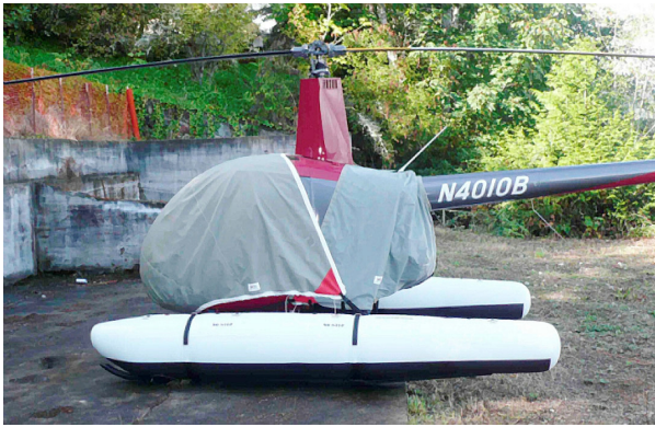
Robinson R-22 Standard Bubble Cover & Engine Cover

WINTER USE MATERIAL - Made with Solution-Dyed Polyester fabric, this option is intended for seasonal use to aid in deicing, rain mitigation, or for occasional travel. The material is lighter and more compact, but more susceptible to UV damage and may have a shorter useful life if used continuously outside than the all-year use material.