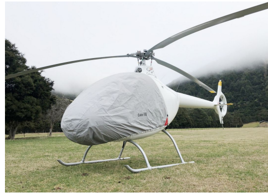
Guimbal Cabri CG2 Bubble Cover, light weight travel type