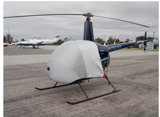
Robinson R-22 Light Weight Travel Cover