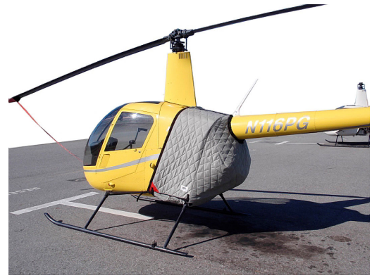
Robinson R-22 Insulated Engine Cover (also covers bottom) & Front Blade Tie-down