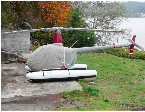
Robinson R-22 Bubble Cover (Ext. Past Rotor Hub), Engine Cover, Tailboom Cover, Blade Covers, Rotor Hub Cover, & Tail Rotor Gear Box Cover