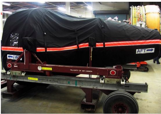
CFM-56-5A/5B Off-link Engine Shipper/Transport cover, w/ Exhaust Cone, fully enclosed