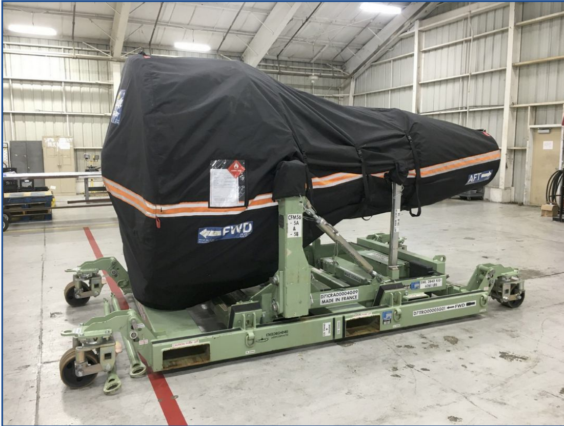
CFM56-5B Off Link Cover, fully enclosed