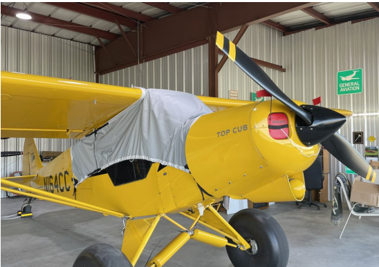
Cub Crafters CC-18 Light Weight Travel Canopy Cover, Engine Plugs