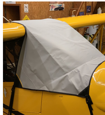
Cub Crafters Carbon Cub FX3 Windshield/Skylight Cover, travel weight