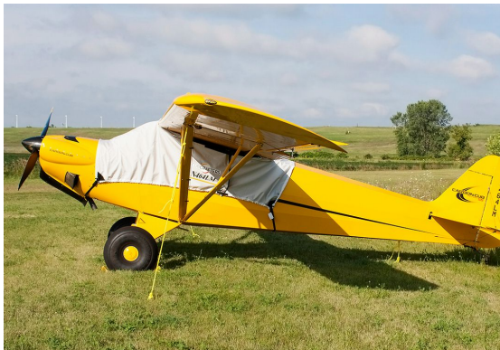
Cub Crafters Canopy Cover

This cover type is made from Silver Acrylic Sunbrella canvas and is 100% lined with a soft and smooth microfiber. Bruce's Custom Covers developed this material combination especially for aircraft protection. The outer material is medium weight and treated for water resistance, UV resistance and anti-static buildup. The inner lining is a very soft and smooth microfiber to prevent scratching. The material is very reflective, and tests show that the cabin interior temperature can be reduced to near-ambient temperature on the hottest of days. It is water, ice and snow repellent, yet breathable to allow moisture to escape from between the cover and the aircraft surface.