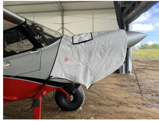
Cub Crafters CC-19 Engine Cover