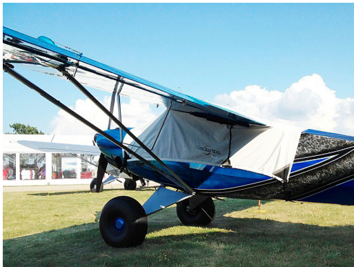
Cub Crafters Carbon Cub Canopy Cover

This cover type is made from Silver Acrylic Sunbrella canvas and is 100% lined with a soft and smooth microfiber. Bruce's Custom Covers developed this material combination especially for aircraft protection. The outer material is medium weight and treated for water resistance, UV resistance and anti-static buildup. The inner lining is a very soft and smooth microfiber to prevent scratching. The material is very reflective, and tests show that the cabin interior temperature can be reduced to near-ambient temperature on the hottest of days. It is water, ice and snow repellent, yet breathable to allow moisture to escape from between the cover and the aircraft surface.