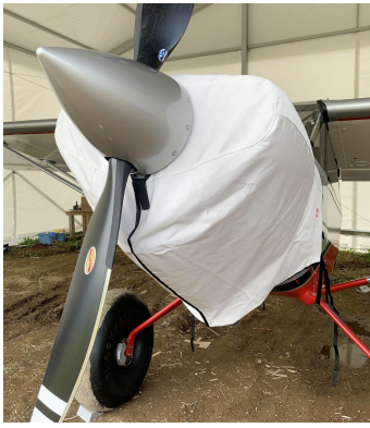
Cub Crafters CC-19 Engine Cover