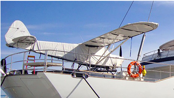
Piper PA-18 Super Cub Complete Cover set

WINTER USE MATERIAL - Made with Solution-Dyed Polyester fabric, this option is intended for seasonal use to aid in deicing, rain mitigation, or for occasional travel. The material is lighter and more compact, but more susceptible to UV damage and may have a shorter useful life if used continuously outside than the all-year use material.