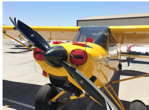
Cub Crafters CC-11 Carbon Cub Engine Plugs