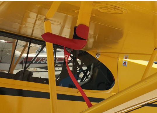
Cub Crafters CC-11 Carbon Cub Pitot Cover

Engine Inlet Plugs are custom fit for your CubCrafters CC-18, 19, 20, Top Cub, CCK-1865, CC-19 X-Cub, CCX-2000, EX-3, FX-3 intakes, made with heavy-duty vinyl material, and stuffed with a single block of sculpted urethane foam. Each plug has a zipper that allows the foam to be removed and dried if necessary. Engine plugs have warning flags that are visible from the cockpit or 'remove before flight' streamers sewn onto the face of the plugs. Most plugs are imprinted with the aircraft registration number in black for an extra charge. Storage bag NOT included. Engine plugs may be inserted after flight when the engine is still warm. Engine Inlet Plugs are commonly referred to as Cowl Plugs, Intake Plugs, Cowl Blocks, Engine Blocks, and Engine Bungs.