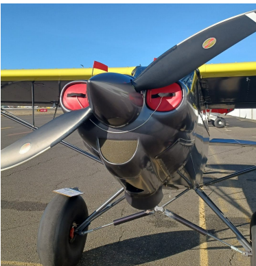
CubCrafters FX-3 Engine Inlet Plugs

Engine Inlet Plugs are custom fit for your CubCrafters CC-18, 19, 20, Top Cub, CCK-1865, CC-19 X-Cub, CCX-2000, EX-3, FX-3 intakes, made with heavy-duty vinyl material, and stuffed with a single block of sculpted urethane foam. Each plug has a zipper that allows the foam to be removed and dried if necessary. Engine plugs have warning flags that are visible from the cockpit or 'remove before flight' streamers sewn onto the face of the plugs. Most plugs are imprinted with the aircraft registration number in black for an extra charge. Storage bag NOT included. Engine plugs may be inserted after flight when the engine is still warm. Engine Inlet Plugs are commonly referred to as Cowl Plugs, Intake Plugs, Cowl Blocks, Engine Blocks, and Engine Bunges.