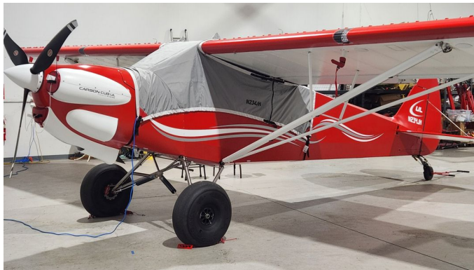
CubCrafters Carbon Cub Travel Canopy Cover