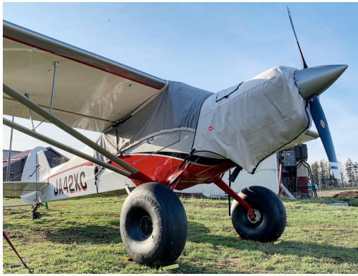
Cub Crafters CC19 X-Cub Engine Cover, Travel Weight Canopy Cover