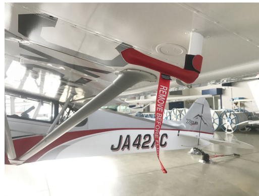
Cub Crafters X Cub CC19-180 Pitot Cover Long L-Type