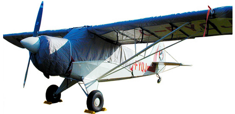
Aviat Husky Insulated Engine Cover, Canopy & Wing Covers