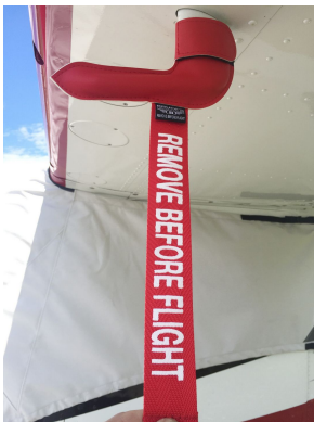
Cessna A185F Pitot Cover

Engine Inlet Plugs are custom fit for your CubCrafters CC-11, Sport Cub S2, & Carbon Cub intakes, made with heavy-duty vinyl material, and stuffed with a single block of sculpted urethane foam. Each plug has a zipper that allows the foam to be removed and dried if necessary. Engine plugs have warning flags that are visible from the cockpit or 'remove before flight' streamers sewn onto the face of the plugs. Most plugs are imprinted with the aircraft registration number in black for an extra charge. Storage bag NOT included. Engine plugs may be inserted after flight when the engine is still warm. Engine Inlet Plugs are commonly referred to as Cowl Plugs, Intake Plugs, Cowl Blocks, Engine Blocks, and Engine Bungs.