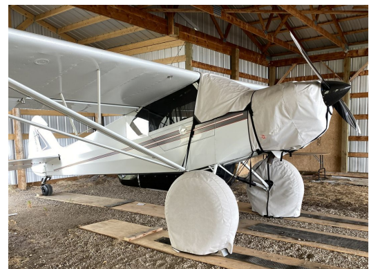
CubCrafters CC-11 Windshield, Engine & Tire Covers