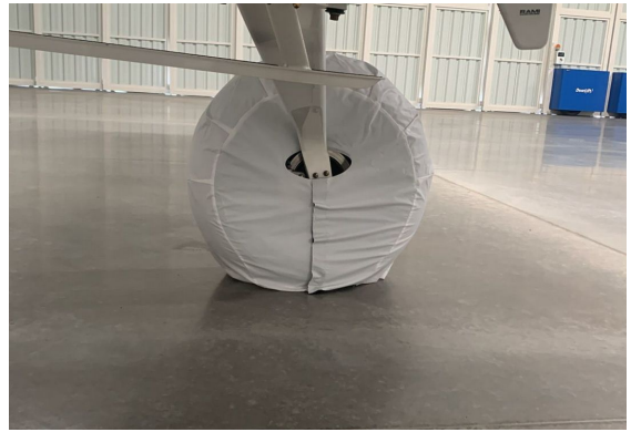
Cub Crafters Tire Covers, tricycle gear, test fit covers