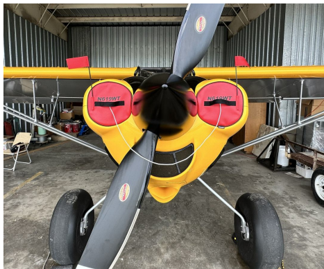
Cub Crafters CC-19 X-Cub Engine Plugs

Engine Inlet Plugs are custom fit for your CubCrafters CC-11, Sport Cub S2, & Carbon Cub intakes, made with heavy-duty vinyl material, and stuffed with a single block of sculpted urethane foam. Each plug has a zipper that allows the foam to be removed and dried if necessary. Engine plugs have warning flags that are visible from the cockpit or 'remove before flight' streamers sewn onto the face of the plugs. Most plugs are imprinted with the aircraft registration number in black for an extra charge. Storage bag NOT included. Engine plugs may be inserted after flight when the engine is still warm. Engine Inlet Plugs are commonly referred to as Cowl Plugs, Intake Plugs, Cowl Blocks, Engine Blocks, and Engine Bungs.