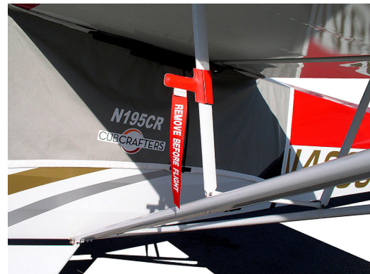
Cub Crafters Sport Cub Pitot Cover