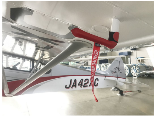
Cub Crafters X Cub CC19-180 Pitot Cover Long L-Type