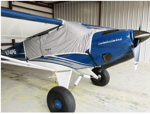
Cub Crafters Carbon Cub Travel Weight Canopy Cover