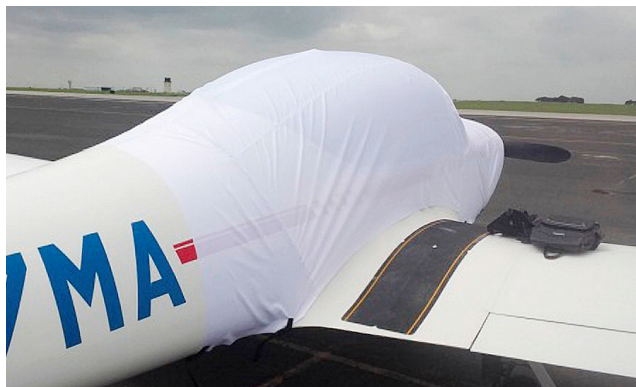
Taifun 17E Canopy/Engine Cover, test fit cover