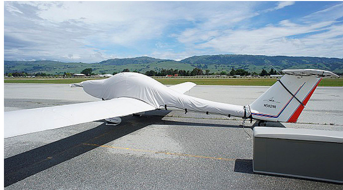
Lambda Canopy/Engine Cover and Wing Covers Grob 109 Canopy/Engine w/ extension to tail, Wing, Stabilizer & Prop/Spinner Covers