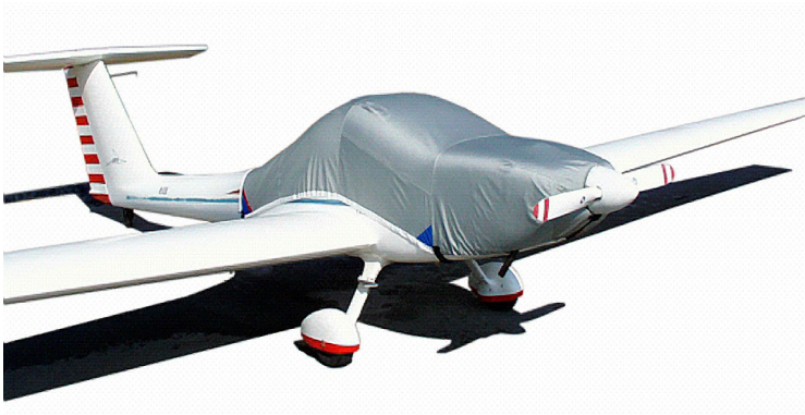
Grob 109 Canopy/Engine Cover