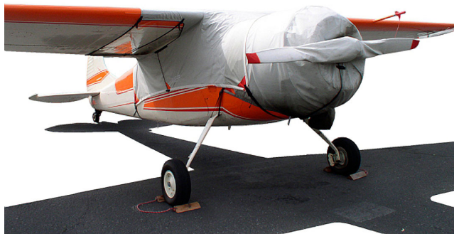
Cessna 195 Over-Top Canopy, Engine & Prop Covers