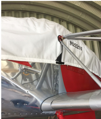
Callair A-2 Canopy Cover