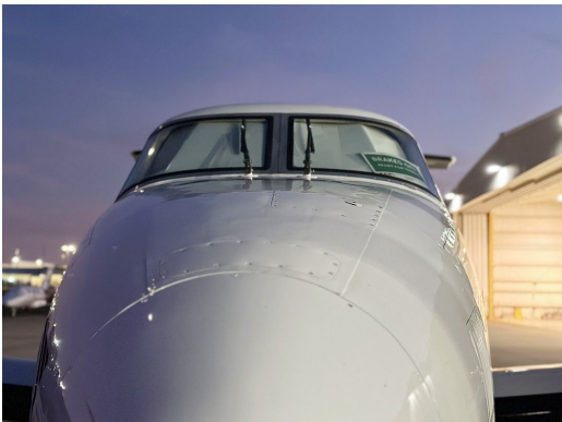
Beechcraft B200 Cockpit Heatshields