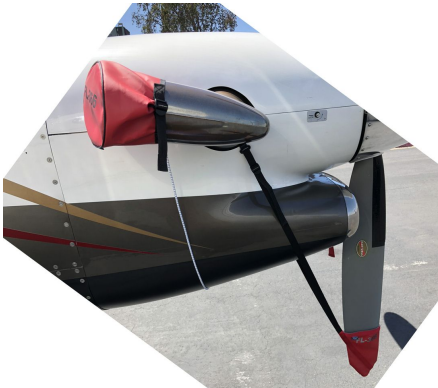
Beech King Air 350 Prop Tie-Downs/Exhaust Covers Combination

This cover type is made from Silver Acrylic Sunbrella canvas and is 100% lined with a soft and smooth microfiber. Bruce's Custom Covers developed this material combination especially for aircraft protection. The outer material is medium weight and treated for water resistance, UV resistance and anti-static buildup. The inner lining is a very soft and smooth microfiber to prevent scratching. The material is very reflective, and tests show that the cabin interior temperature can be reduced to near-ambient temperature on the hottest of days. It is water, ice and snow repellent, yet breathable to allow moisture to escape from between the cover and the aircraft surface.