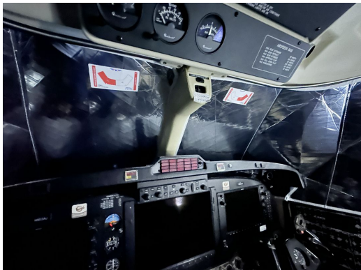
Beechcraft B200 Cockpit Heatshields

Cockpit Heatshields are interior sunshades for the aircraft's cockpit. The product is a unique composite of closed-cell foam with a silver mylar finish. The semi-rigid design is stiff enough to stand inside the window framing. The set folds up flat and is easily stored in the included storage sleeve. Some designs may require velcro and suction cups. A Heatshield is an excellent short-term remedy for cockpit overheating, but an external fabric cover is more effective for long-term protection.