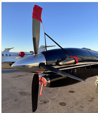
Beech King Air C90A Plug & Prop Tie Set

This cover type is made from Silver Acrylic Sunbrella canvas and is 100% lined with a soft and smooth microfiber. Bruce's Custom Covers developed this material combination especially for aircraft protection. The outer material is medium weight and treated for water resistance, UV resistance and anti-static buildup. The inner lining is a very soft and smooth microfiber to prevent scratching. The material is very reflective, and tests show that the cabin interior temperature can be reduced to near-ambient temperature on the hottest of days. It is water, ice and snow repellent, yet breathable to allow moisture to escape from between the cover and the aircraft surface.