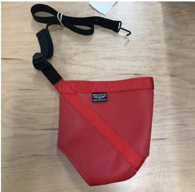
Prop Tie-Down, Various Models (secures with a hook to engine nacelle)