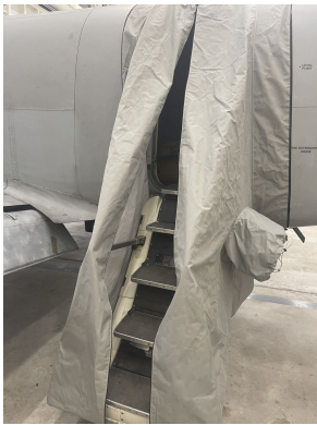
King Air Airstair Coor Cover