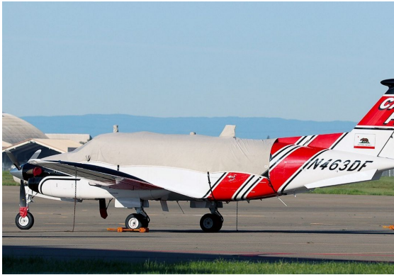
Beech King Air B200 Canopy/Nose Cover

The material is very reflective, and tests show that the cabin interior temperature can be reduced to near-ambient temperature on the hottest of days. It is water, ice and snow repellent, yet breathable to allow moisture to escape from between the cover and the aircraft surface.