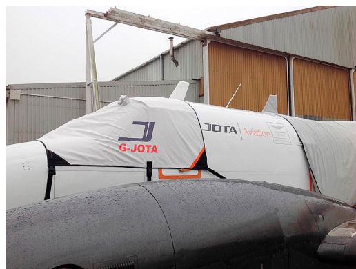
King Air Windshield/Cockpit Cover