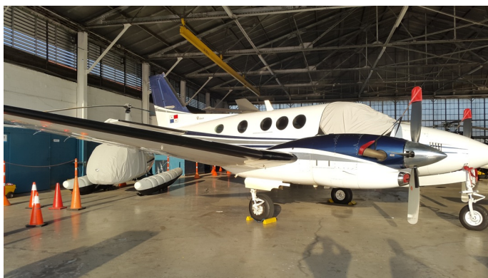
Raytheon Beech King Air Cockpit Cover, Prop Tie/Exhaust Covers, Inlet Plugs