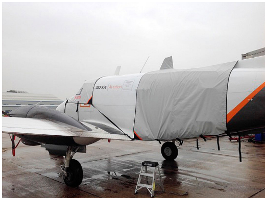
King Air Cargo/Jump Door Rain Cover

The material is very reflective, and tests show that the cabin interior temperature can be reduced to near-ambient temperature on the hottest of days. It is water, ice and snow repellent, yet breathable to allow moisture to escape from between the cover and the aircraft surface.