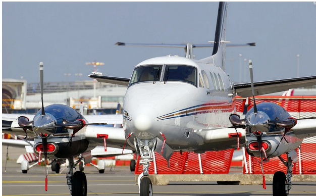
Beech King Air C90A Engine Plugs & Prop Tie/Exhaust Covers