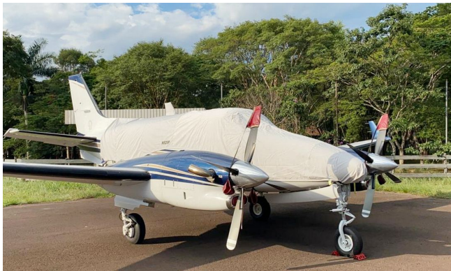
King Air C90GTi Canopy/Nose Cover