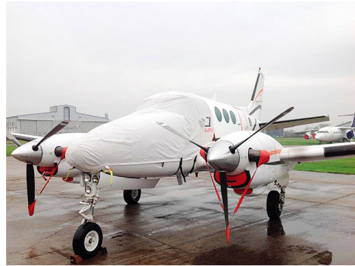
King Air Cockpit/Nose Cover, Plugs, Prop Tie/Exhaust Covers