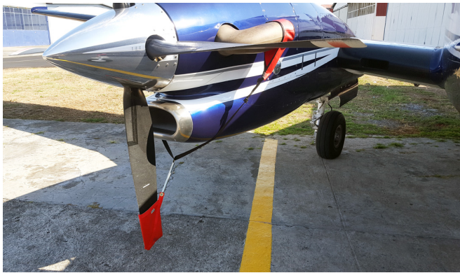
Beech King Air C90A Prop Tie-Downs/Exhaust Covers

the hottest of days. It is water, ice and snow repellent, yet breathable to allow moisture to escape from between the cover and the aircraft surface.