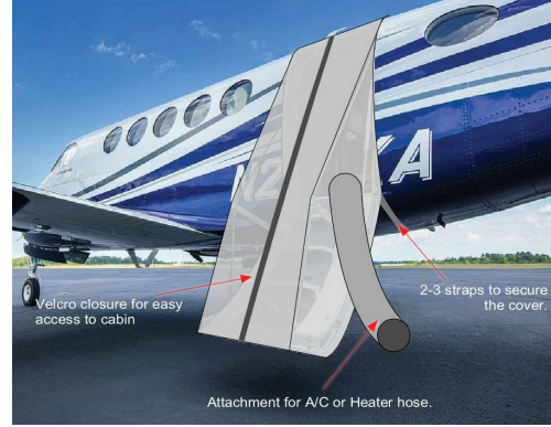
King Air Airstair Coor Cover