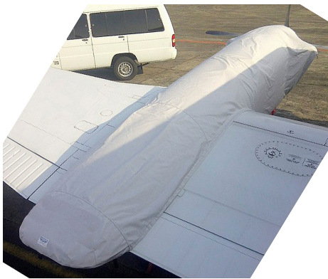
King Air 350 Engine Cover

ALL-YEAR USE MATERIAL - Made with Silver Acrylic Sunbrella canvas, the all-year use material is the best option for sun protection and cover longevity. This heavier more durable material is intended for all weather conditions, such as rain and snow or lots of sun.