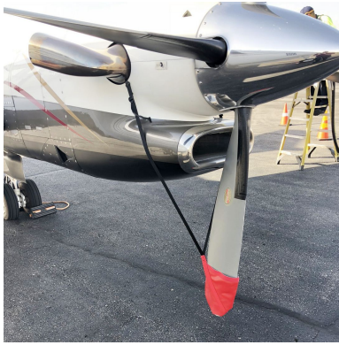
Beech King Air 350 Prop Tie-Downs

the hottest of days. It is water, ice and snow repellent, yet breathable to allow moisture to escape from between the cover and the aircraft surface.