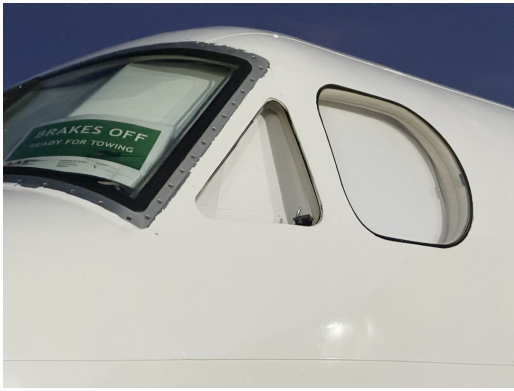
Beechcraft B200 Cockpit Heatshields