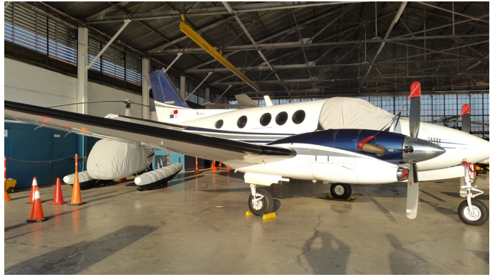
King Air C90 Insulated Engine Cover, 3D model Raytheon Beech King Air Cockpit Cover, Prop Tie/Exhaust Covers, Inlet Plugs