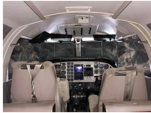
Beech King Air 90 & 100 (U-21, RU-21, T-44) Cockpit Heatshields