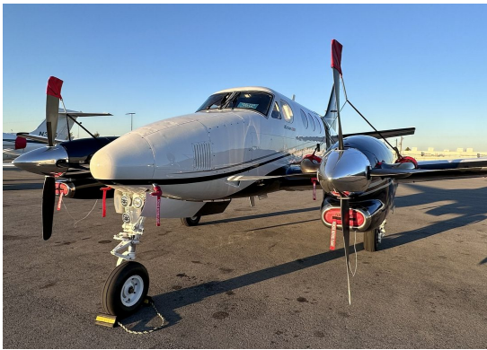
Beech King Air C90A Plug & Prop Tie Set