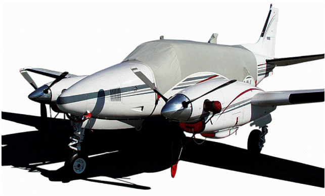
King Air Canopy Cover, Engine Plugs, Prop-Tie/Exhaust Covers