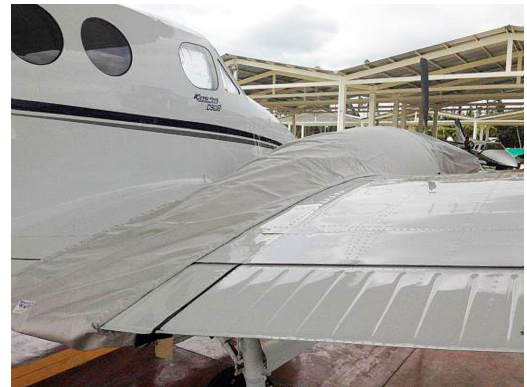
King Air C90 Engine Cover