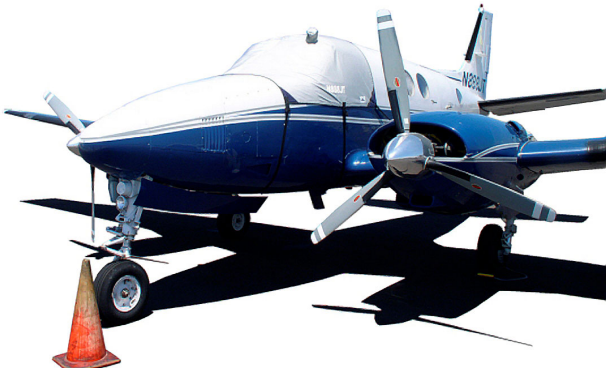
Beech King Air Windshield Cover