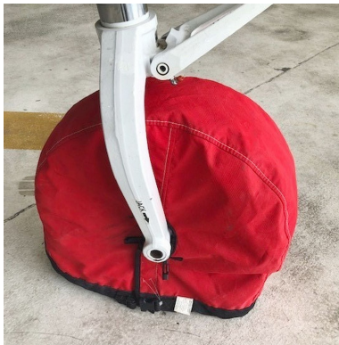
Beech King Air 300 Tire Covers (nose gear)

ALL-YEAR USE MATERIAL - Made with Silver Acrylic Sunbrella canvas, the all-year use material is the best option for sun protection and cover longevity. This heavier more durable material is intended for all weather conditions, such as rain and snow or lots of sun.