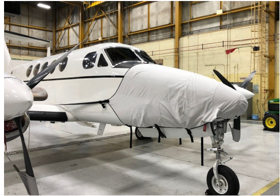
King Air 200 Nose Cover