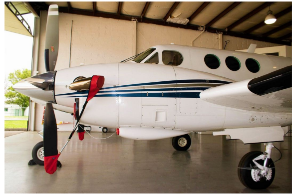
Beech King Air C90A Engine/Oil Cooler Inlet Plugs