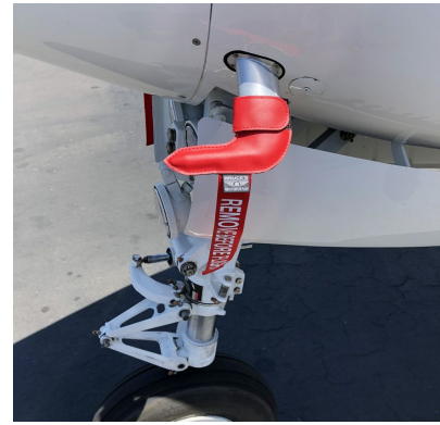
Beech King Air Pitot Covers