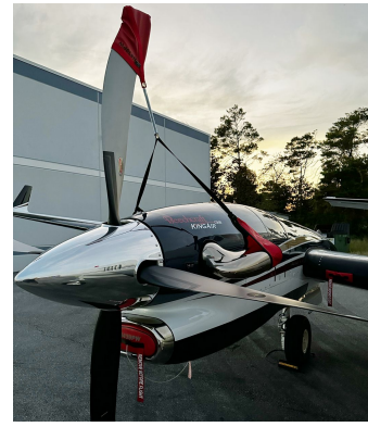
Beech King Air C90A Prop-Tie-Down/Exhaust Covers