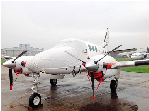
King Air Cockpit/Nose Cover, Plugs, Prop Tie/Exhaust Covers

Travel Covers are made with Silver Solution-Dyed Polyester fabric and only lined over the windshield to save weight. The material is lightweight and more compact for easy stowage in the aircraft. The polyester material is water resistant, but only intended for occasional use outside. We also have an ultra lightweight material available for fitted hangar dust covers. For daily outdoor use, the non-travel Sunbrella Cover is the best choice.